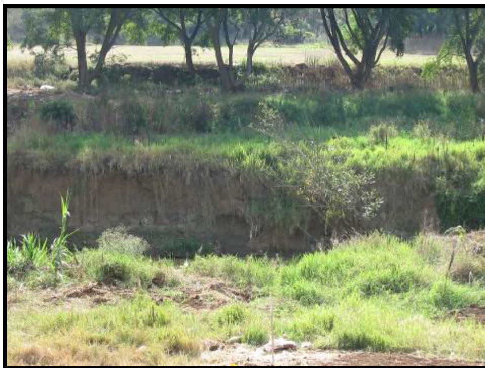
Figure 2. Location of the proposed Woodhouse Road Pedestrian Bridge.