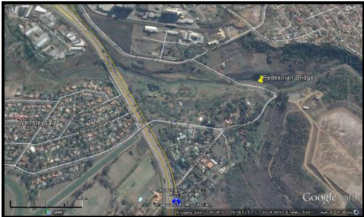
Figure 1. Google Aerial map showing the location of Woodhouse Road Pedestrian Bridge.