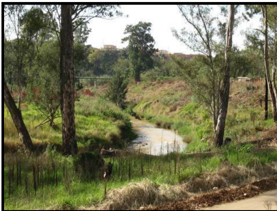
Figure 2. Location of the proposed Woodhouse Road Pedestrian Bridge. Msunduzi River in the distance.