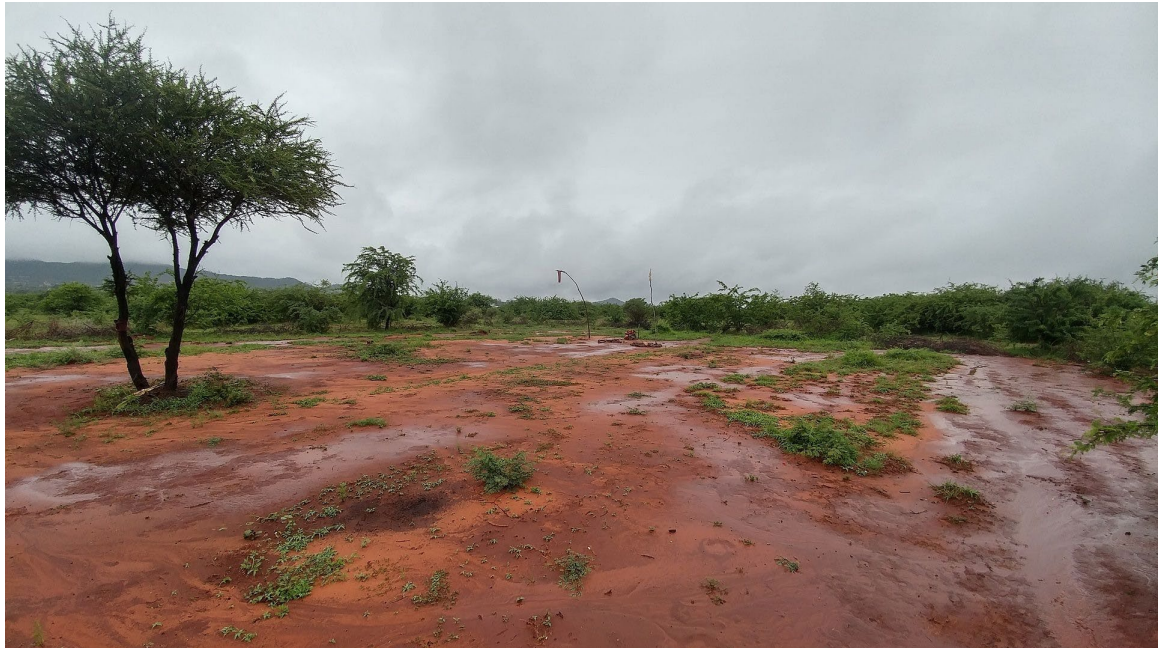
Photograph 9: Site 1 (as indicated on the track route): Contemporary religious site

During the site visit/field work indication of spiritual activity was observed on the site earmarked for development.