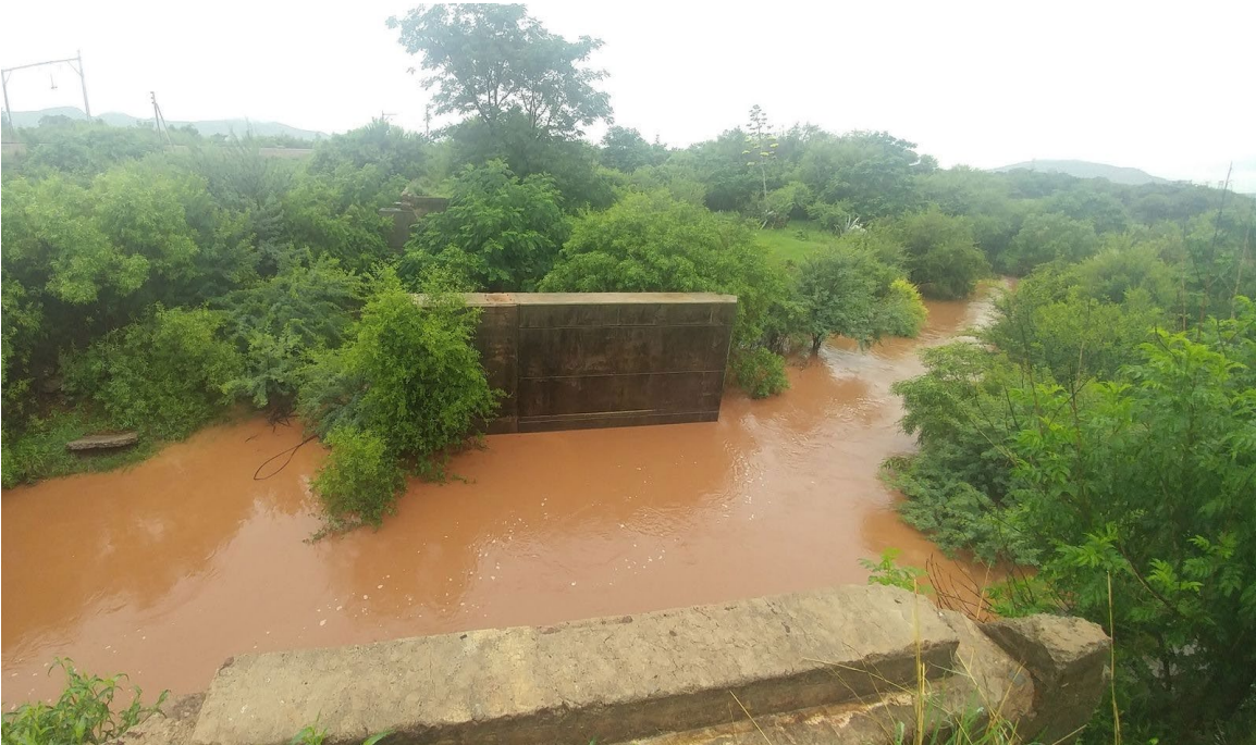
Photograph 7: Existing bridge (north)