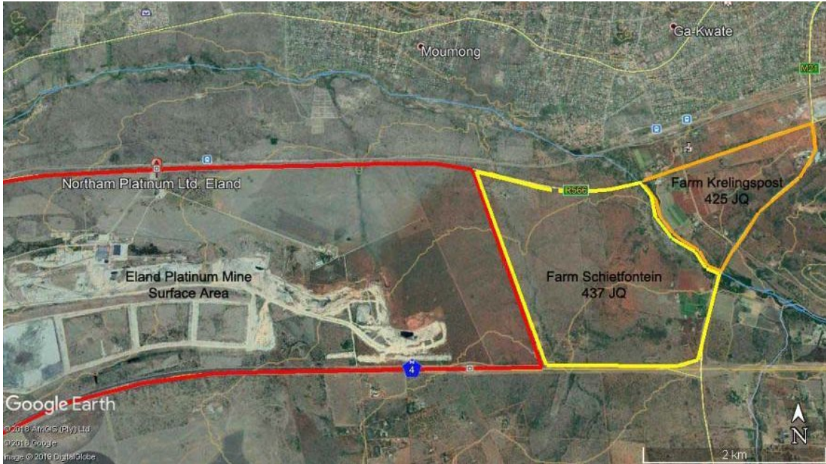
Figure 2: Aerial locality map of the EM Surface Area and Proposed Schietfontein and Krelingspost Prospecting Area