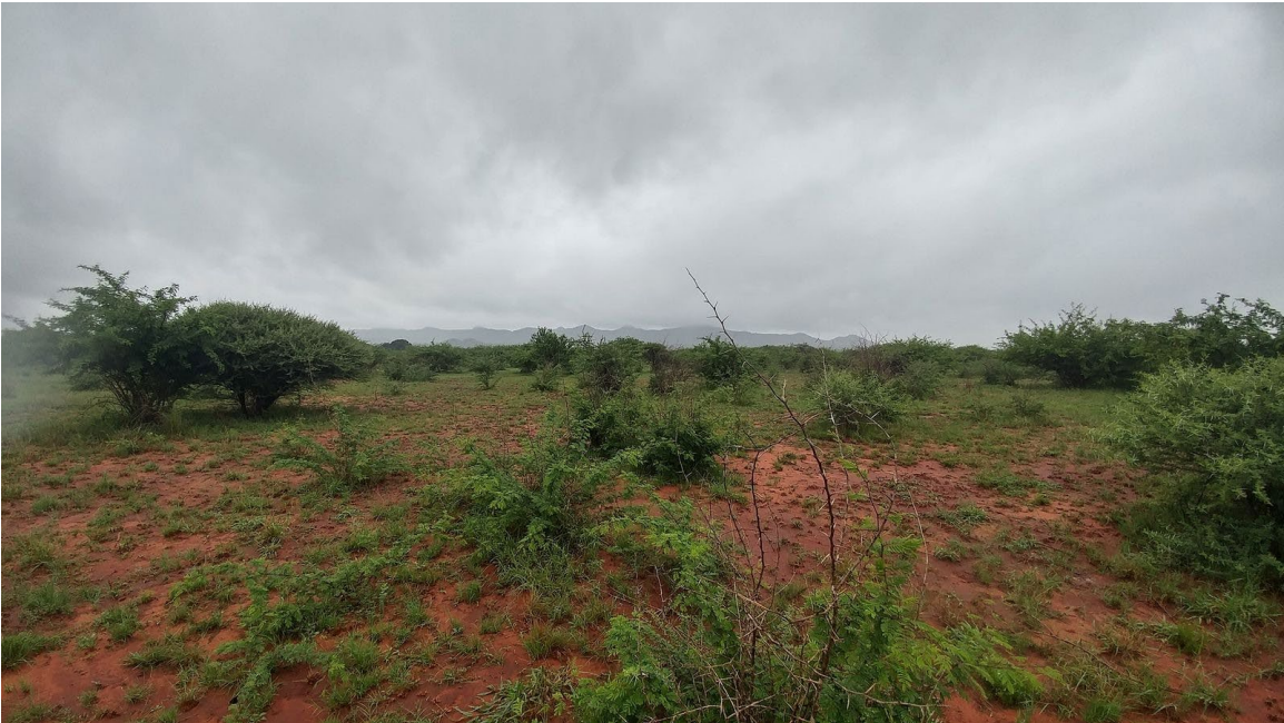
Photograph 5: General site characteristics