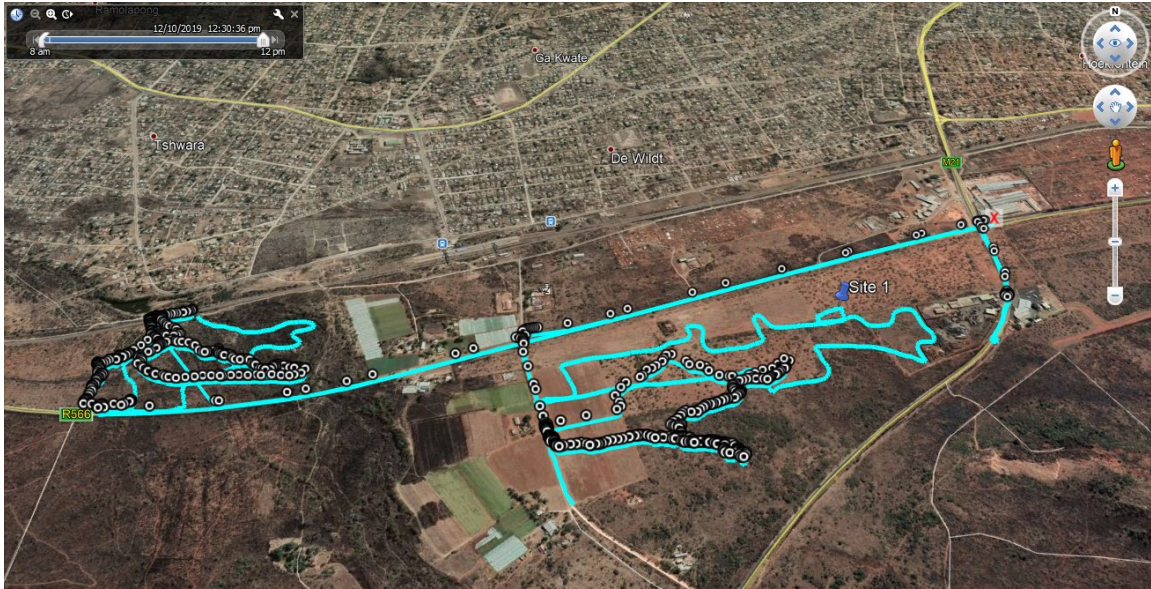
Figure 4: Track route during site investigation