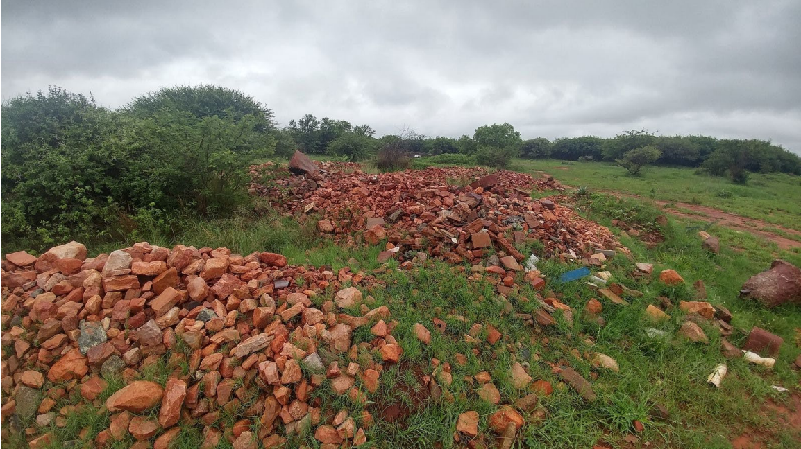
Photograph 2: Dumping in the east