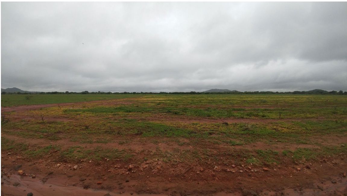
Photograph 1: Cultivated land in the east