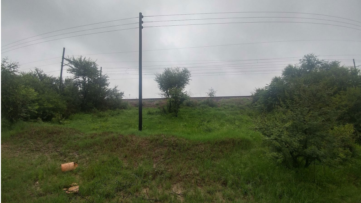
Photograph 8: Train track (north)