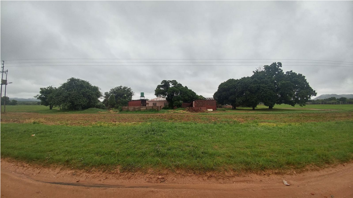
Photograph 3: Homestead (structures older than 60 years are situated here)