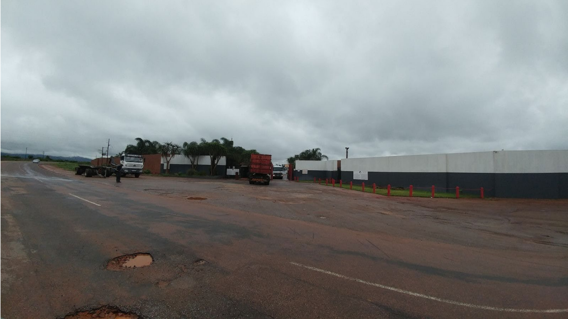
Photograph 6: General site characteristics: Industrial buildings (east)