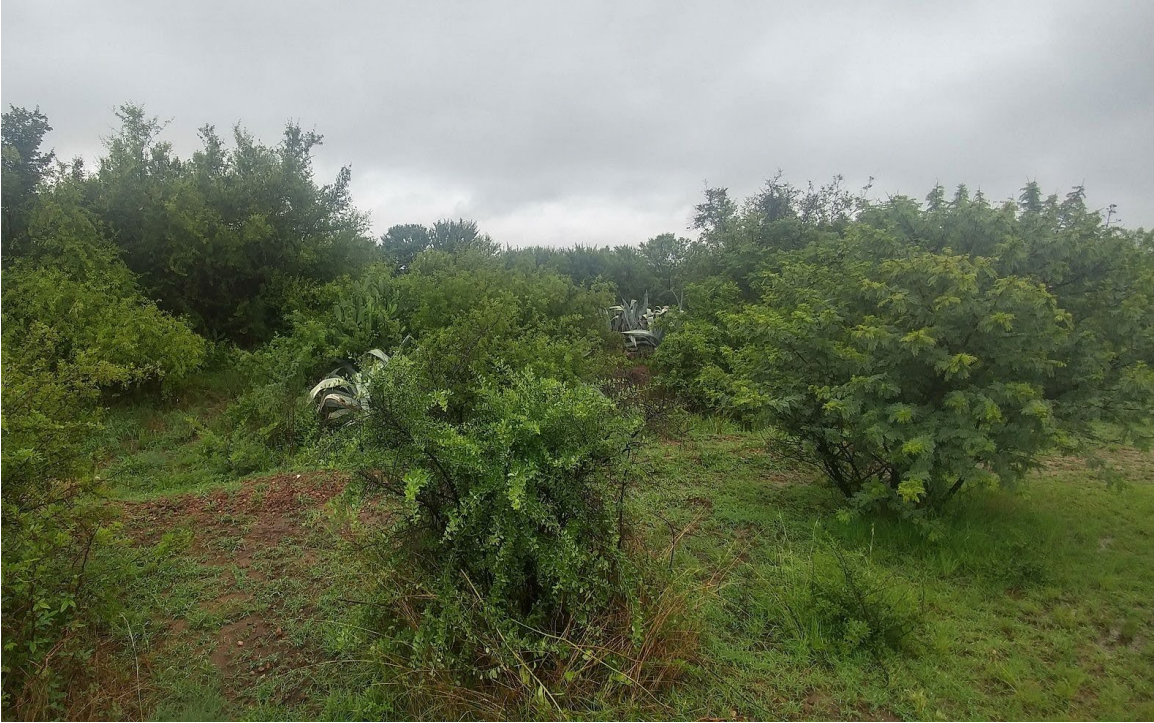
Photograph 4: General site characteristics