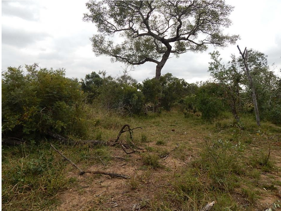
Fig. 27: The area for the Main building will be used as the center for the lodge (loungue, deck, kitchen, restaurant etc.)