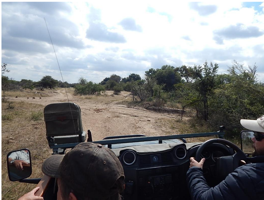
Fig. 10: Existing access roads will be used near the Lodge unit section.