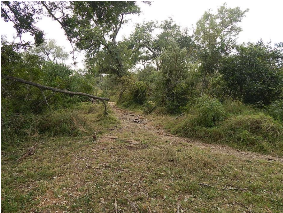
Fig. 26: Unit 6 is further from the tributary, and near the current eastern access road.