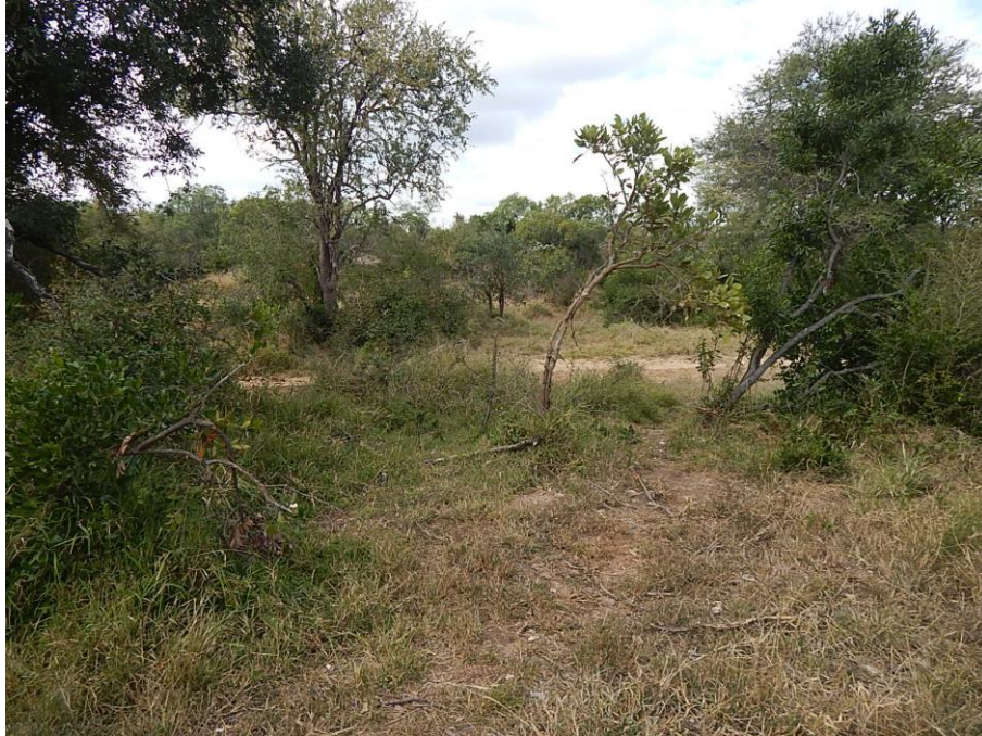
Fig. 25: Unit 5 is slightly elevated from the tributary.