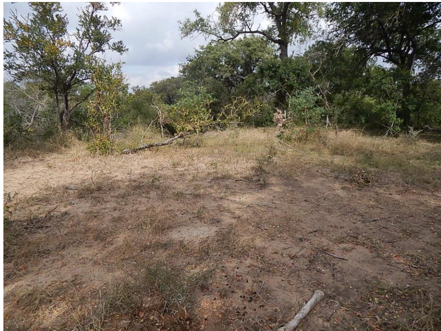
Fig. 20: Another view of the Gym area.