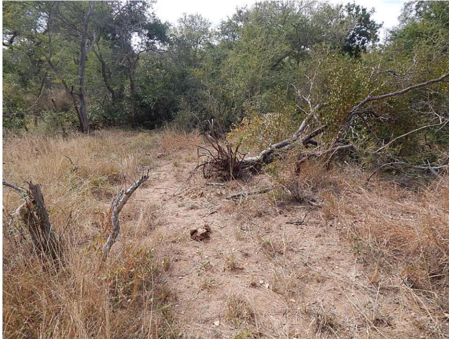
Fig. 21: Unit 4 is slightly elevated from the tributary. Visibility was excellent.