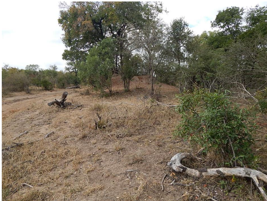
Fig. 16: Unit 2 borders on an existing access road in the east.