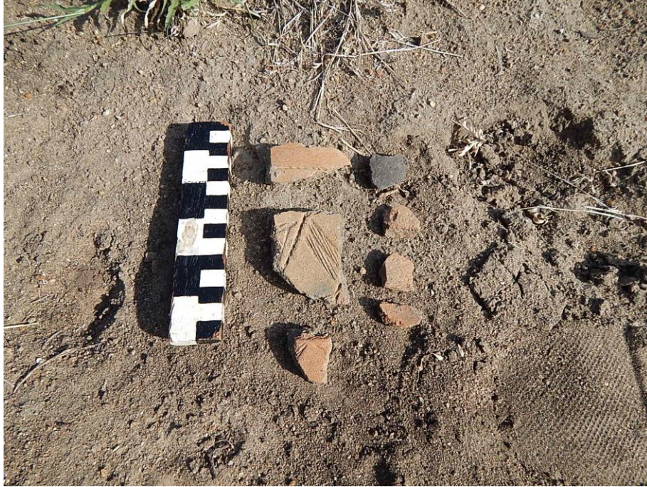
Fig. 5: Some decorated and undecorated clay potsherds were observed to the north of the staff housing site (between the access road and the proposed site).