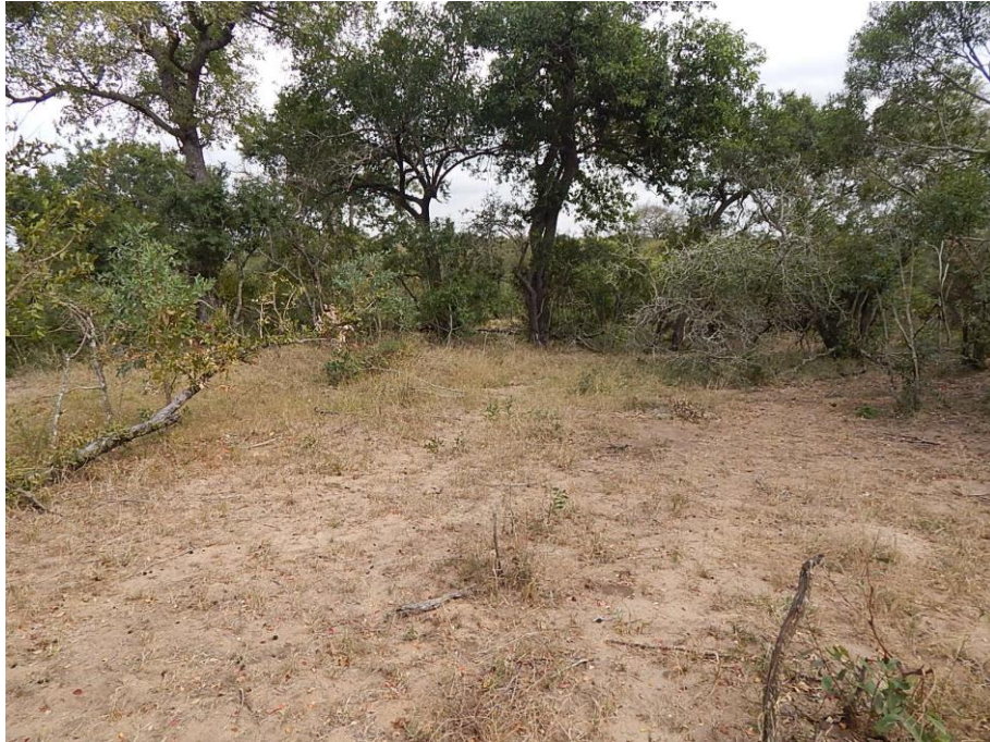
Fig. 19: The Gym area is facing the tributary. Visibility was excellent.