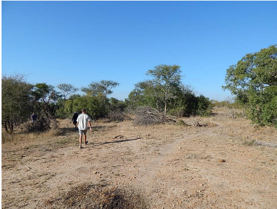
Fig. 1: A general view of the northern section of the proposed staff housing site. This section was historically cultivated.