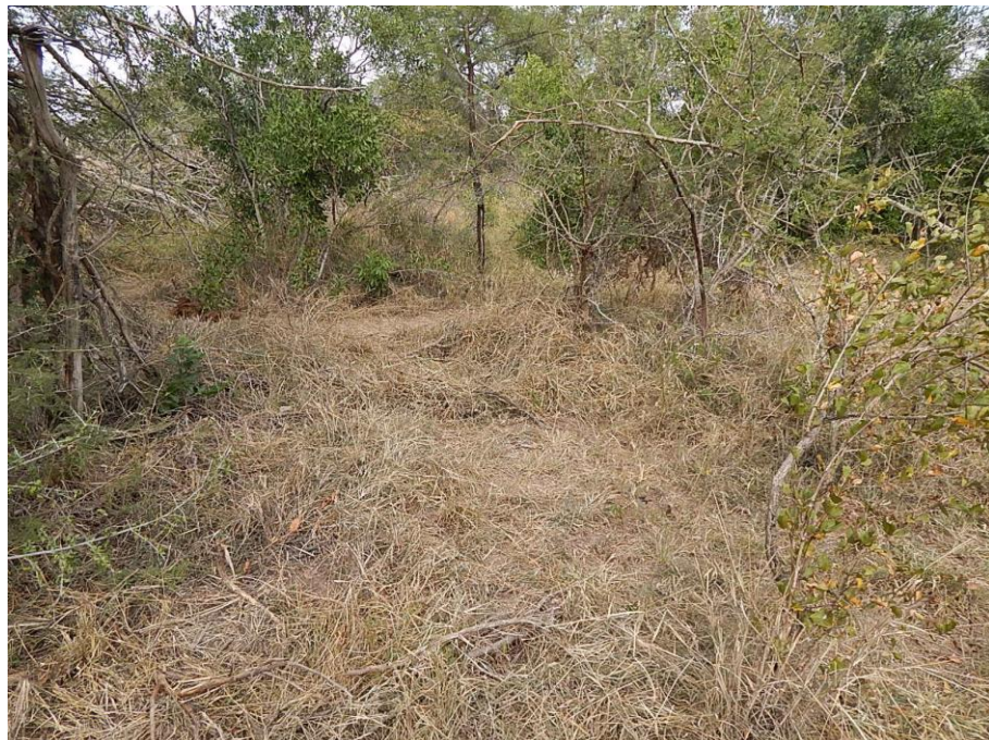
Fig. 14: Unit 1: Visibility was good as the vegetation was dry and low.