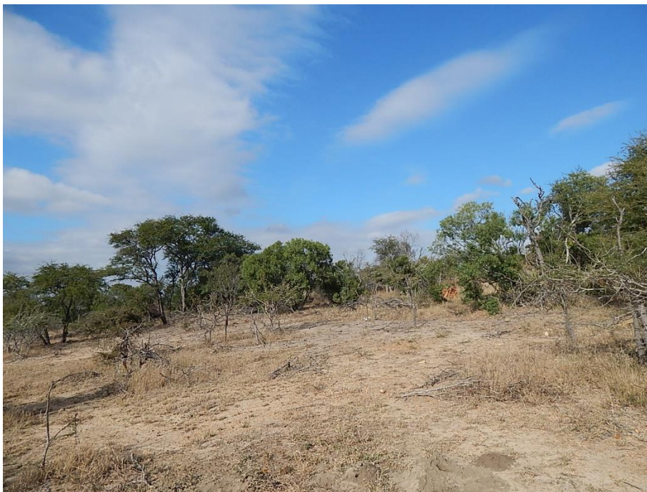
Fig. 2: A general view of the western section of the proposed staff housing site.