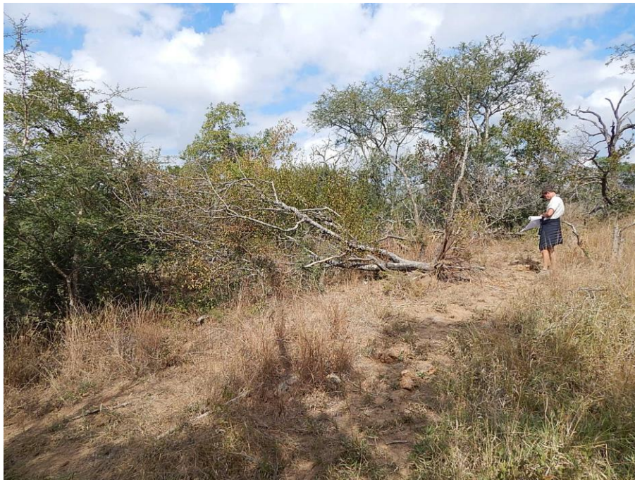
Fig. 22: Another view of the site for Unit 4.