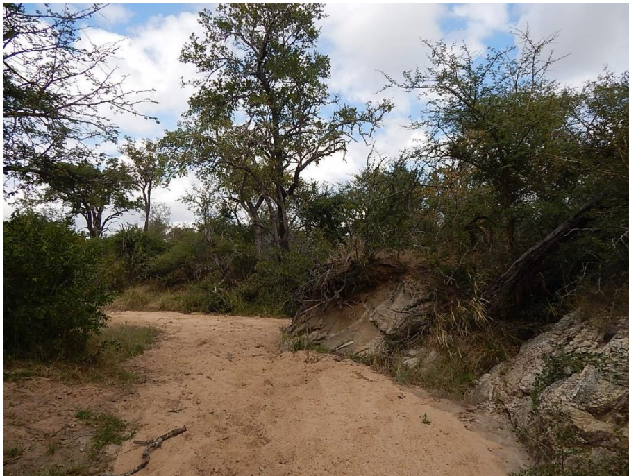
Fig. 11: The non-perennial tributary facing south.