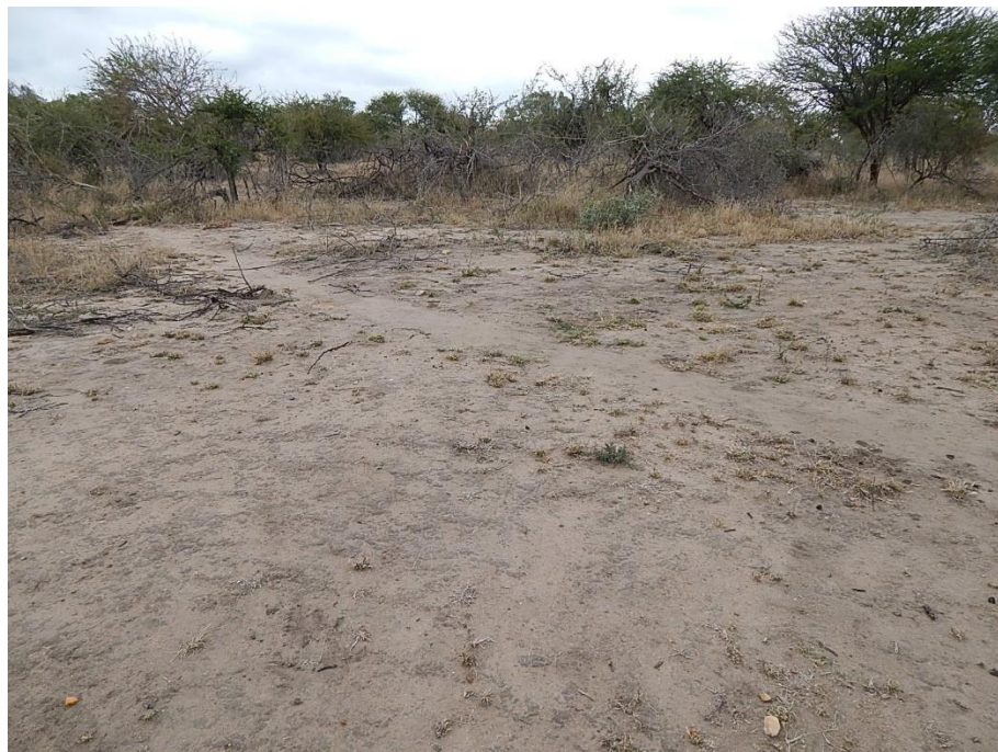
Fig. 4: A general view of the eastern section of the proposed staff housing site.

Visibility in this section was excellent as it was dry and open.