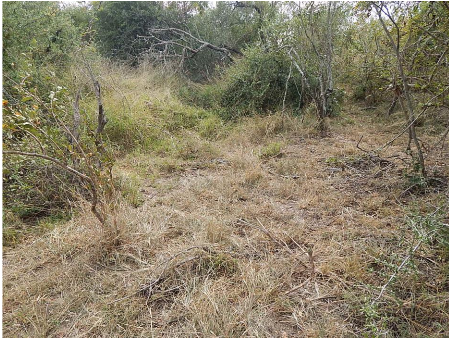
Fig. 13: Unit 1 is east of the tributary and situated in natural vegetation.