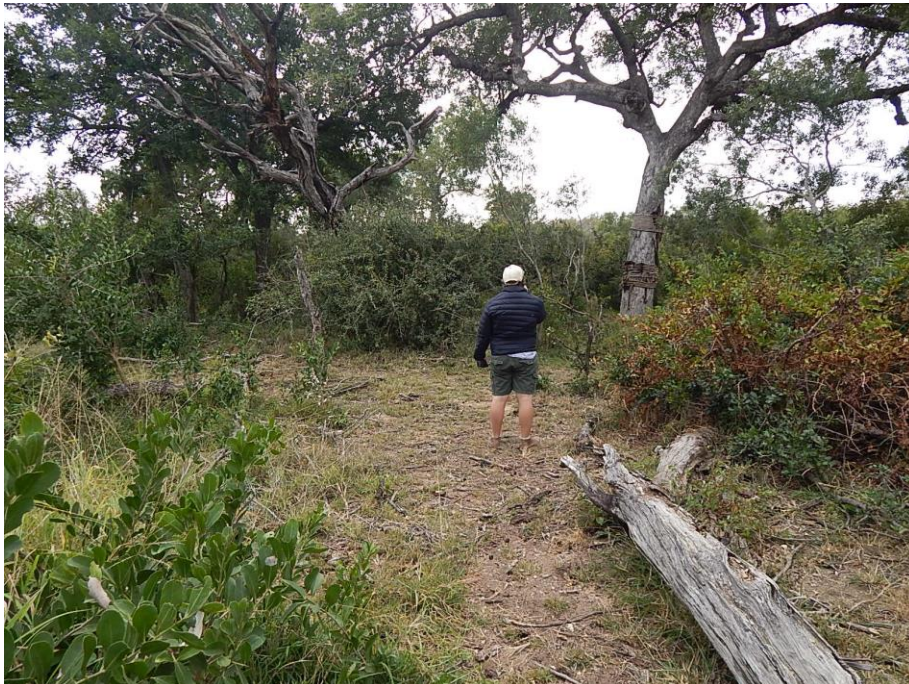
Fig. 28: The area for the Main building was open and accessible and visibility was good.