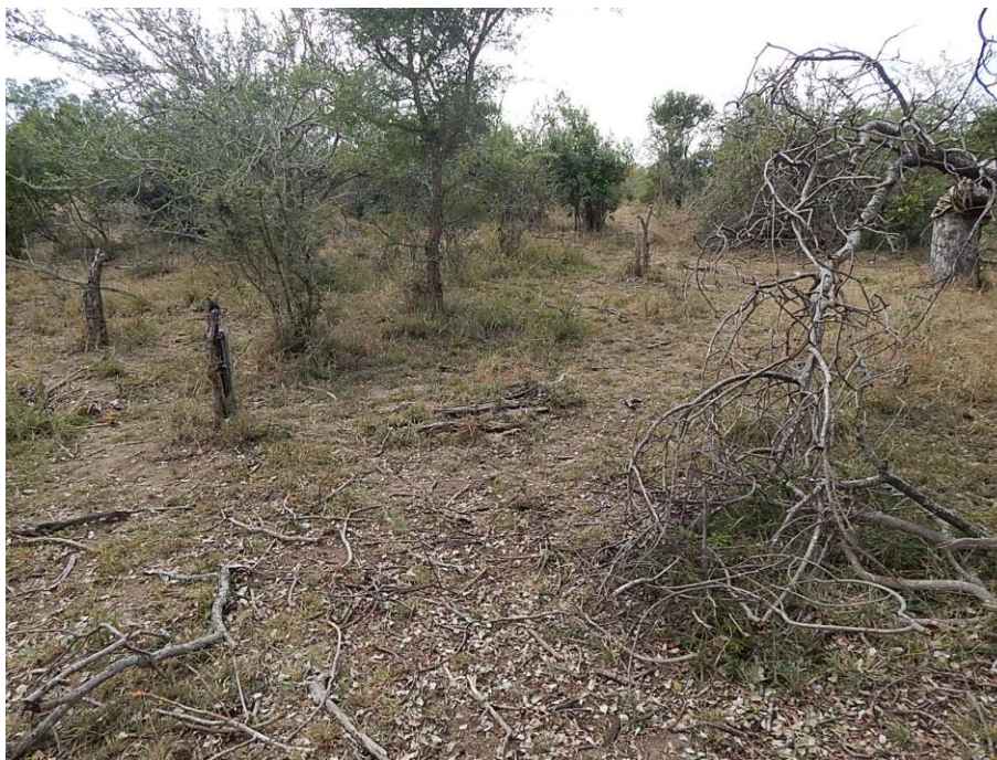
Fig. 18: Another image of the proposed site for Unit 3.