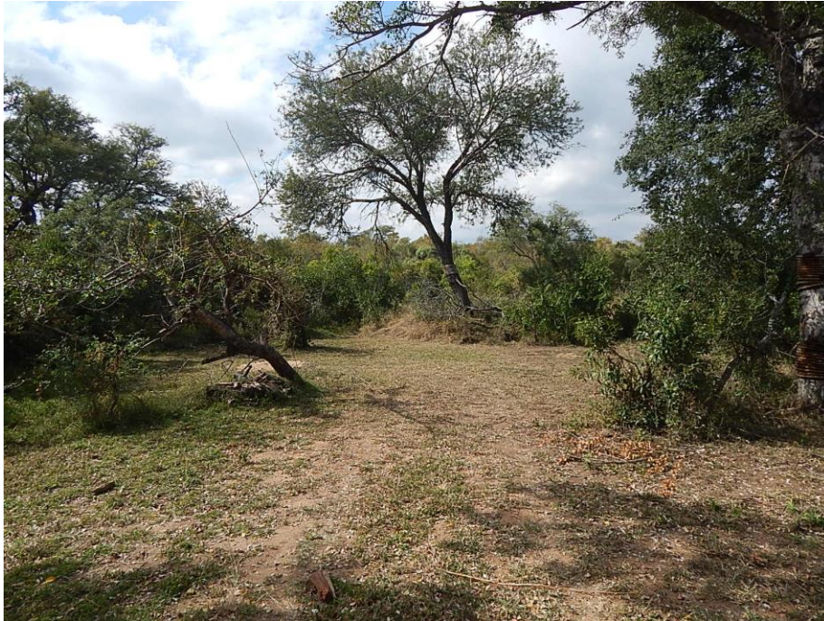
Fig. 23: The area for Unit 5 is currently used for evening bush dinners. The area was open and accessible and visibility was excellent.