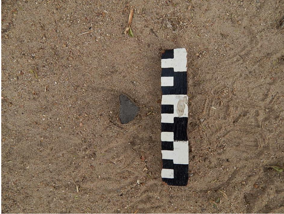
Fig. 7: Undecorated clay potsherds were observed in the access road (outside of the study area).