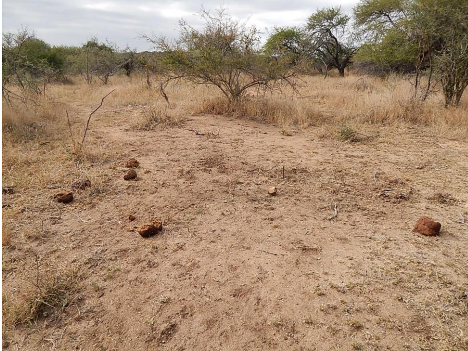
Fig. 3: A general view of the southern section of the proposed staff housing site.