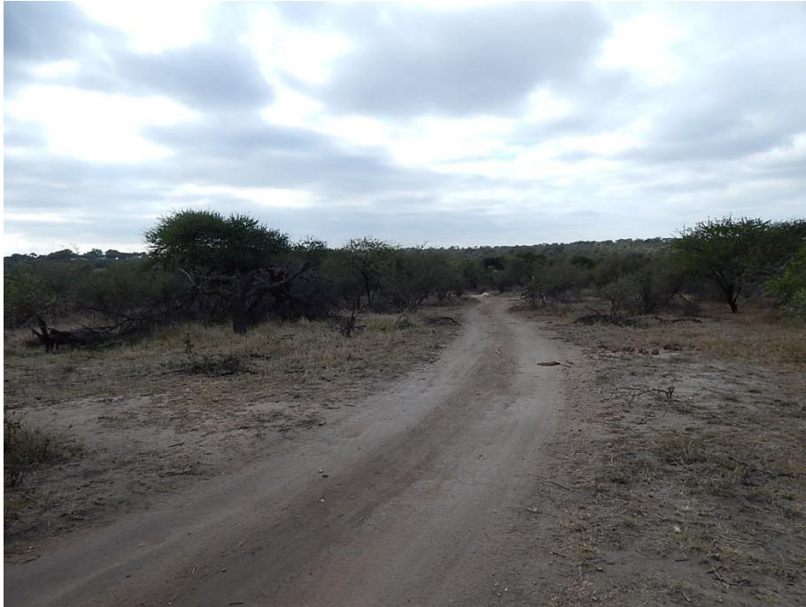
Fig. 9: Existing access roads will be used near the staff housing section.