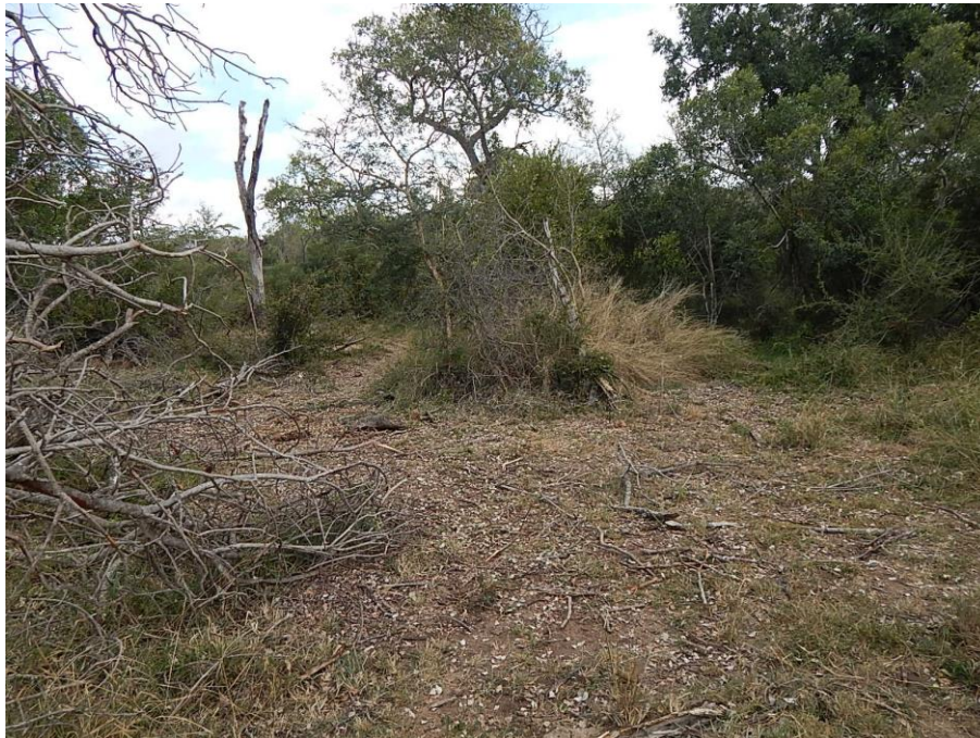
Fig. 17: Unit 3 was open and accessible, visibility was excellent.