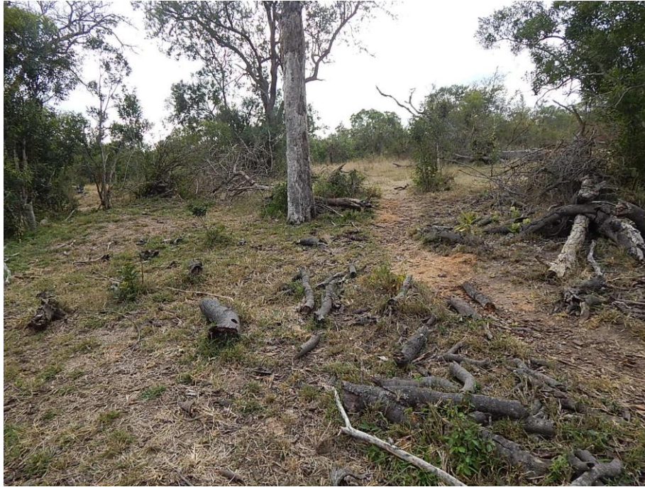
Fig. 15: The area of Unit 2 was open and accessible. Visibility was excellent.