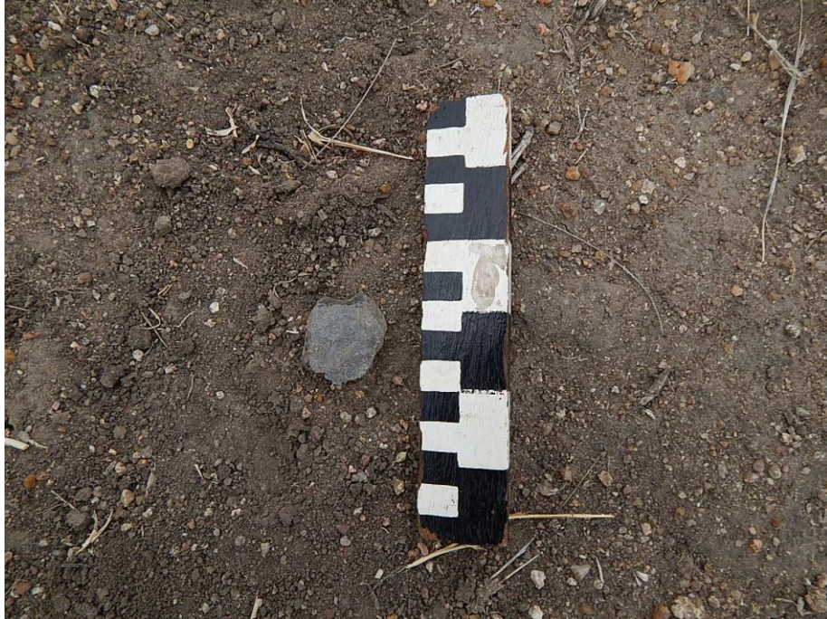
Fig. 8: Undecorated clay potsherds were observed in the access road (outside of the study area).