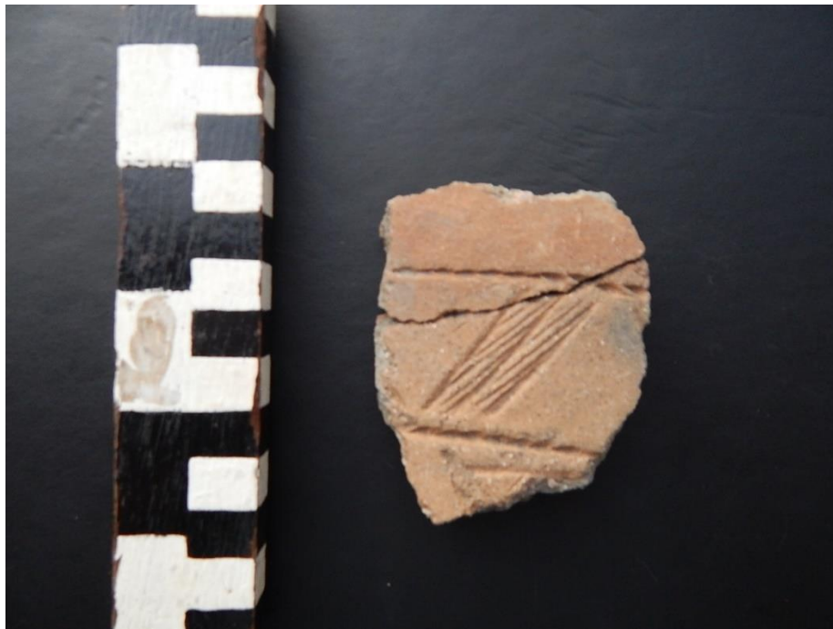
Fig. 6: Two pieces of the decorated clay potsherd (see fig. 5), fits together and it believed to belong to the Late Iron Age.