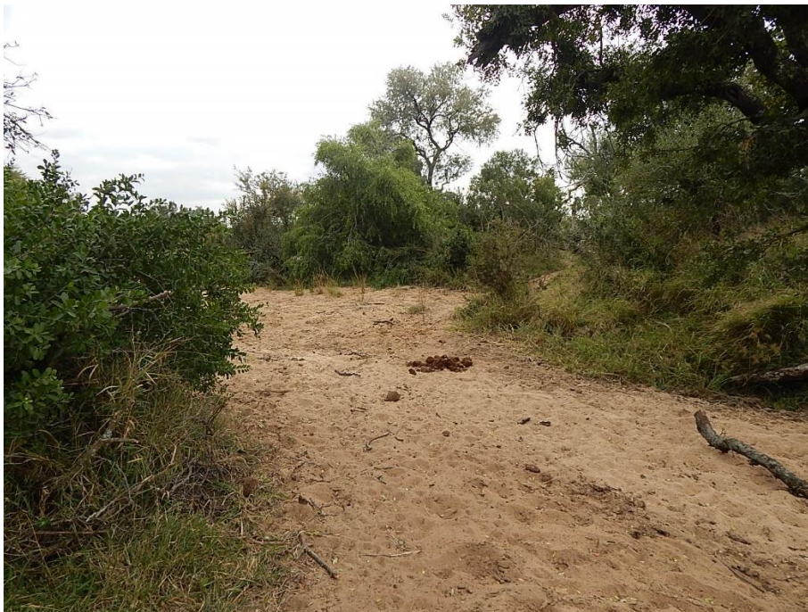
Fig. 12: The non-perennial tributary facing north.