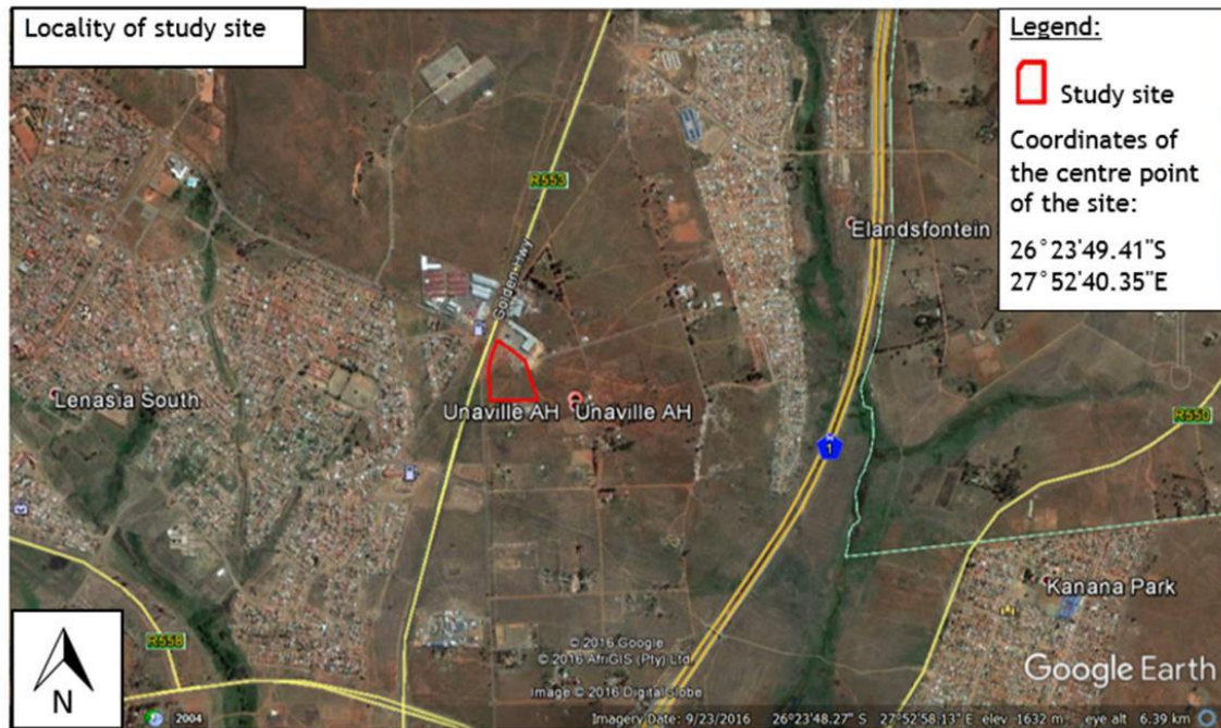
Figure 1: Location map

The site is situated approximately 1.7 km's North of the R558 and the R553 (Golden Highway) crossing in Unaville Agricultural Holdings and is situated on the corner of 1st Avenue and 3rd Street. Coordinates of the centre point of the study site: 26°23'49.41"S 27°52'40.35"E.