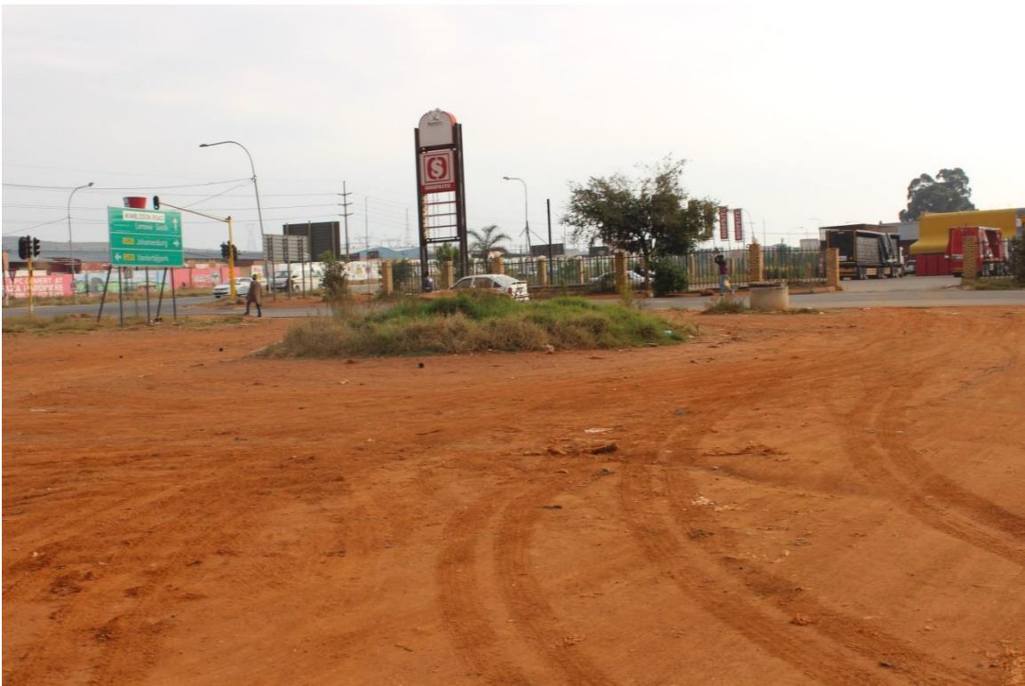
Figure 3: Photograph taken in the area marked as A