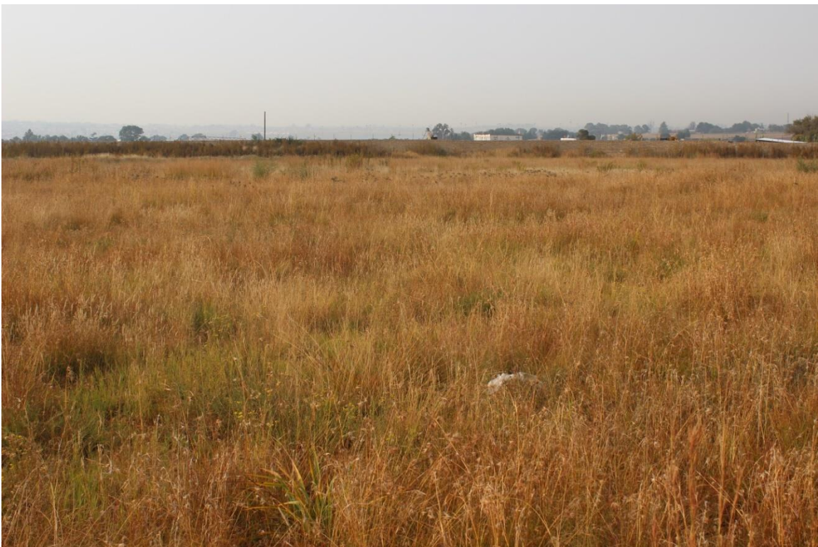
Figure 4: Photograph taken in the area marked as B