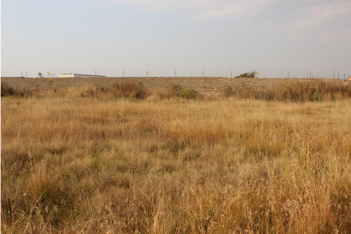
Figure 5: Photograph taken in the area marked as C