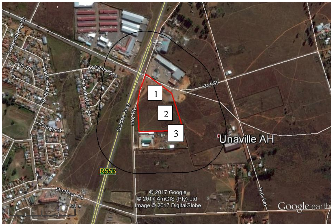
Figure 2: Photograph locations