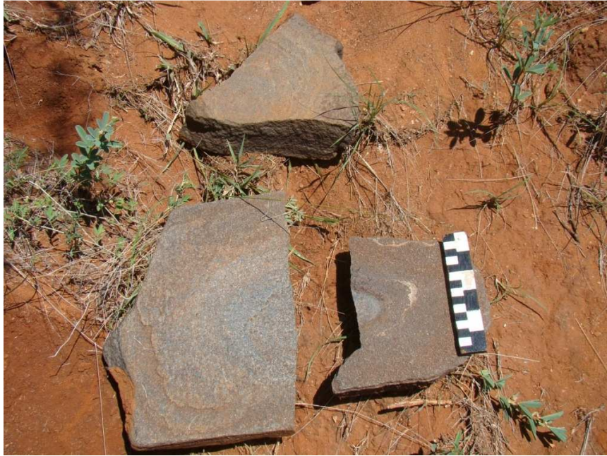
Fig. 50: Three broken upper grinders.