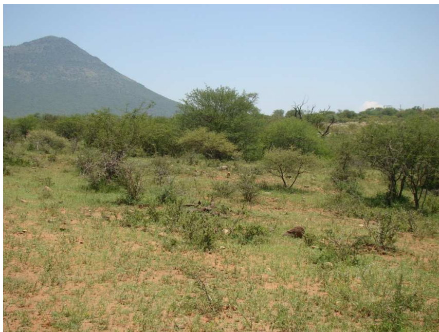
Fig. 39: A general view of the southern section. The area was flat and open and visibility was good.