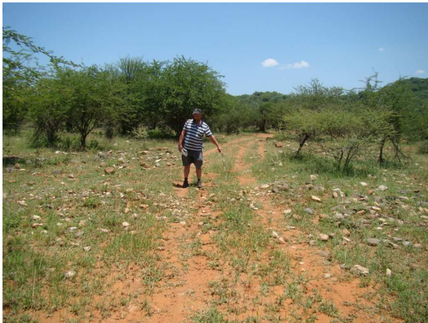
Fig. 49: The access road has disturbed one of the recent foundations.