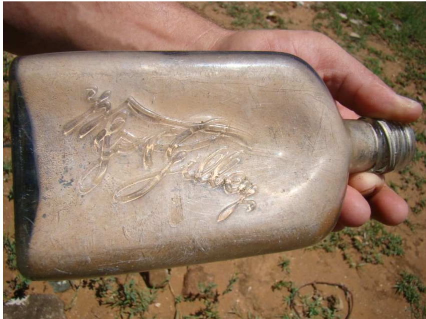
Fig. 44: Recent bottles and glass were found in the southern section.