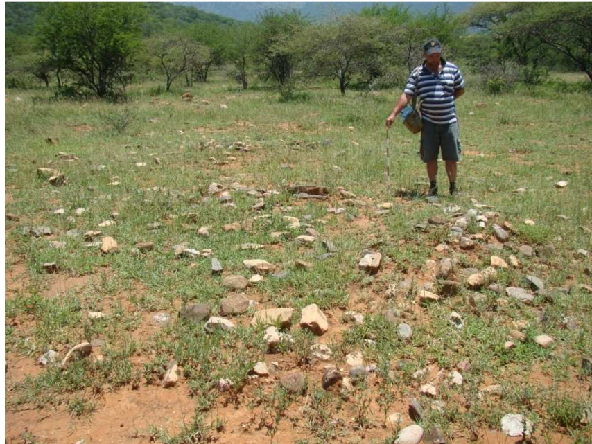
Fig. 42: The entire southern section has visible remains of recent square foundations. Most of the stones are scattered and disturbed.