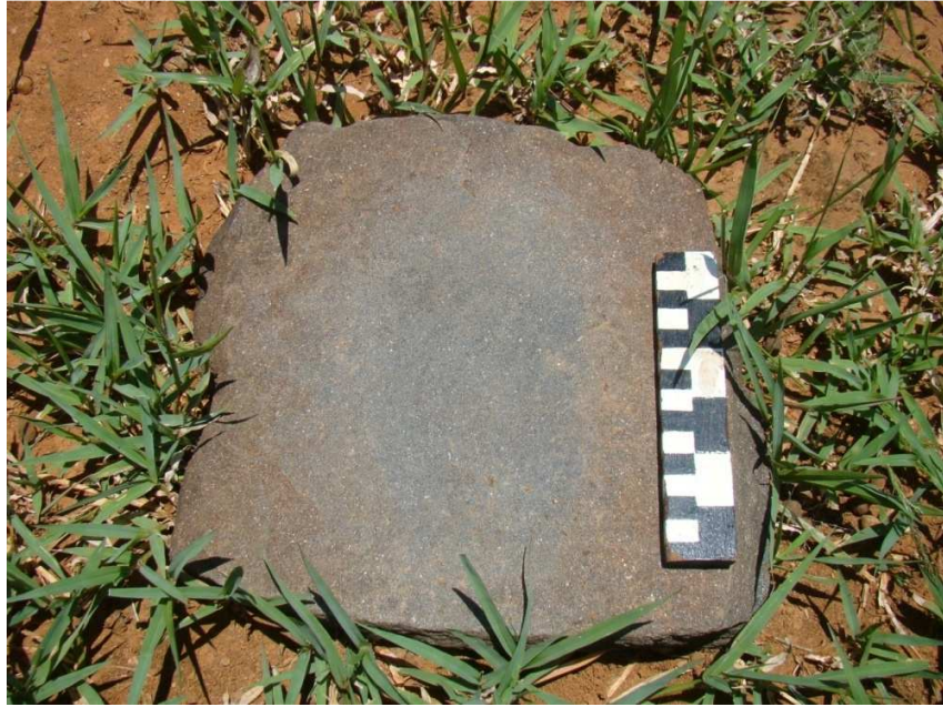
Fig. 46: A broken lower grinder.