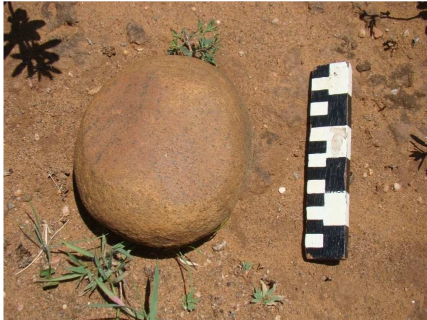
Fig. 40: Many upper grinders were found in the southern section.