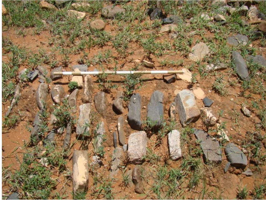
Fig. 48: Foundation stones in the southern section.