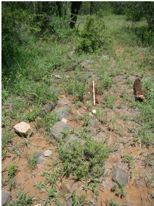
Fig. 51: Row of stones of a recent foundation.