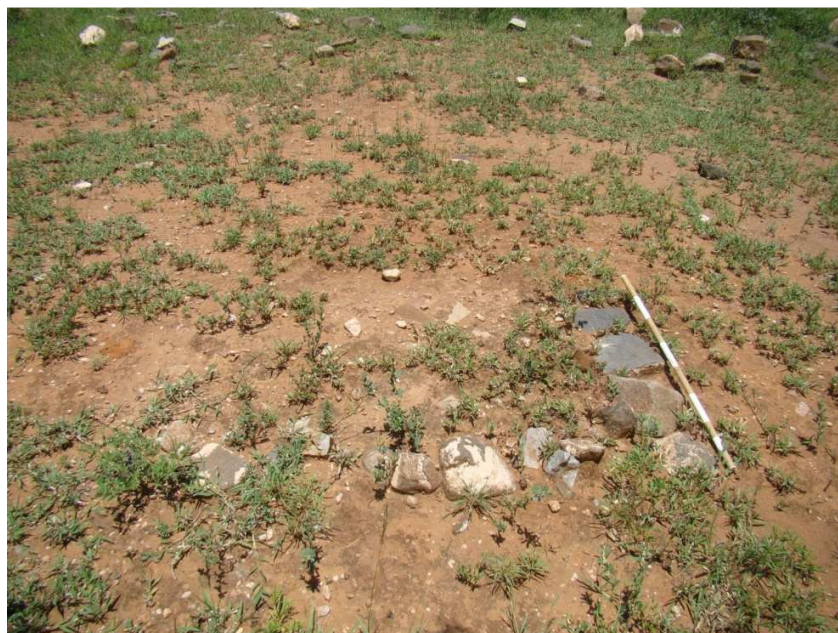
Fig. 43: Square foundation which is deteriorated, but still partly visible.