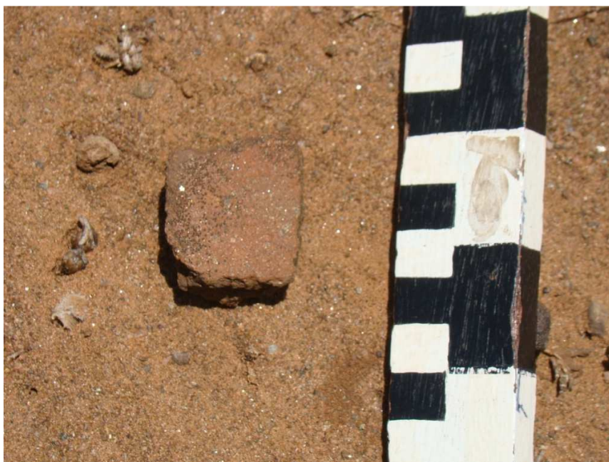
Fig. 41: Remains of potsherds were also identified in the southern section.