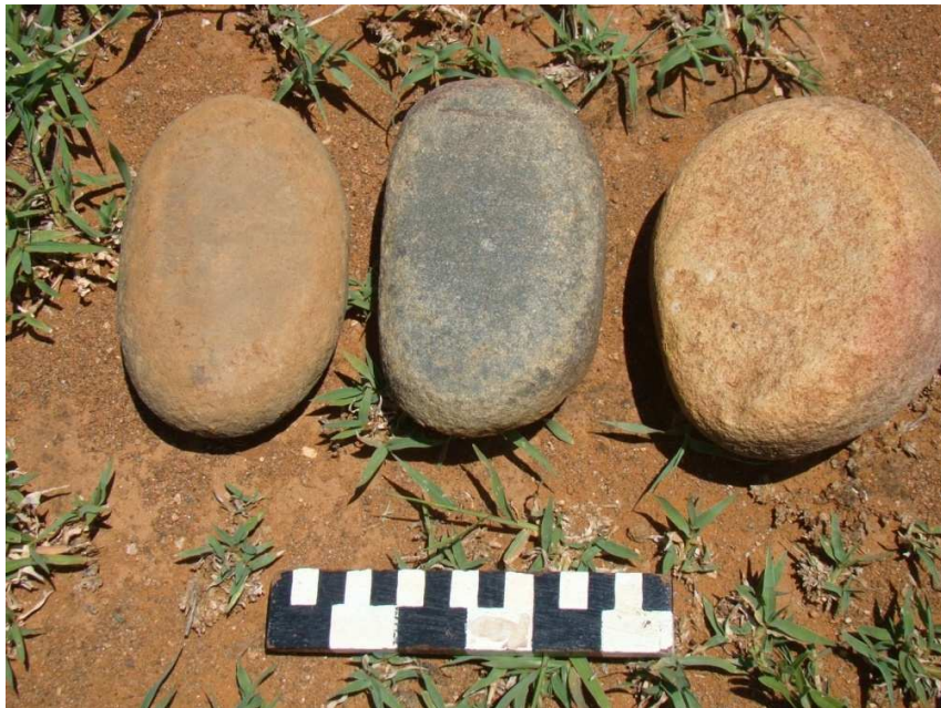
Fig. 47: Some of the many upper grinders which were found in the southern section.