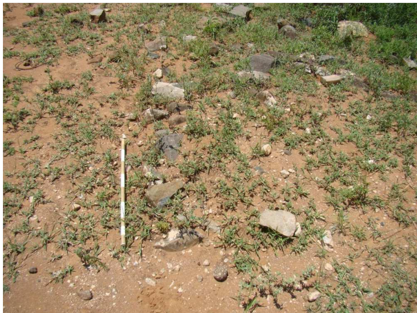
Fig. 45: Foundation stones of a recent structure.