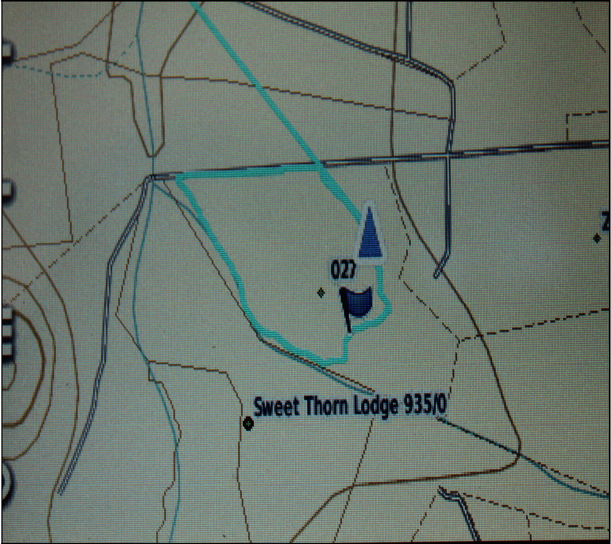
Figure 7: Snap short of the transverse route