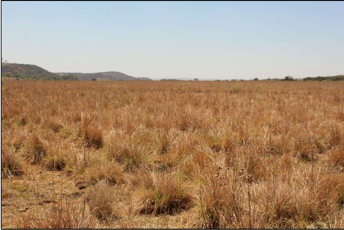
Figure 5: view of the central part of the site dominated by grass species