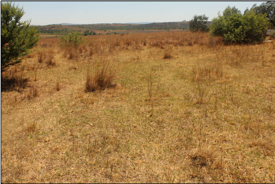
Figure 3: very few vegetation exists in the property