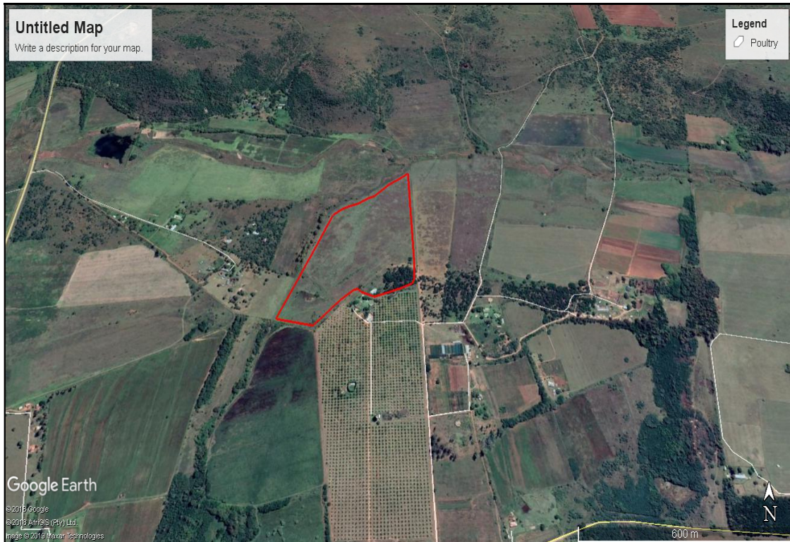
Figure 1: View of the study area

The applicant requires information on the heritage resources that occur within or near the proposed area and their heritage significance. The objective of the study is to document the presence of archaeological and historical sites of significance to inform and provide guidance on the proposed development. Apart from contributing towards the preservation of the heritage resources, the studies provide information and awareness of the types of archaeological and heritage sites that occur within the proposed study area. The document enables the developer to align their functions and responsibilities to advance project activities and at the same time minimizing potential impact on archaeological and heritage sites. Heritage Impact Assessment is conducted in line with the National Heritage Resources Act of 1999 (Act No. 25 of 1999). The Act protects heritage resources through formal and general protection. The Act provides that certain developmental activities require consents from relevant heritage resources authorities. In addition to heritage