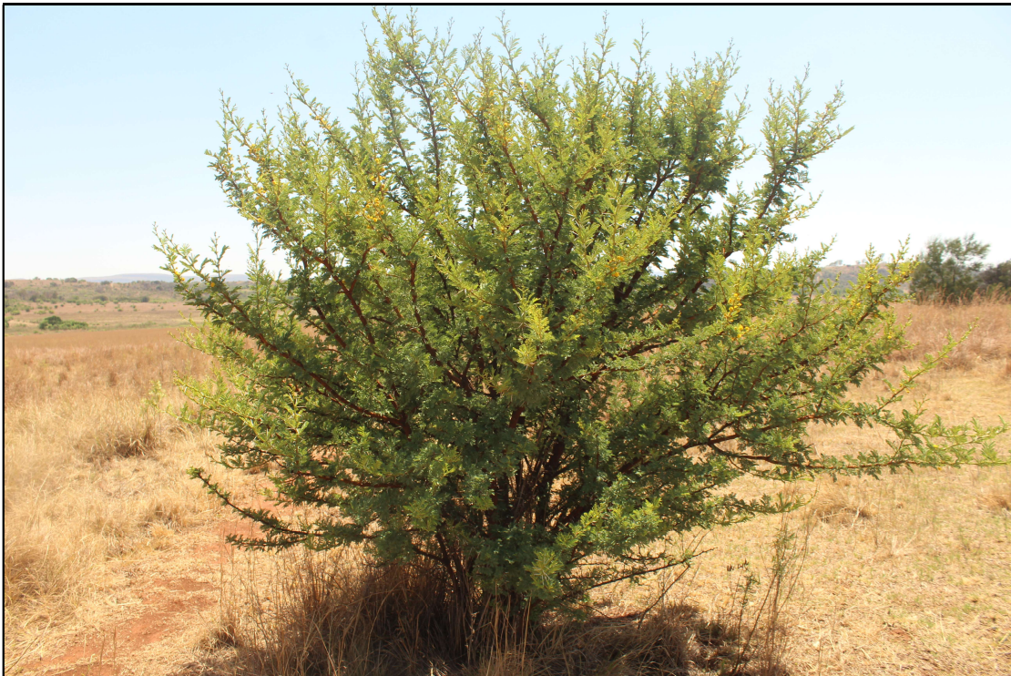
Figure 6: isolated Acacia species