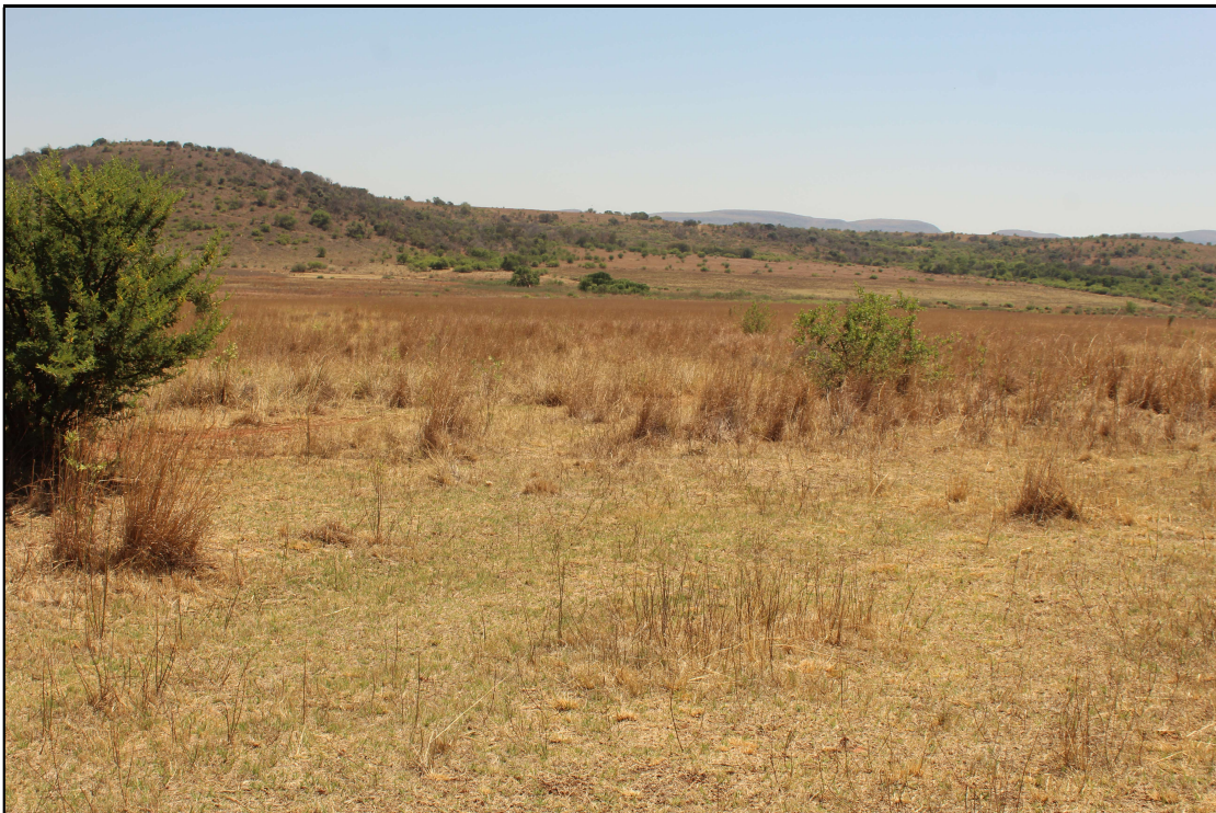
Figure 4: the vegetation is dominated by graminoids