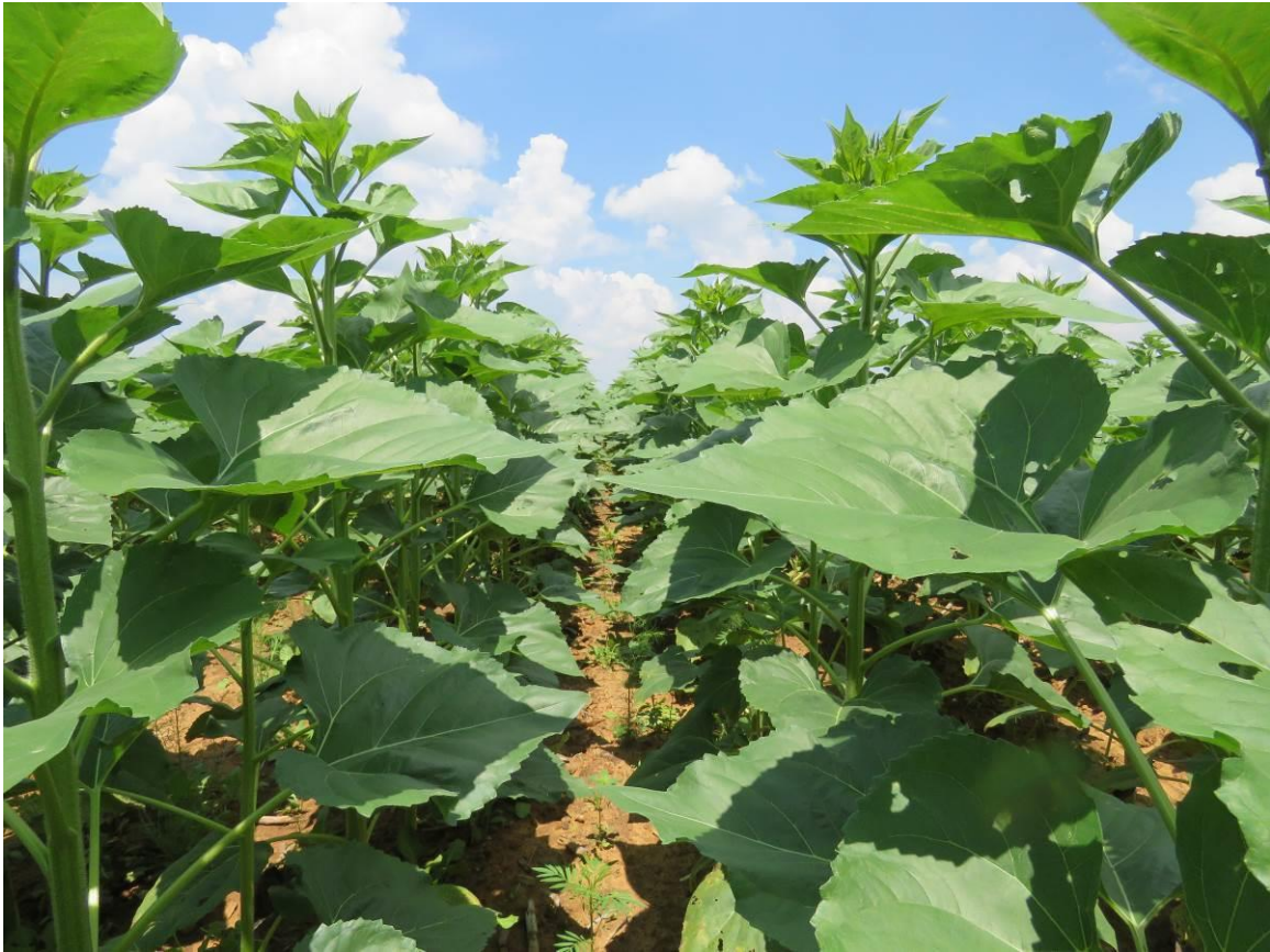
Figure 5. A route would be cut through the sunflower field for access by drilling machine.

No archaeological or cultural materials of any age were noted at or near the drill site.