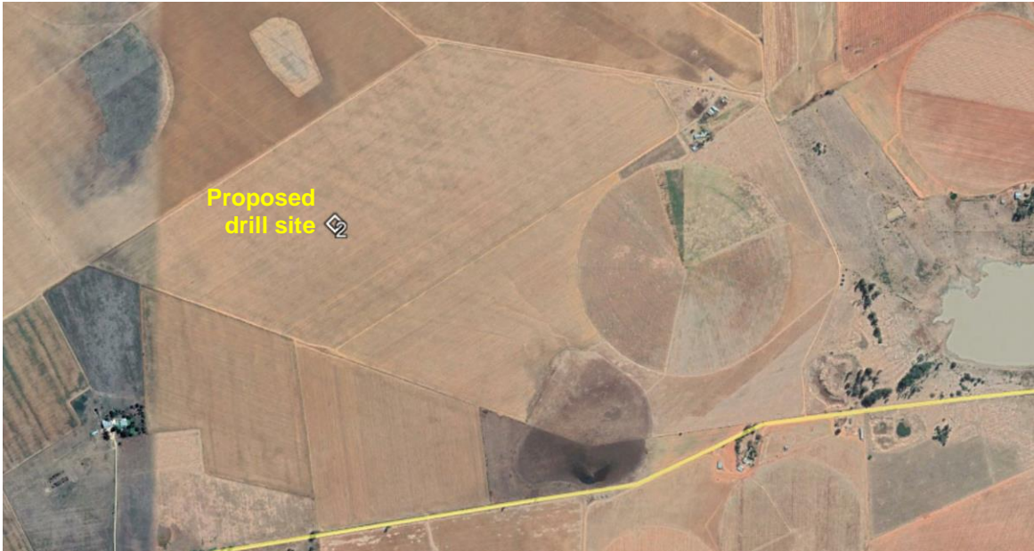
Figure 1. Locality: Holfontein 147 IO (white square) about 6.5 km south west of Biesiesvlei. Considerable swathes of land are given over to agricultural production.

The proposed drilling locale is indicated in the following image and map.