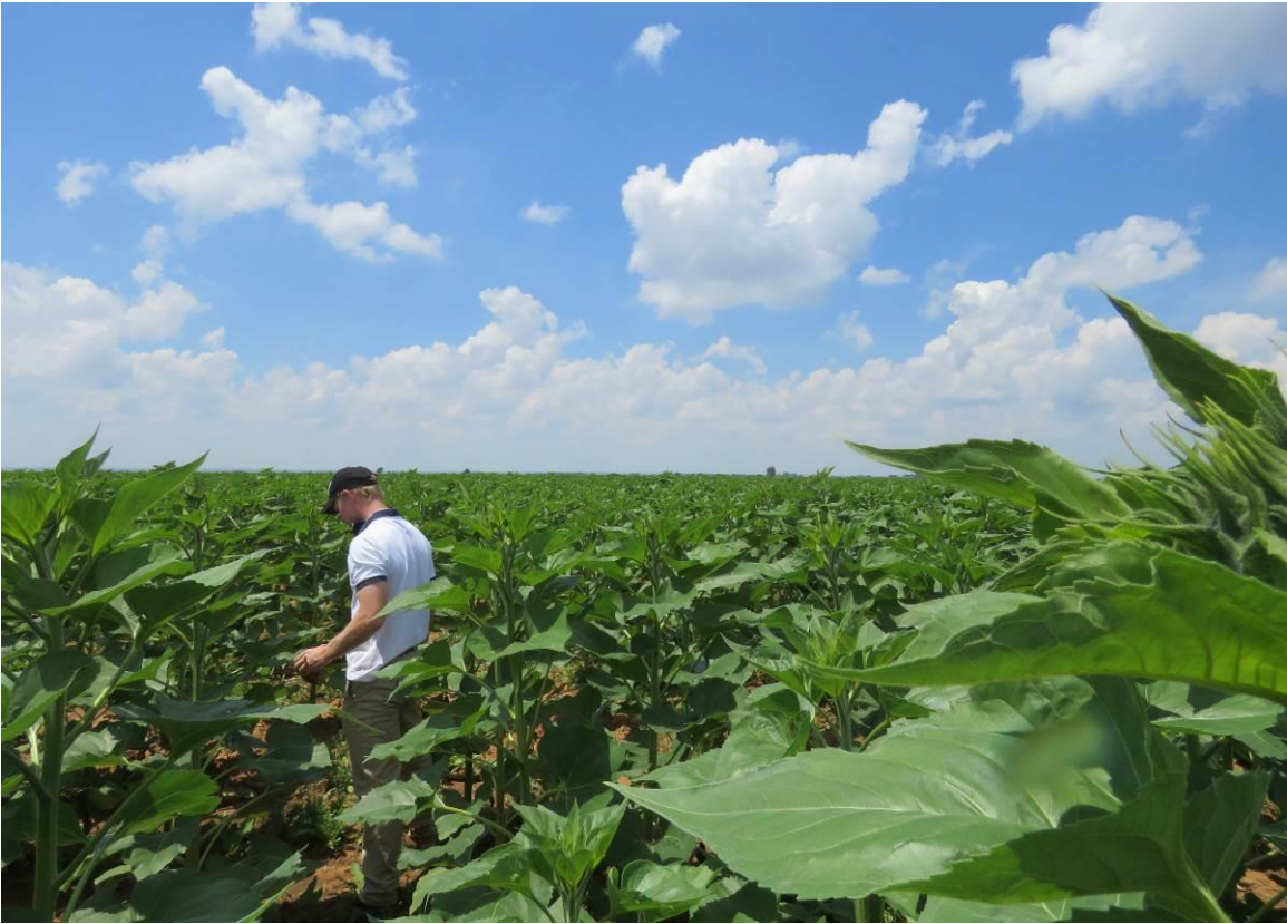
Figure 4 a & b. Vicinity of drill site.