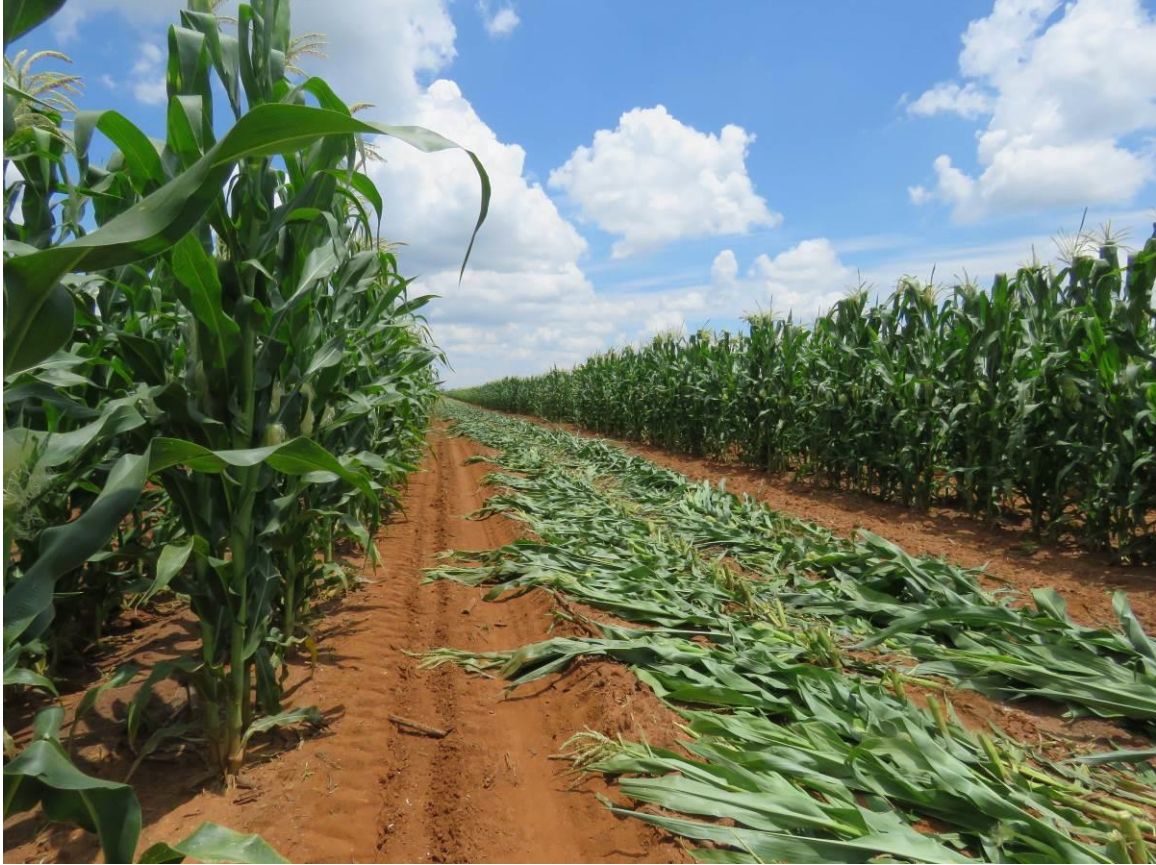
Figure 5. Route cut for access by drilling machine.

No archaeological or cultural materials of any age were noted at or near the drill site.