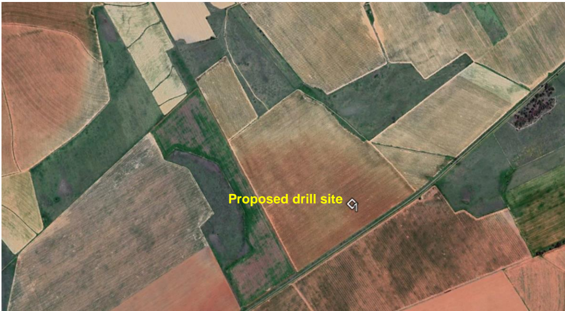
Figure 1. Locality: Kareeboschbult 76 IP (white square) about 10 km west of Coligny. Virtually every square metre is given over to agricultural production.

The proposed drilling locale is indicated in the following image and map.