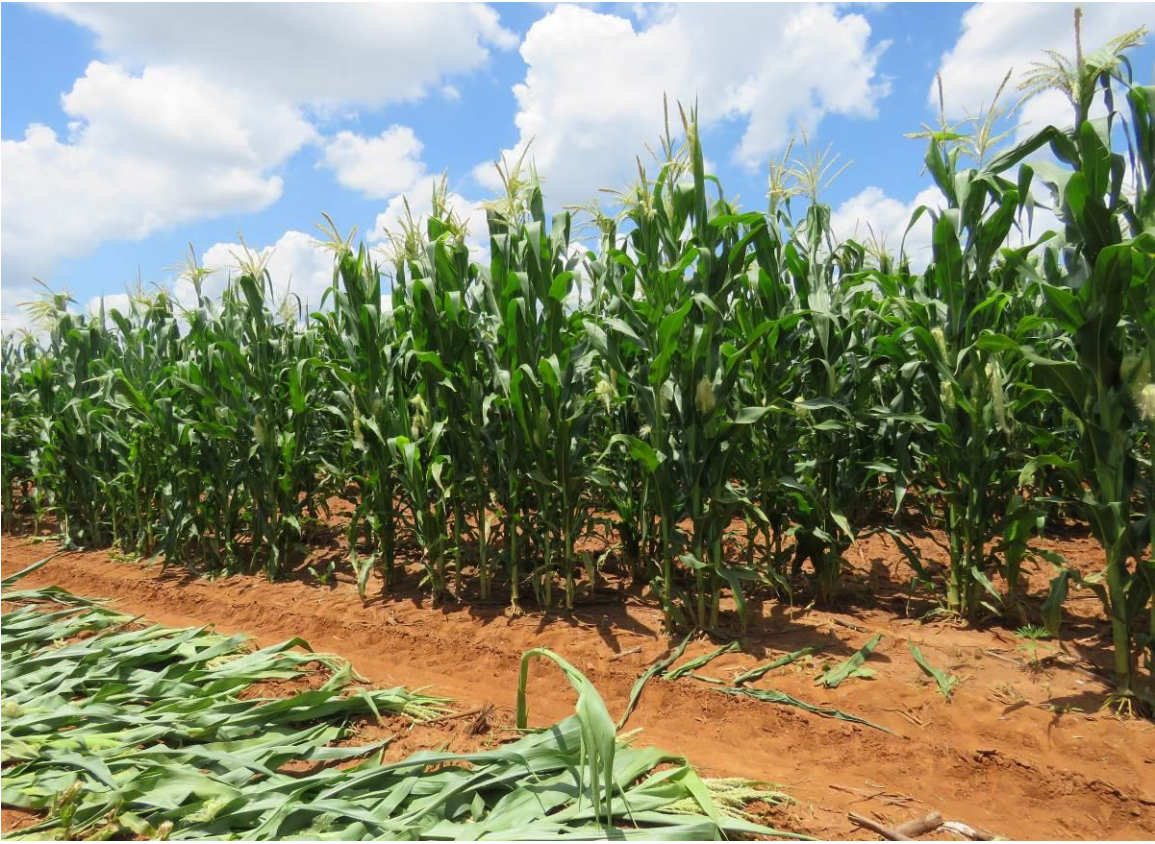
Figure 4 a & b. Vicinity of drill site.