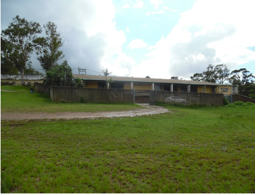
Figure 3: Site earmarked for development with Ohlange Library in background