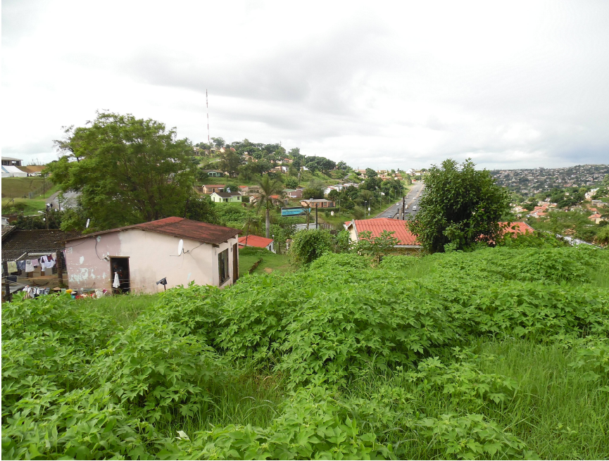
Figure 5: Structures situated to the south of site earmarked for development