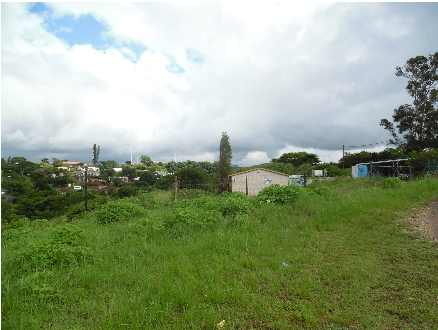
Figure 6: Structures situated to the northwest of site earmarked for development