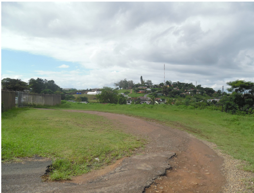
Figure 2: Site earmarked for development