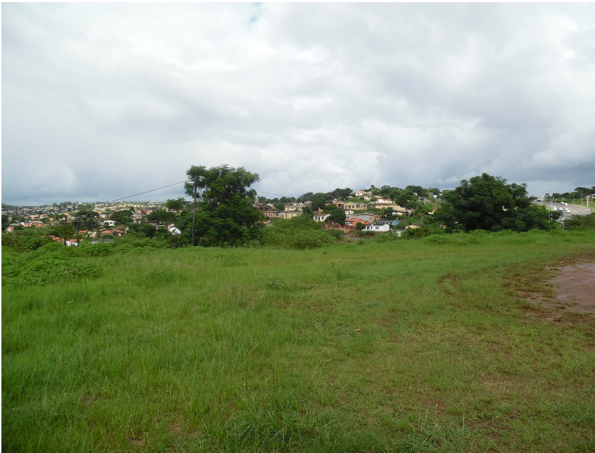
Figure 4: Site earmarked for development, western section