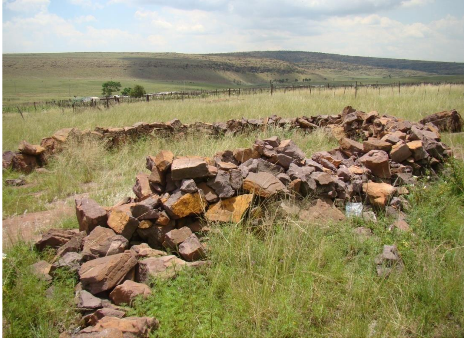
Fig. 9: This round enclosure (1), in the informal settlement area is recent and outside the study area.