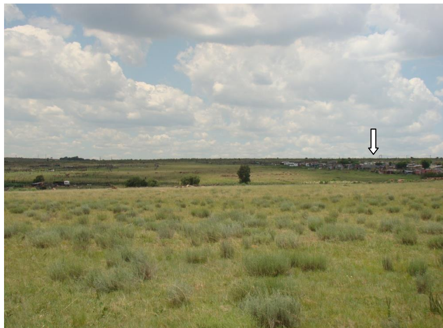
Fig. 2: General view from the north-east point to the south-east point. The settlement is visible in the background.