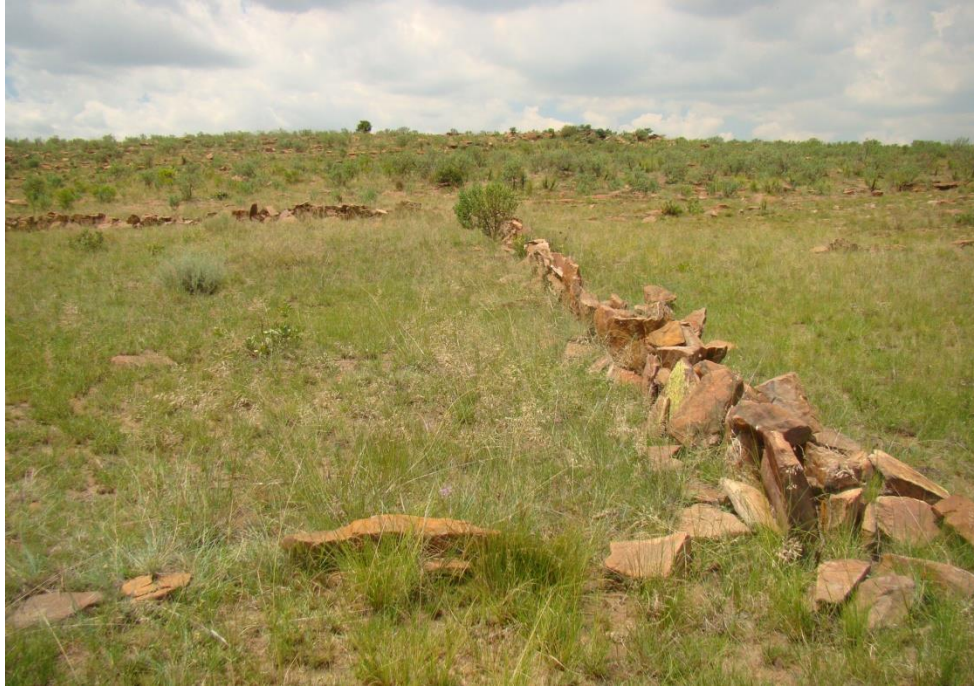
Fig. 5: A square stone enclosure of 28 x 58m is recent and not of any historic value. (Not in the study area).