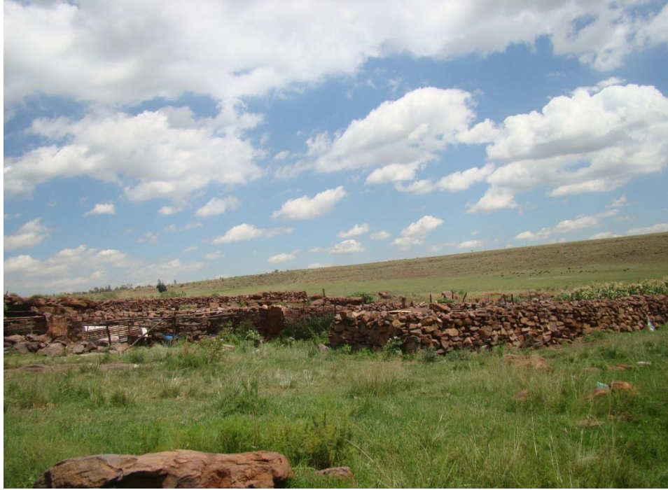
Fig. 7: Recent cattle / goat enclosures (not of any historic significance and outside the study area).