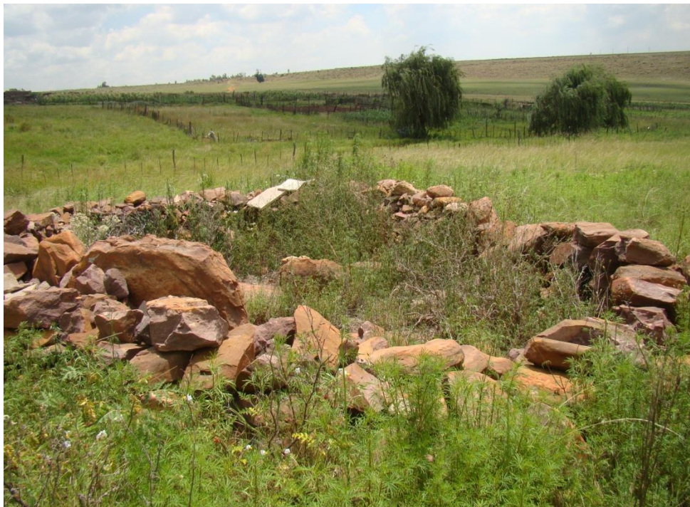
Fig. 10: Another round enclosure for goats is recent and of no significance. It is outside the study area.