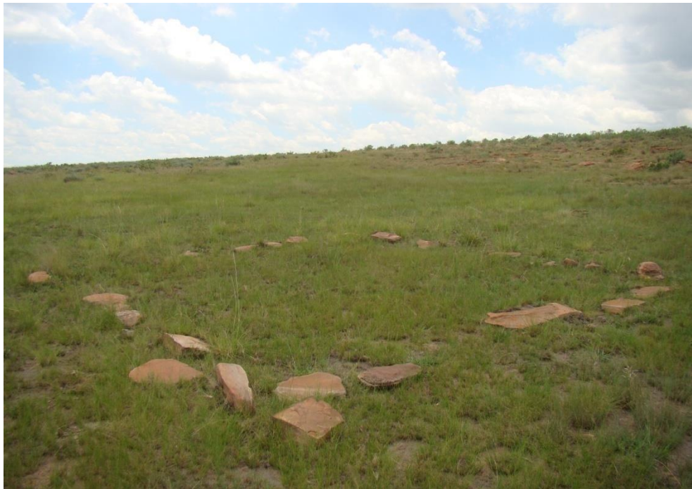
Fig. 6: A square stone foundation of 4 x 5m is recent and not of any historic value. (Not in the study area).