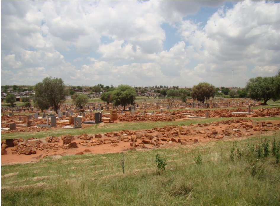
Fig. 8: The cemetery at the Newtown informal settlement, which is currently in use (not in study area).