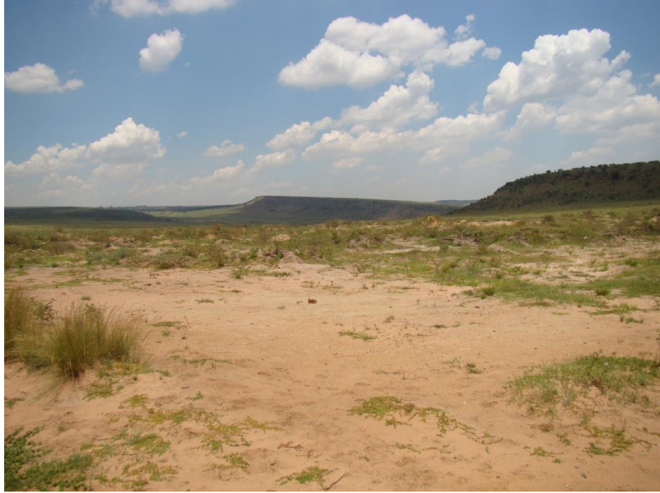
Fig. 11: The sand quarry towards the west of the study area.