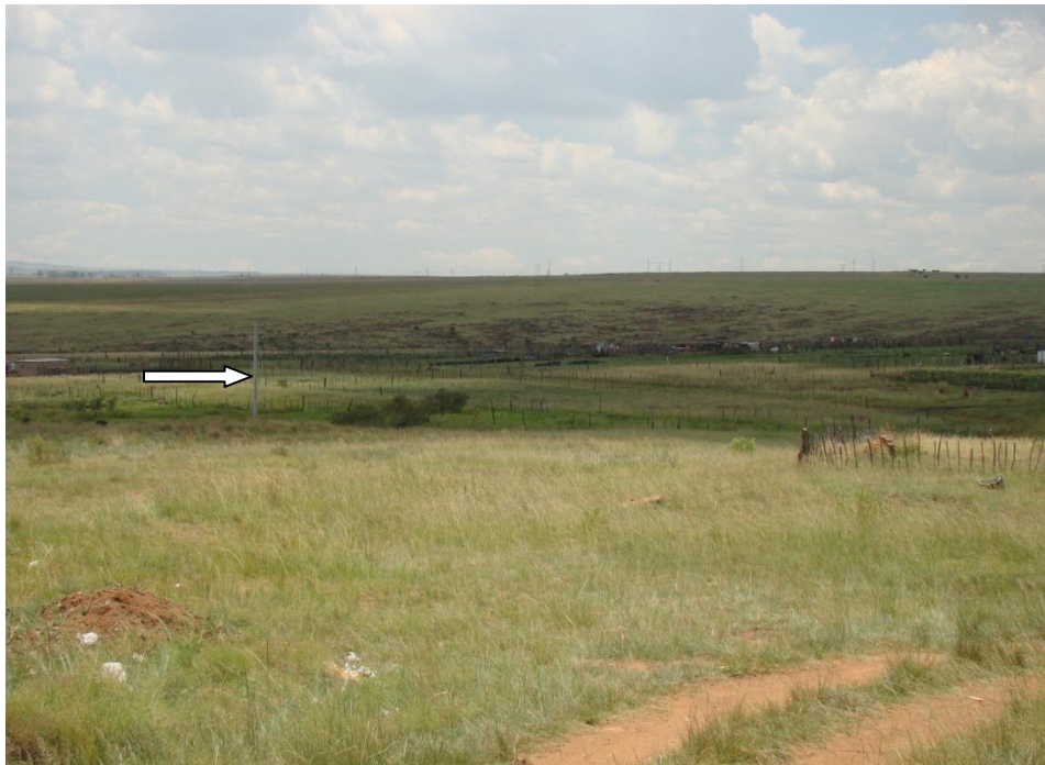
Fig. 12: The Eskom pylons are visible in this picture. Note the fenced sections where the inhabitants cultivate sections with maize.