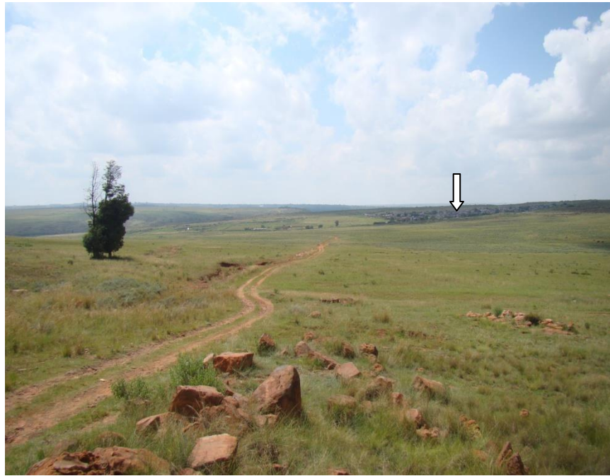
Fig. 1: General view of the study area, with the Newtown informal settlement in the background towards the south. The picture was taken at the north-west point towards the south-east point.