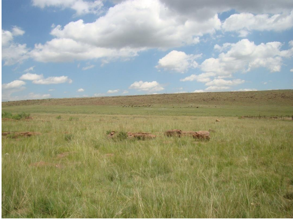
Fig. 3: View from south-east corner over study area towards the north.