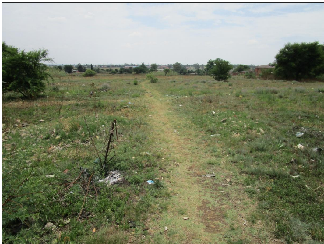
Figure 2. A general view through the centre part of the property in a north-eastern direction.