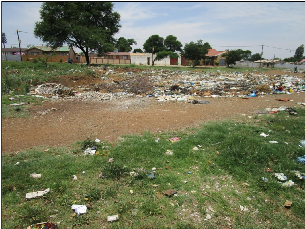
Figure 1. General view of dumping in the southern part of the property.