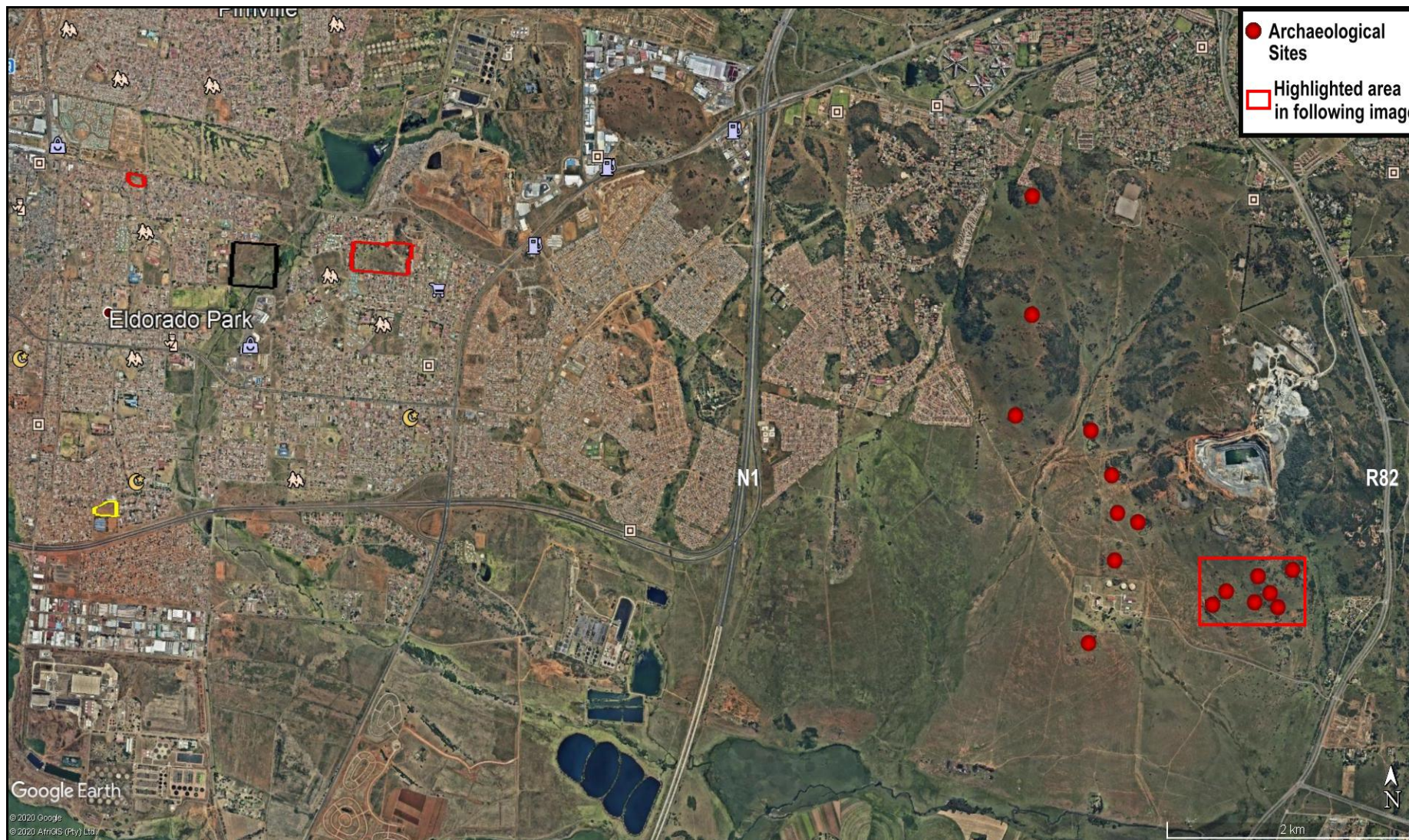
Figure 5. Google Earth image showing in red dots some archaeological sites east of Eldorado Park. The “boxed: cluster is detailed in Figure 6 below.