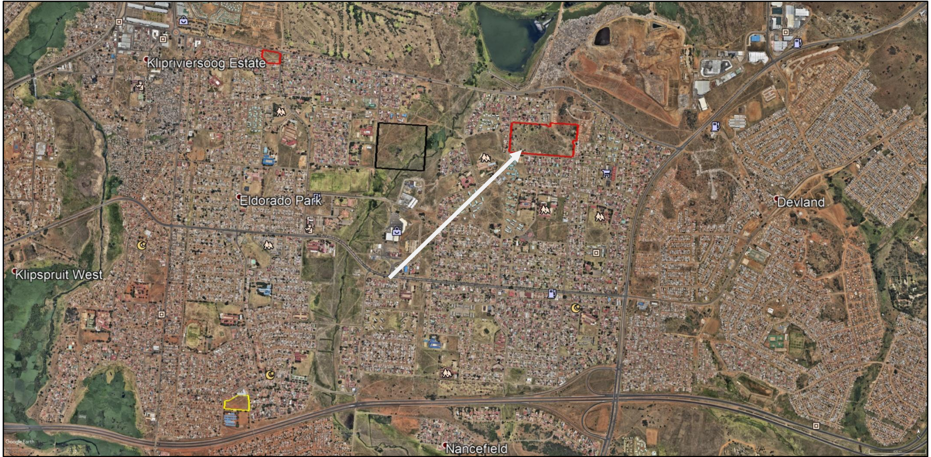
Figure 4. Google Earth image of the project location indicated by the arrow in relation to Eldorado Park.