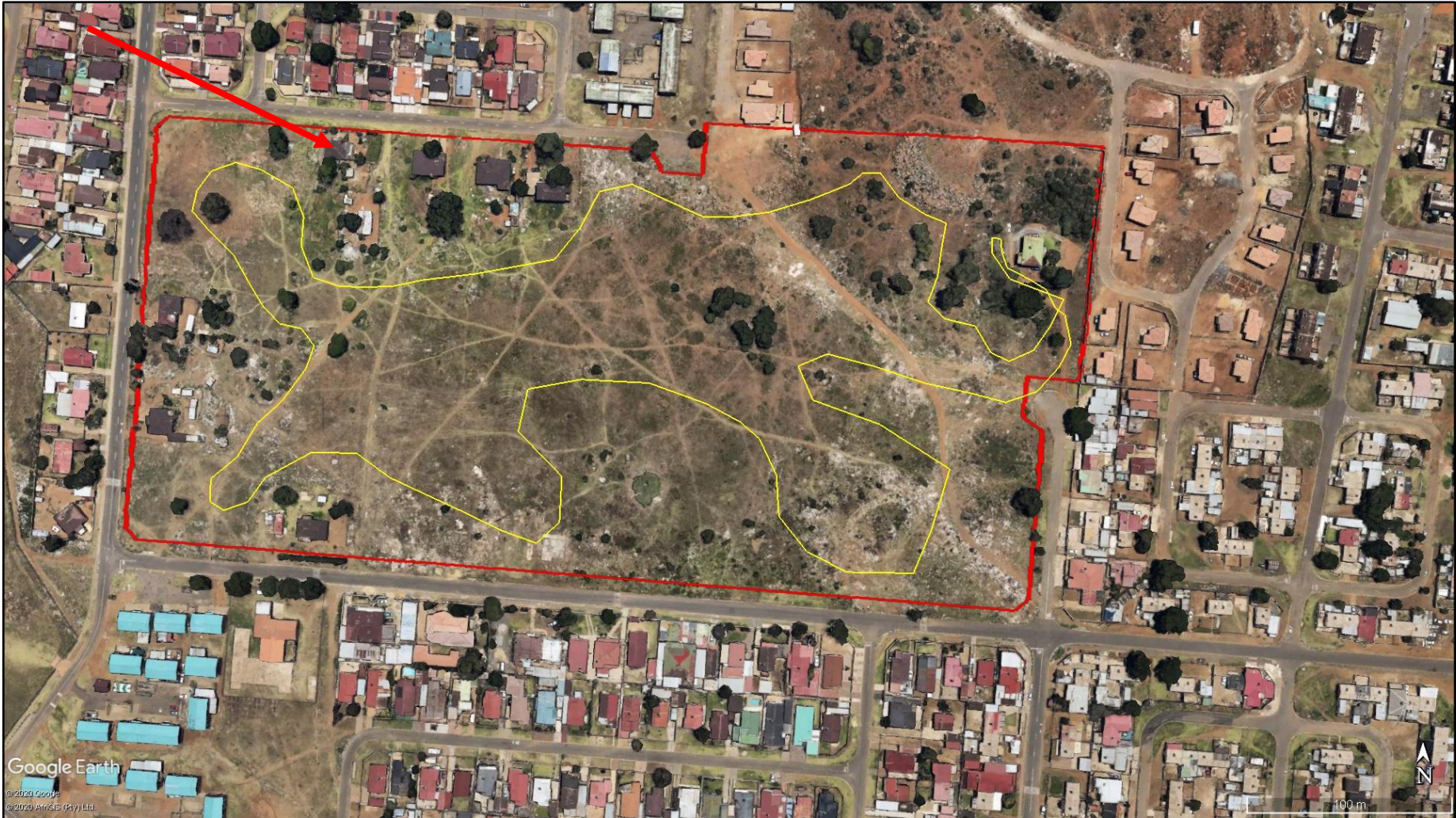
Figure 3. Google Earth image of the project location and GPS track. The arrow indicates the dwelling that may be 60 years or older.