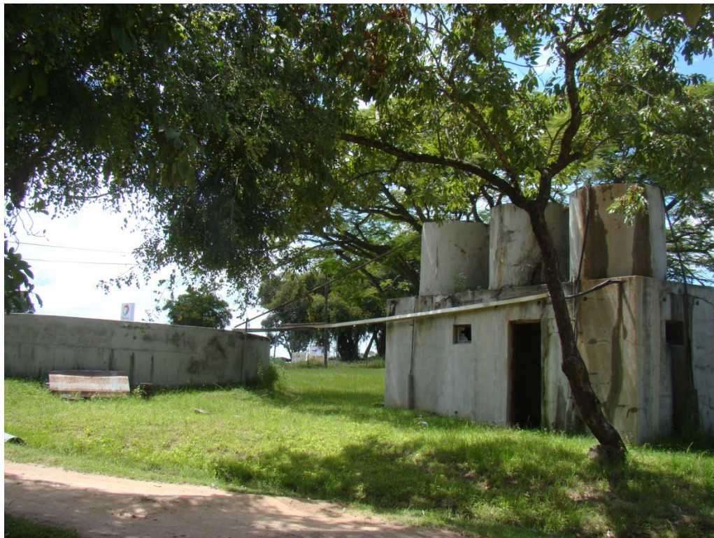
Fig. 10: The dam and water tanks next to the fence and the R40 on the eastern side.