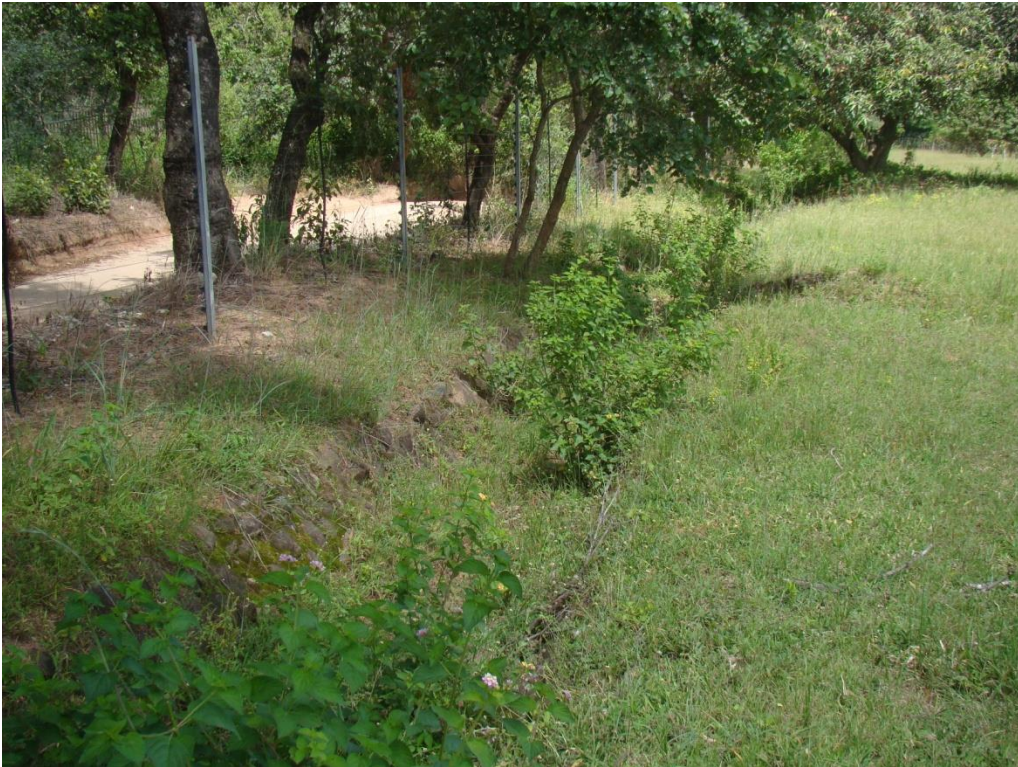
Fig. 12: A stormwater canal along the south border..