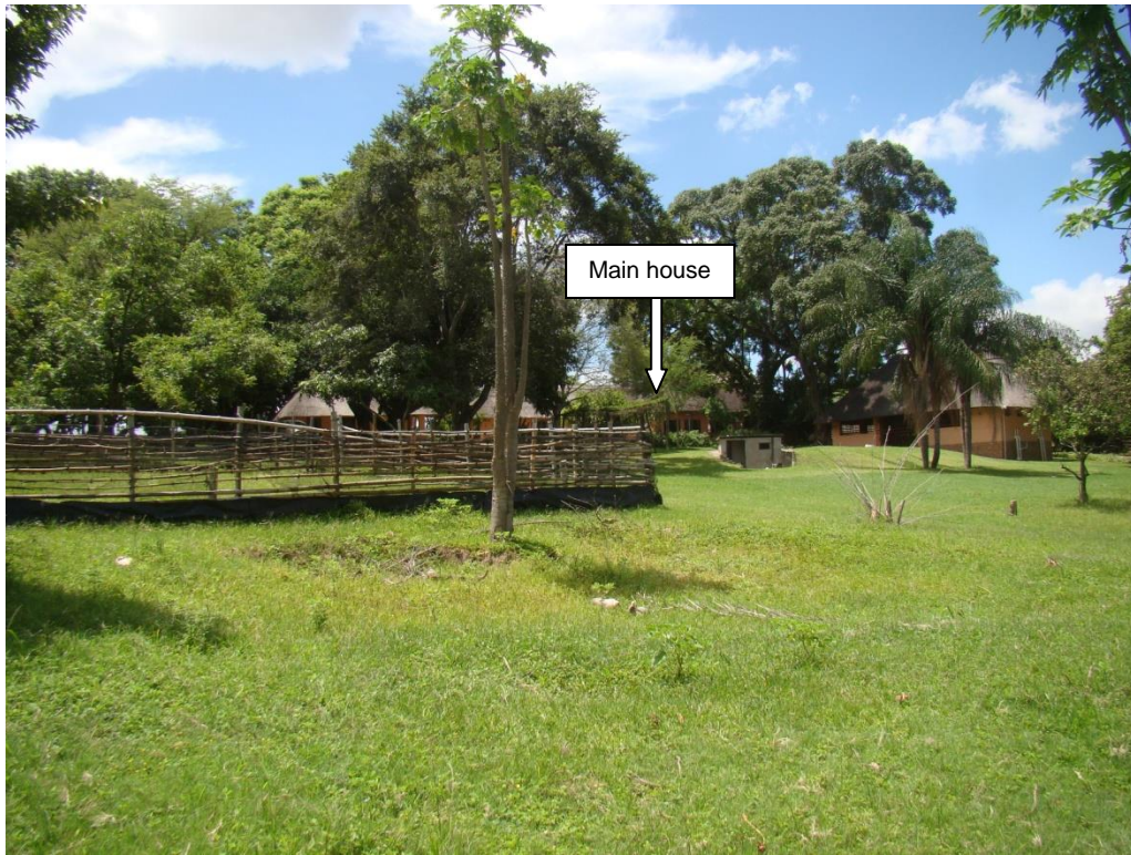
Fig. 9: View from the old tobacco lands towards the buildings. The vegetable garden is behind the pole fence.