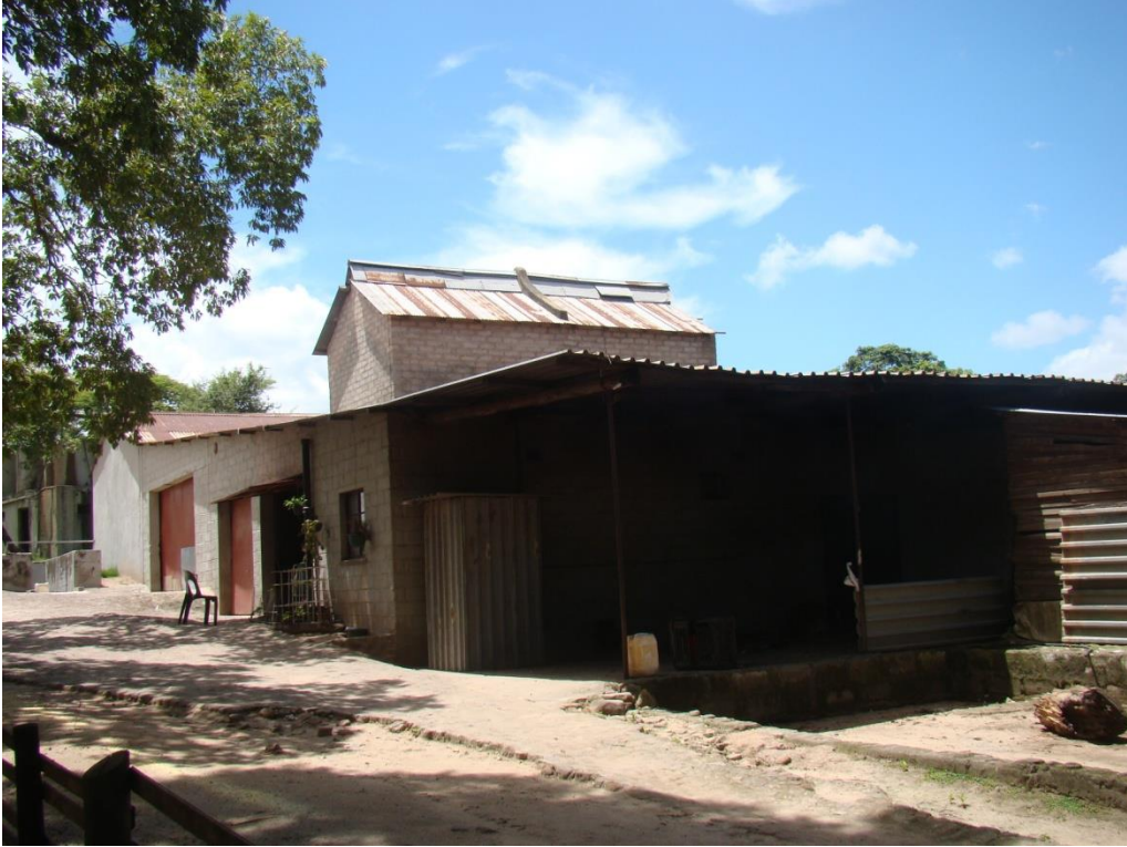
Fig. 11: Farm infrastructure. These structures are all of modern concrete bricks and not over 60 years old.