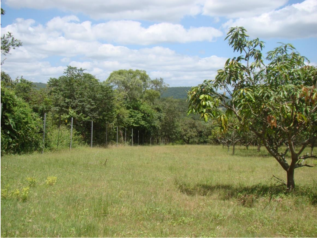
Fig. 3: South-western corner sloping towards a drainage line / dry stream bed.