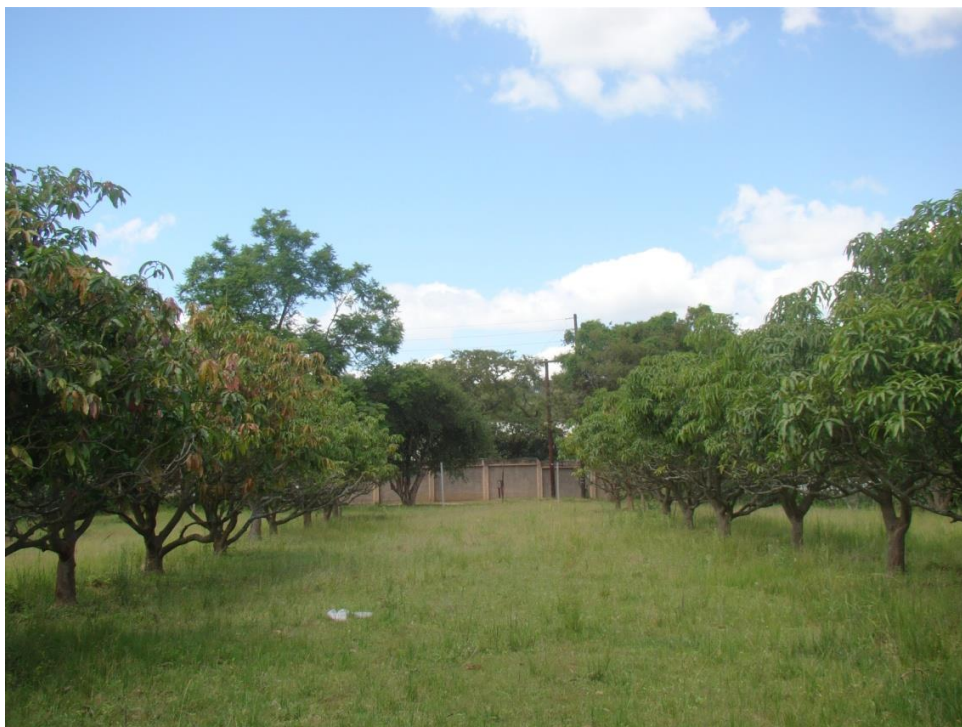
Fig. 2: South-eastern corner: This entire section is planted with mango trees.