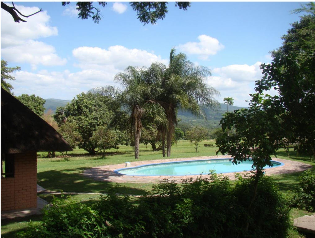
Fig. 8: View from the main house with the tobacco fields barely visible in the background, sloping towards the drainage line / dry stream bed.