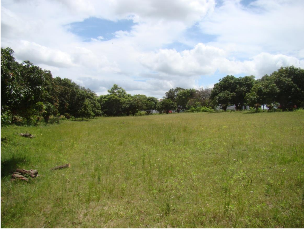
Fig. 5: North-eastern corner. Old mango trees fringe a previous cultivated land.