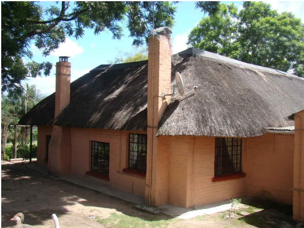
Fig. 6: The main house which was built in ca 1948.