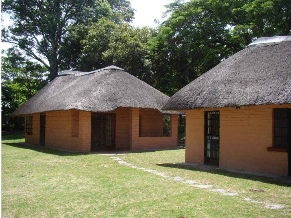
Fig. 7: The front section of the main house with an outer building of the same style in the background.