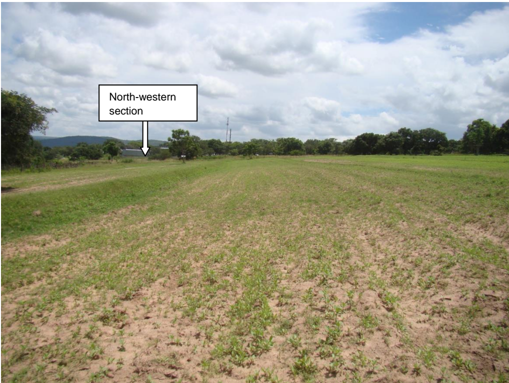
Fig. 4: View of the north-western section, with old tobacco lands in foreground.