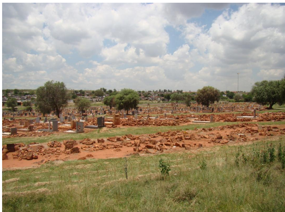
Fig. 8: The cemetery at the Newtown informal settlement, which is currently in use (not in study area).