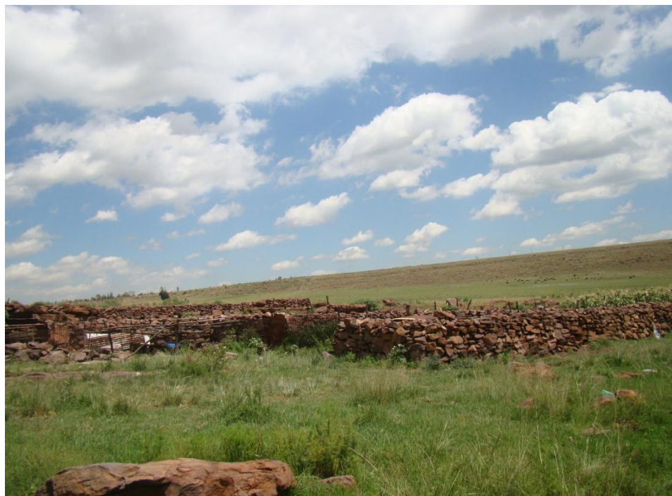
Fig. 7: Recent cattle / goat enclosures (not of any historic significance and outside the study area).