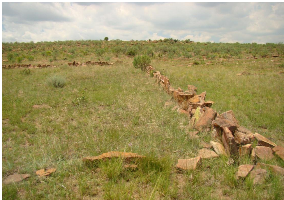
Fig. 5: A square stone enclosure of 28 x 58m is recent and not of any historic value. (Not in the study area).