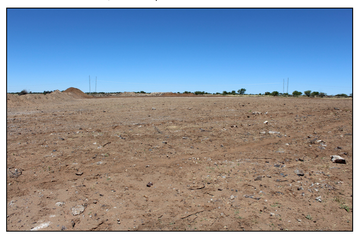
Figure 3: Clearings of the top soil in preparation to mine dolomite rocks, recent past activities