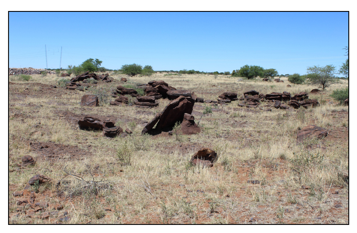
Figure 2: The area was previously disturbed where the top soil has been extracted for road construction activities, note the exposed dolomite rocks.