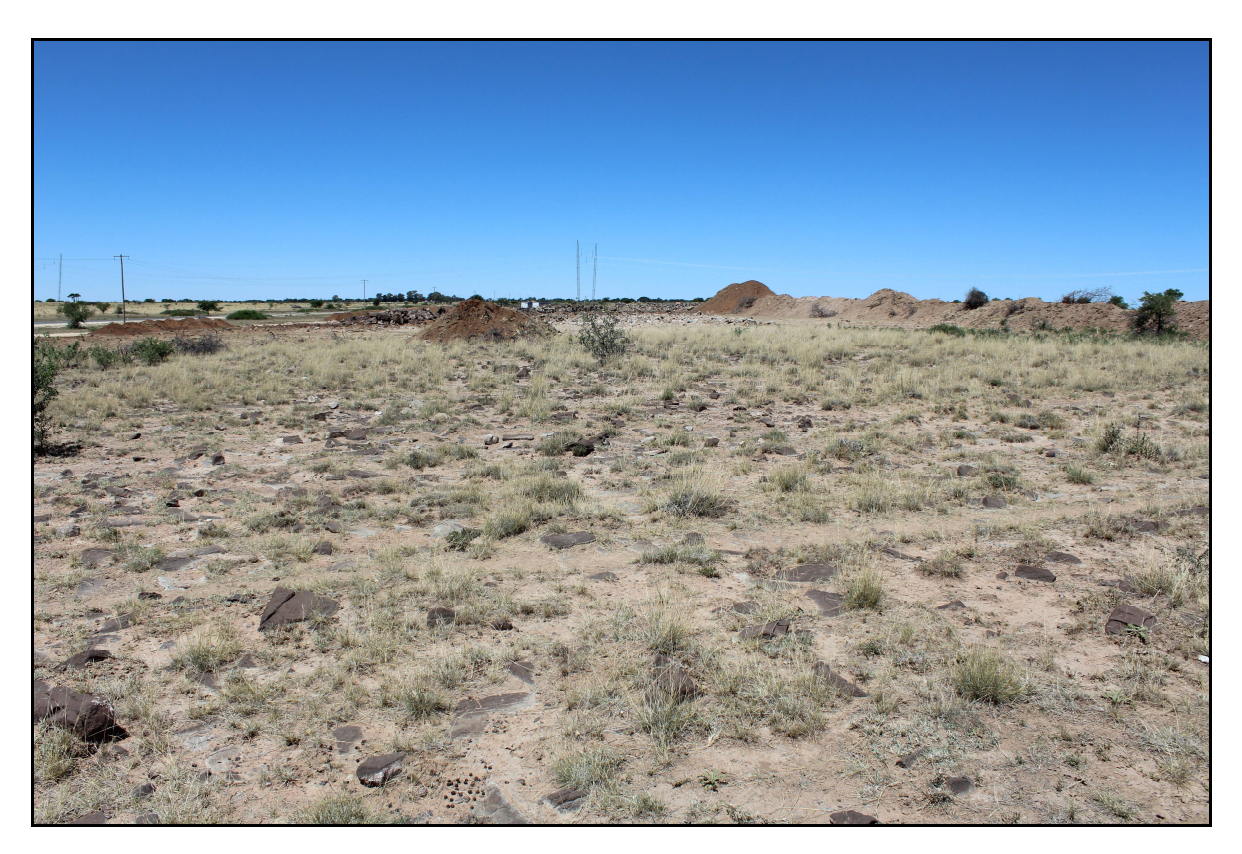
Figure 1: View of the study area dominated by protruding rocky outcrop

✓ Mining of Dolomite rocks for commercial market such as concrete aggregates for roads and houses constructions.