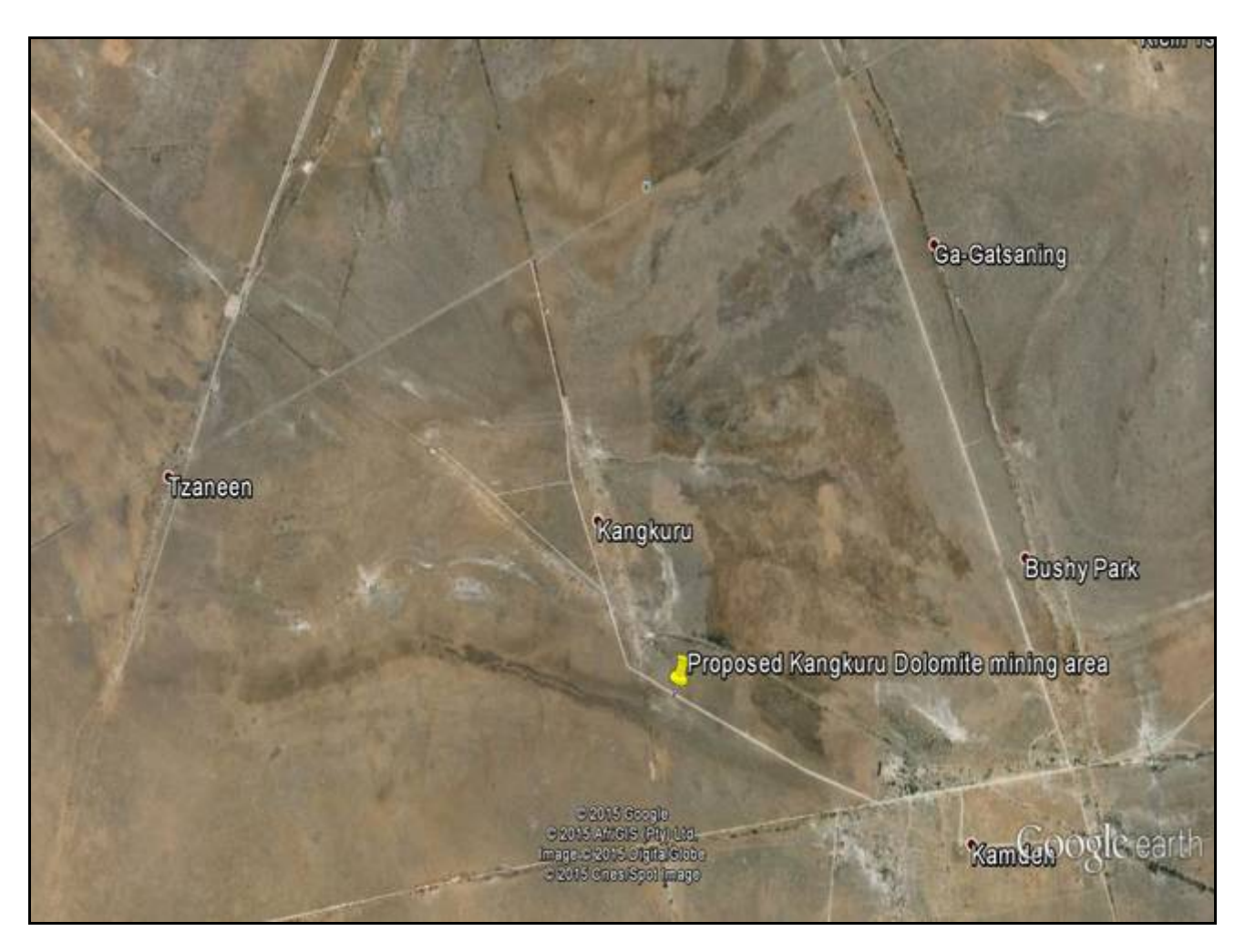
Figure 5: View of the study area adopted from Google earth Map program