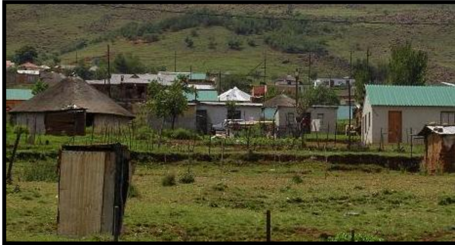
Figure 3. Rural homesteads adjacent to Road D 1376 at Emaswazini