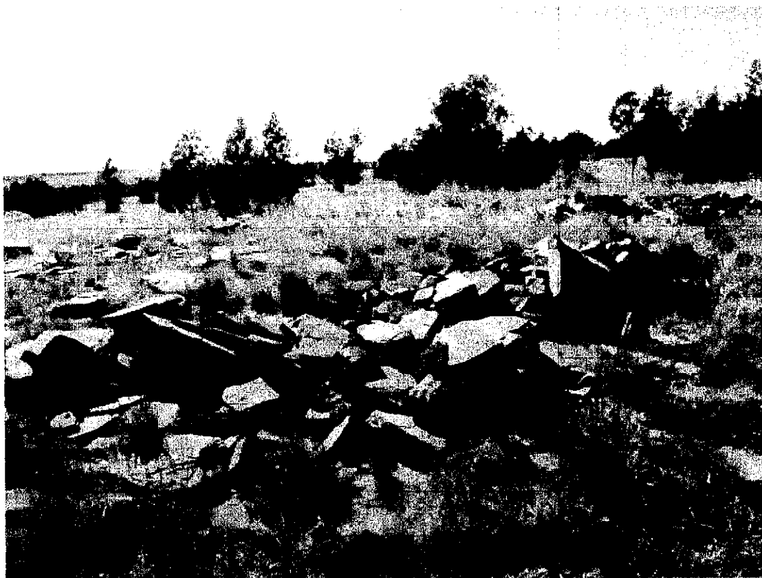
One of the three quarries