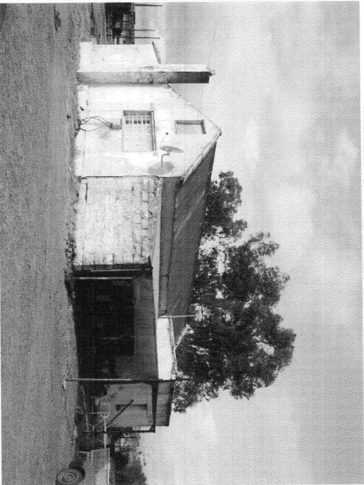
No. 1 The old farmhouse with its lean-too and front veranda