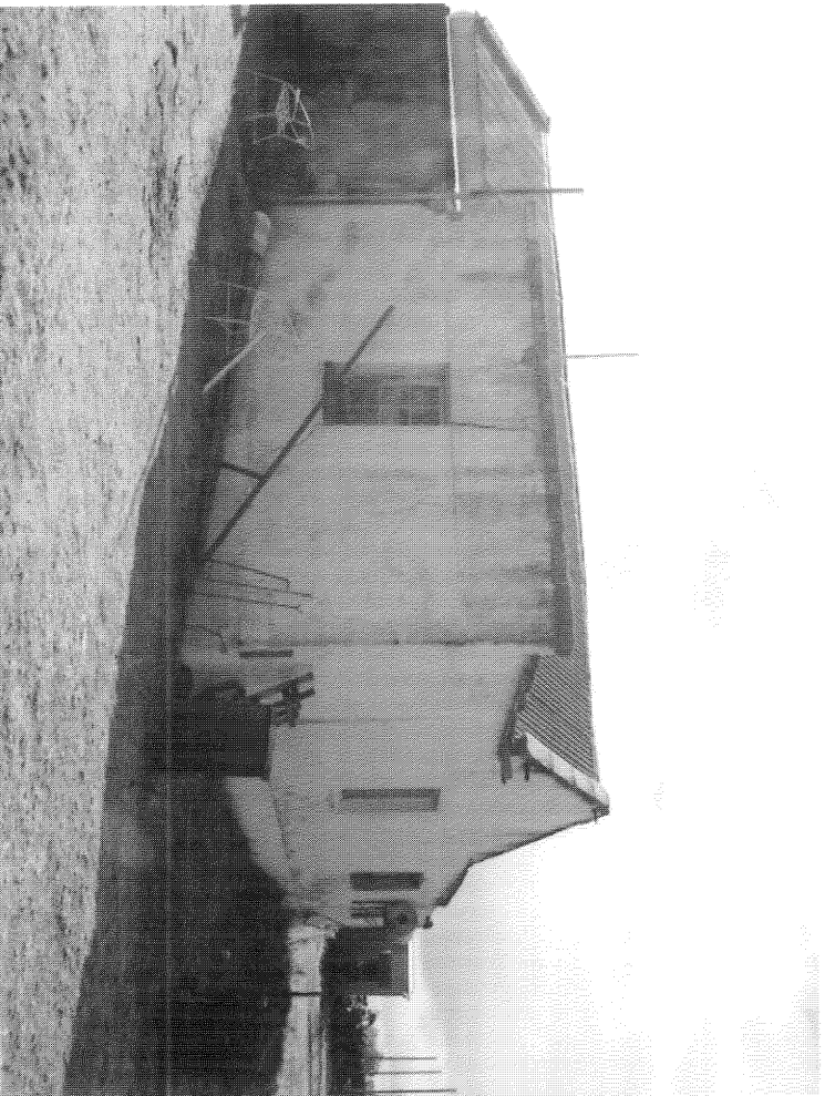
No. 2 The additional bedroom added to the front of the house