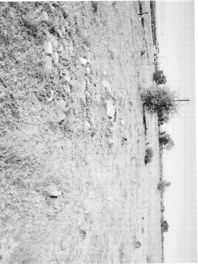
No. 6 Cemetery of the farm workers. Many of the graves are hardly recognizable.