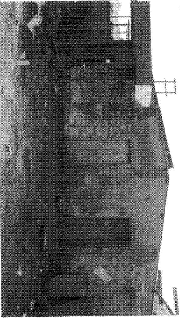
No. 3 The southern view of the outbuilding