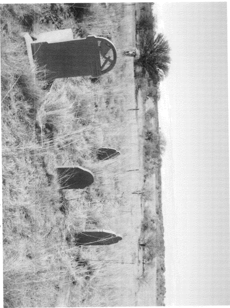
No. 4 Some of the handmade tombstones made out of wonder stone