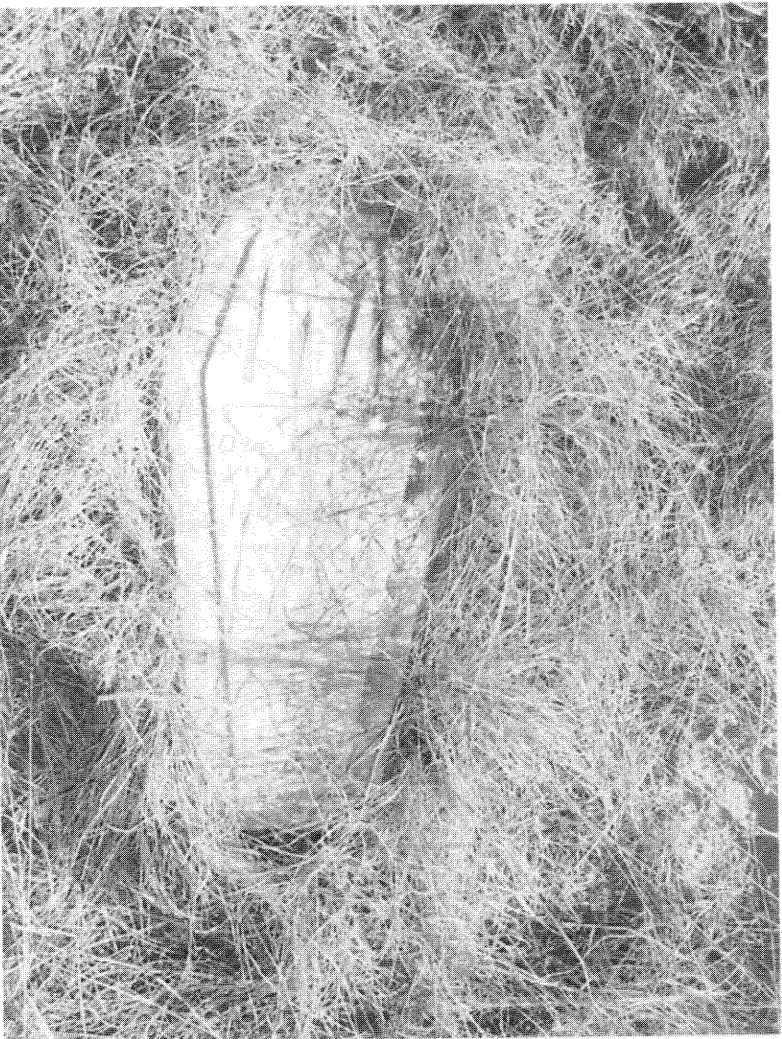
No. 5 One of the oldest tombstones made of sandstone in the shape of a coffin