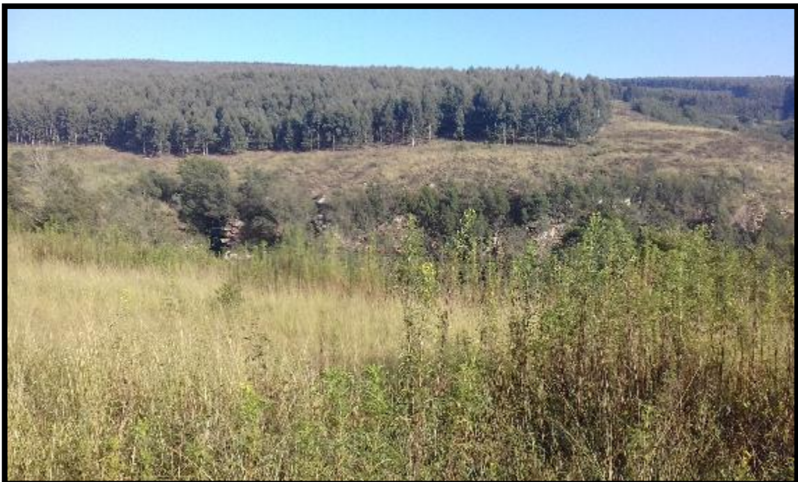
Figure 4. Grasslands and commercial woody plantations flanks the proposed pipeline trajectory in the western section of the footprint.