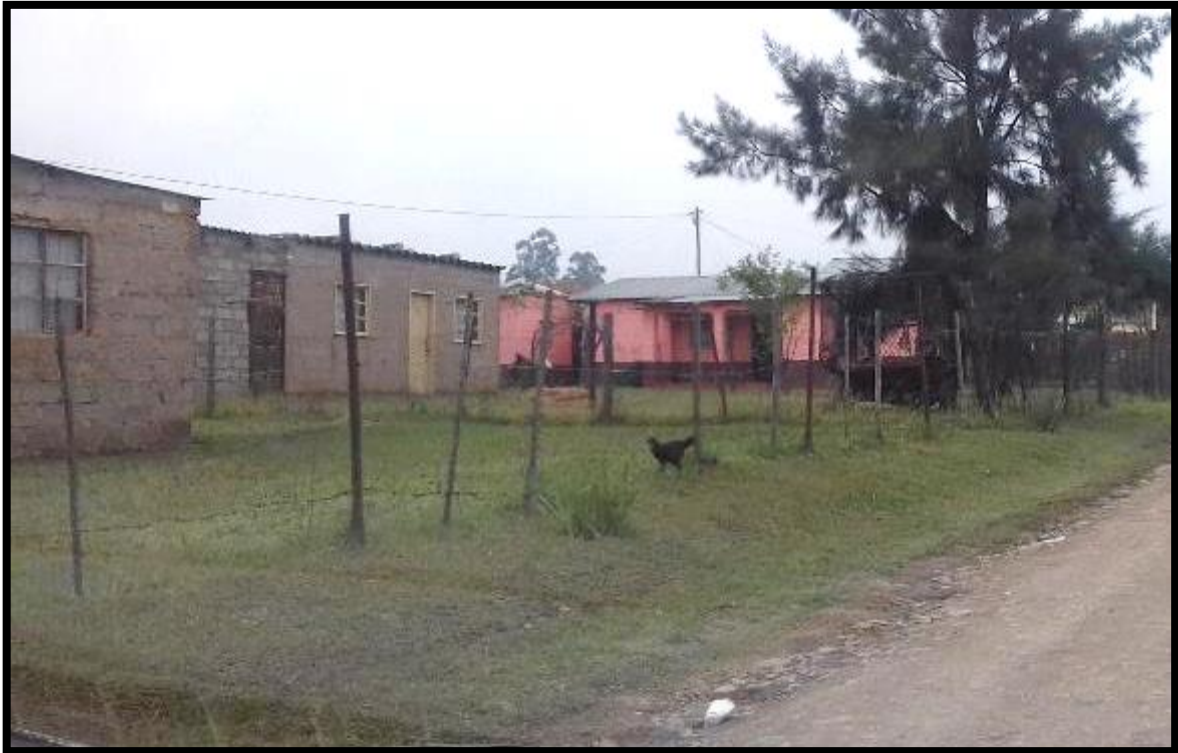
Figure 5. Although rural settlements occur along the proposed pipeline trajectory none had graves within 50m from the footprint.