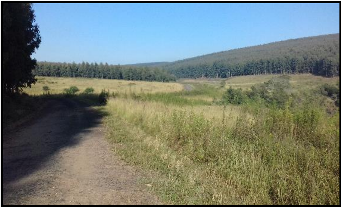
Figure 3. The proposed pipeline trajectory follows the existing road reserve for most of the way. No heritage sites occur on the footprint.