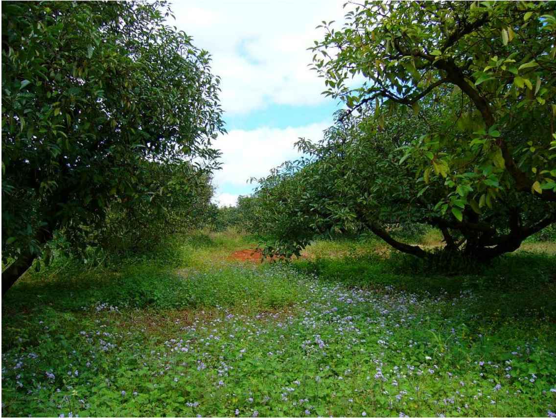
Fig 1. View of development area