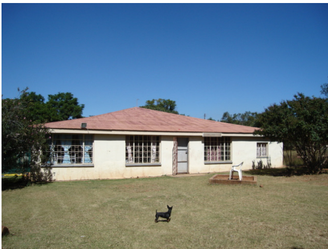
Modern houses on the smallholding