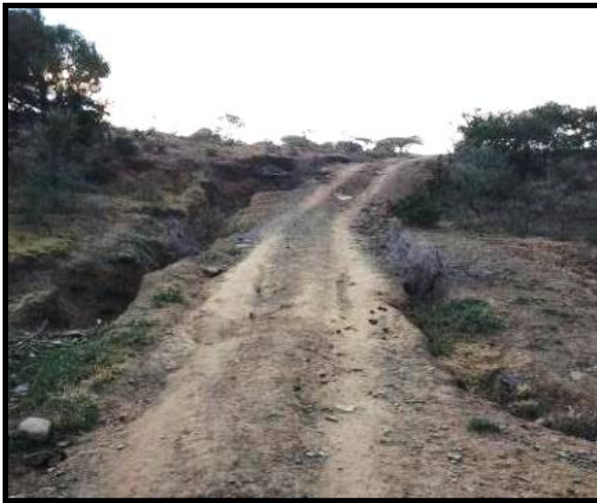
Figure 3. Photograph of the existing track.