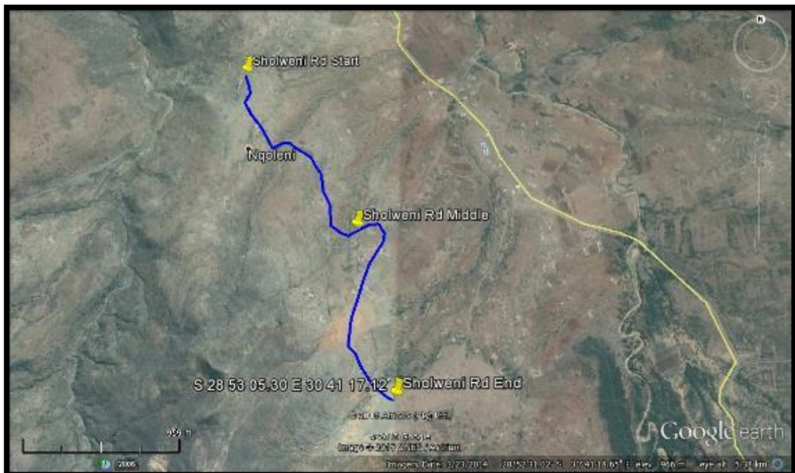
Figure 2. Google aerial photograph showing the location of the proposed Sholweni Road Upgrade at Msinga, northern KwaZulu-Natal.