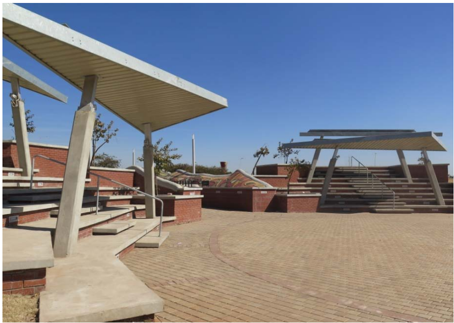
Amphitheatre with Mamelodi Memorial Wall leading to the statue.