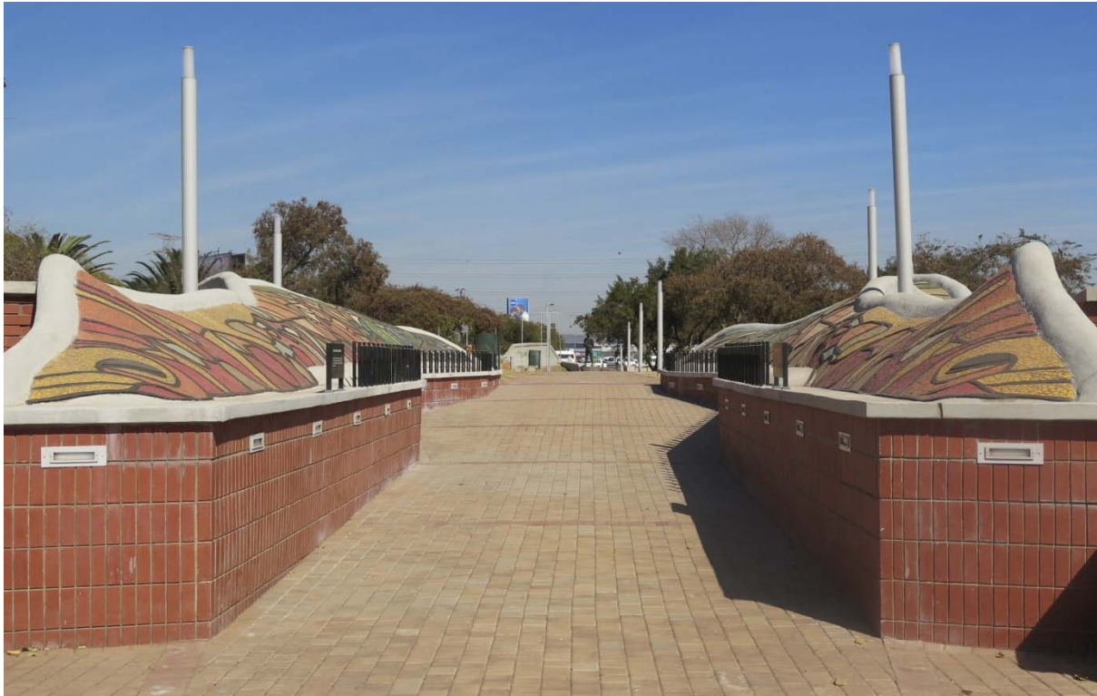
Mamelodi Memorial Wall with Mamelodi Victims of Conflict batons on either side of the walls.

of conflict in Mamelodi, as tranquil place in which to remember them and reflect upon the struggles of the past sacrifices made”. On the other side the Mamelodi Victims of Conflict Wall reads as follows, “This Memorial Wall provides a space to remember the victims of conflict in Mamelodi. More names will be added as new candidates are presented and verified. Public submissions should please be made to the City of Tshwane’s Heritage Department by e-mailing: Heritage@Tshwane.gov.za