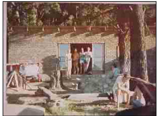
Figure 4 Two photographs copied from the website of the Transvaal Sub-Aqua Club ( www.cyberclub.co.za/tsa ). They were taken in 1983 and show the clubhouse during construction. The remains of the clubhouse were identified during the fieldwork (see Building 4 below).