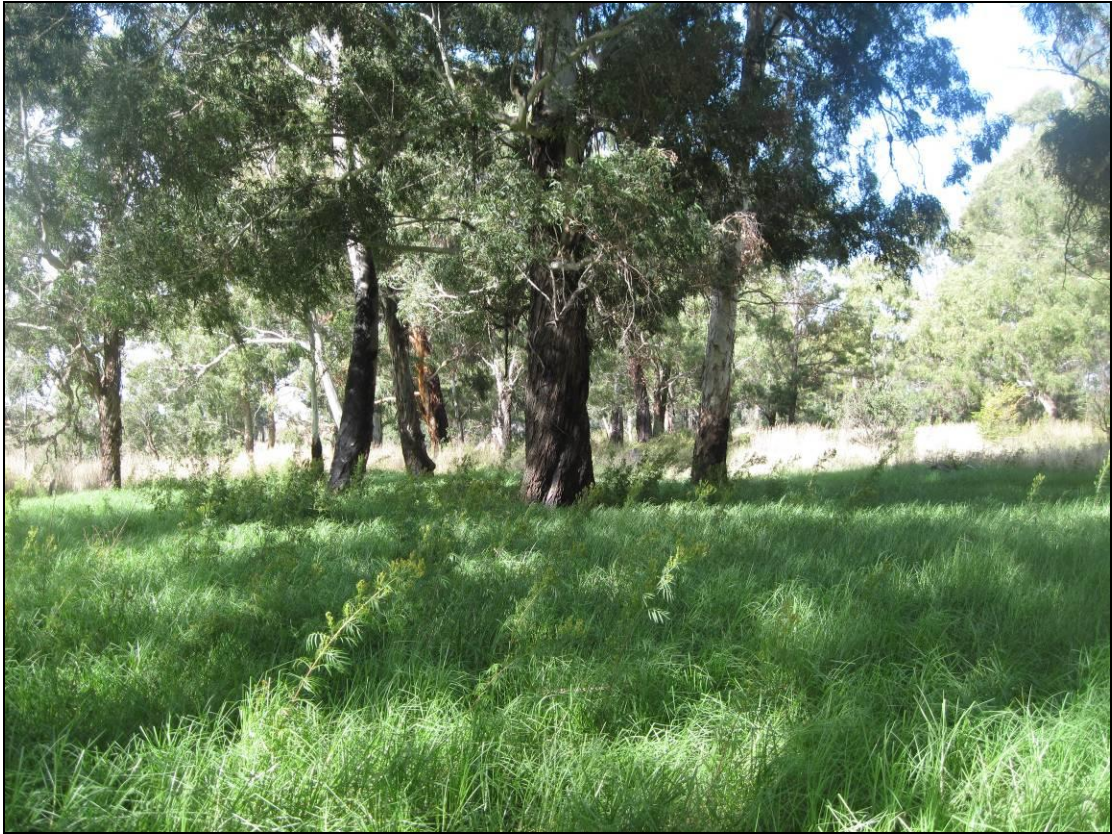
Plate 1 General view of a section of the study area.