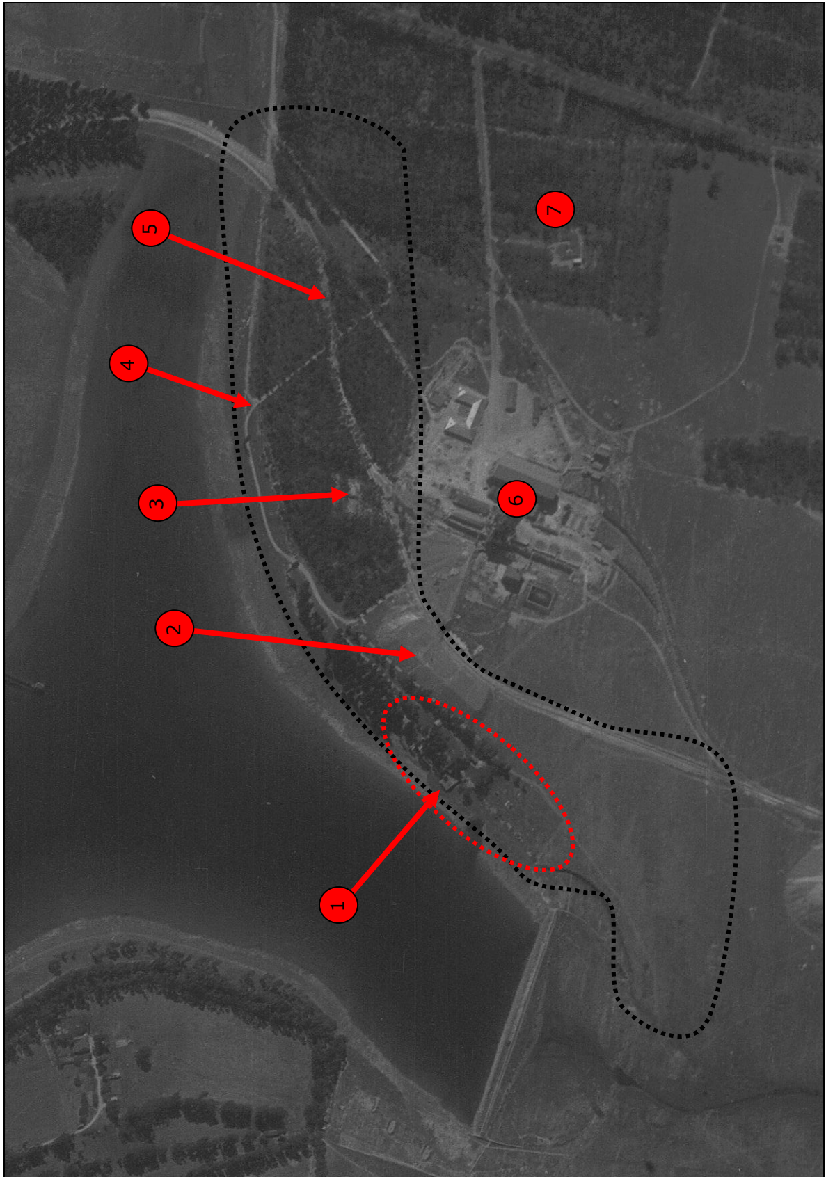
Figure 3 Enlarged section of the 1952 aerial photograph. The black dotted line provides an indication of the approximate position of the study area.