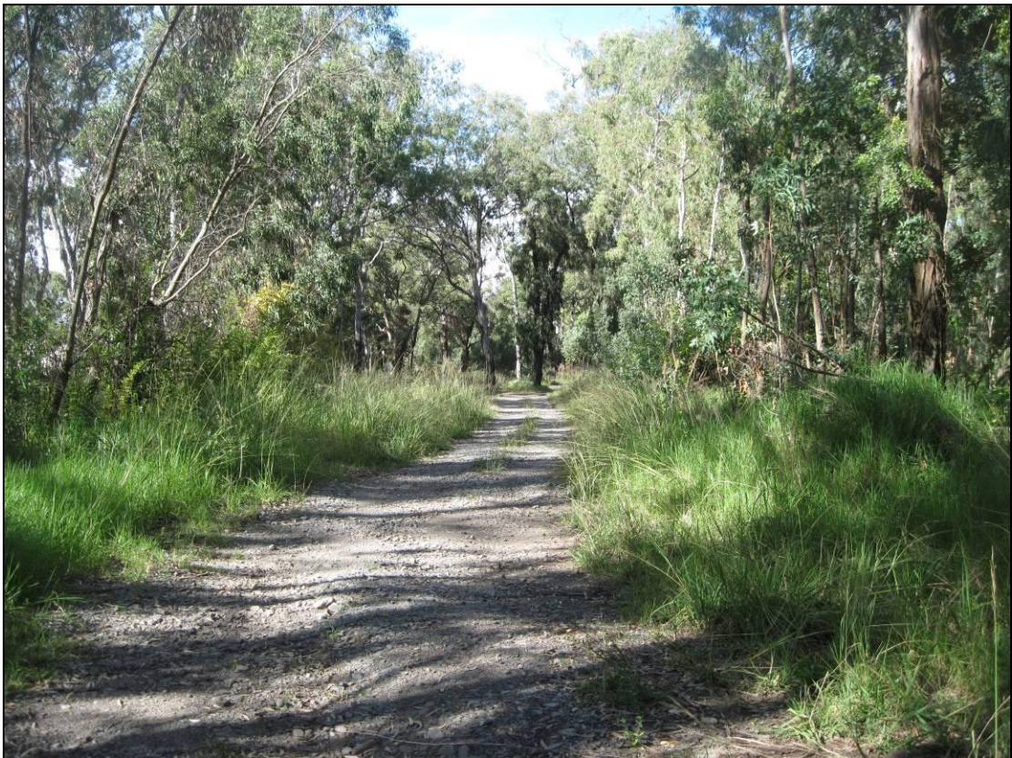
Plate 2 This gravel road runs through almost the entire study area and represents one of the man-made disturbances found on site.