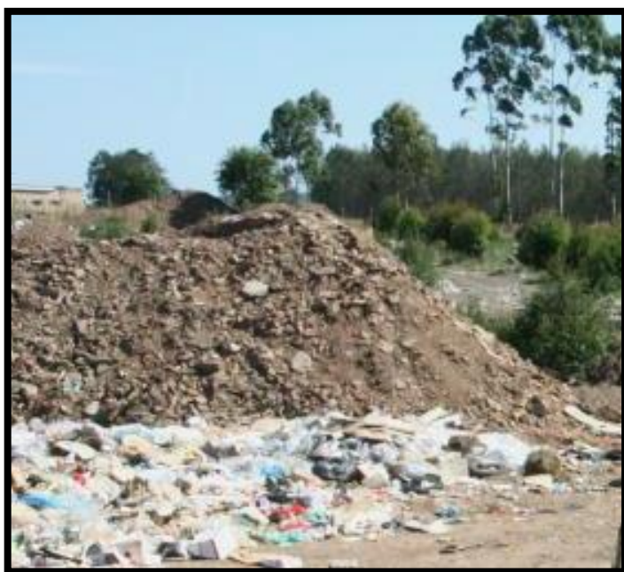
Figure 4. Photograph of the Harding Landfill Site showing a Eucalyptus plantation bordering onto the present site.