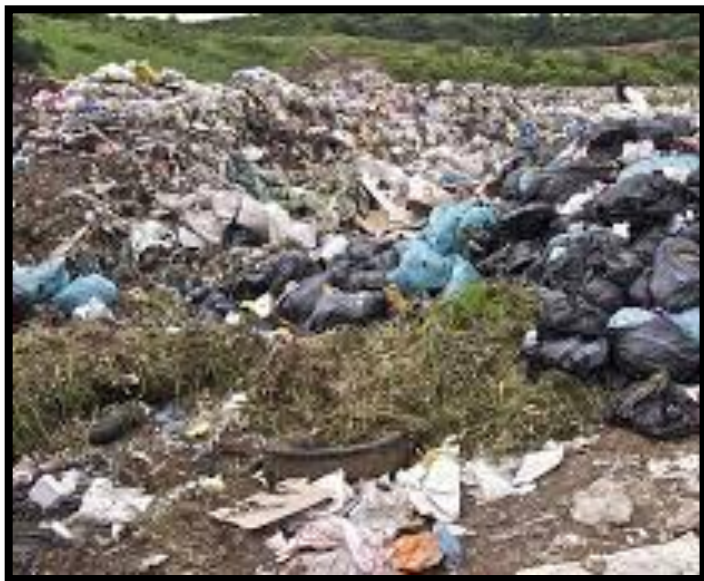
Figure 3. Photograph of the Harding Landfill Site, no heritage sites were observed on the footprint.