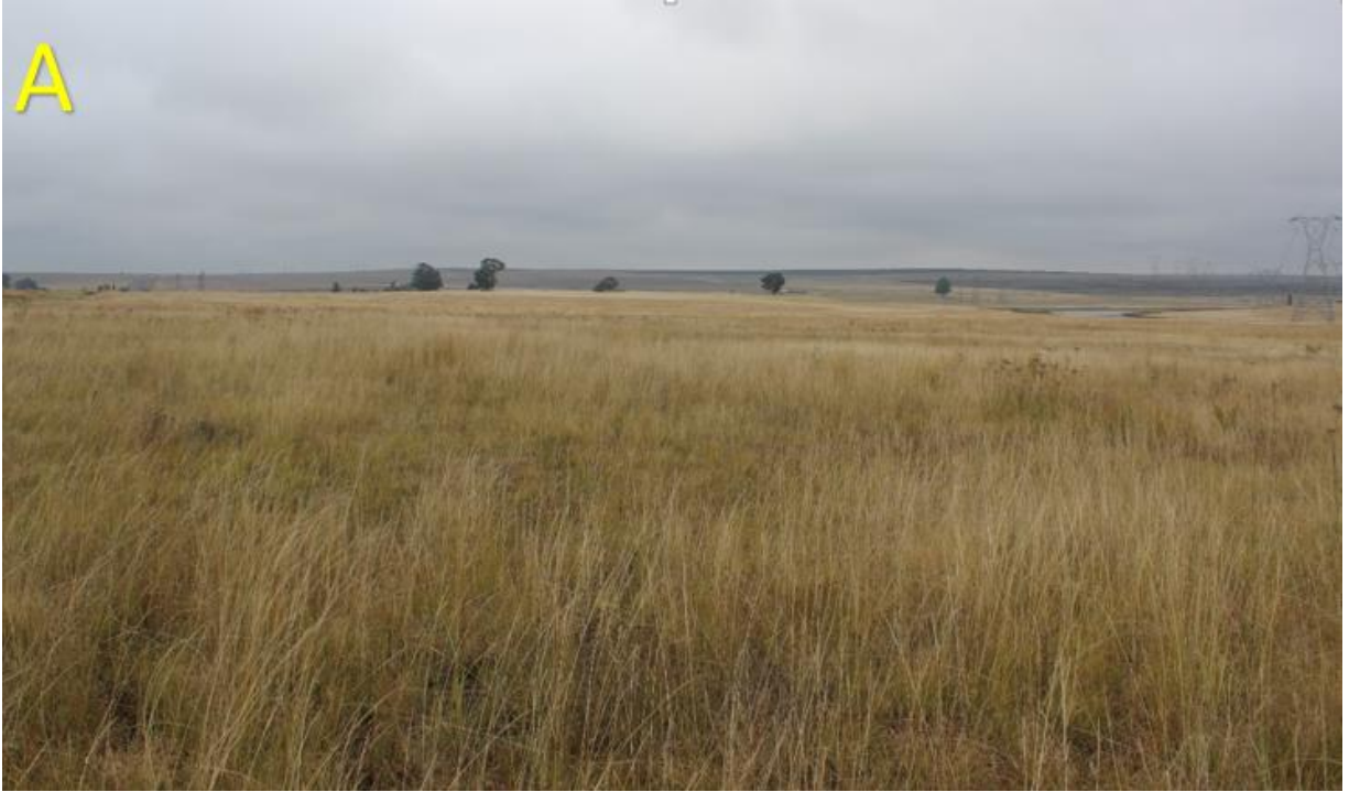
Photograph 1: Site characteristics A