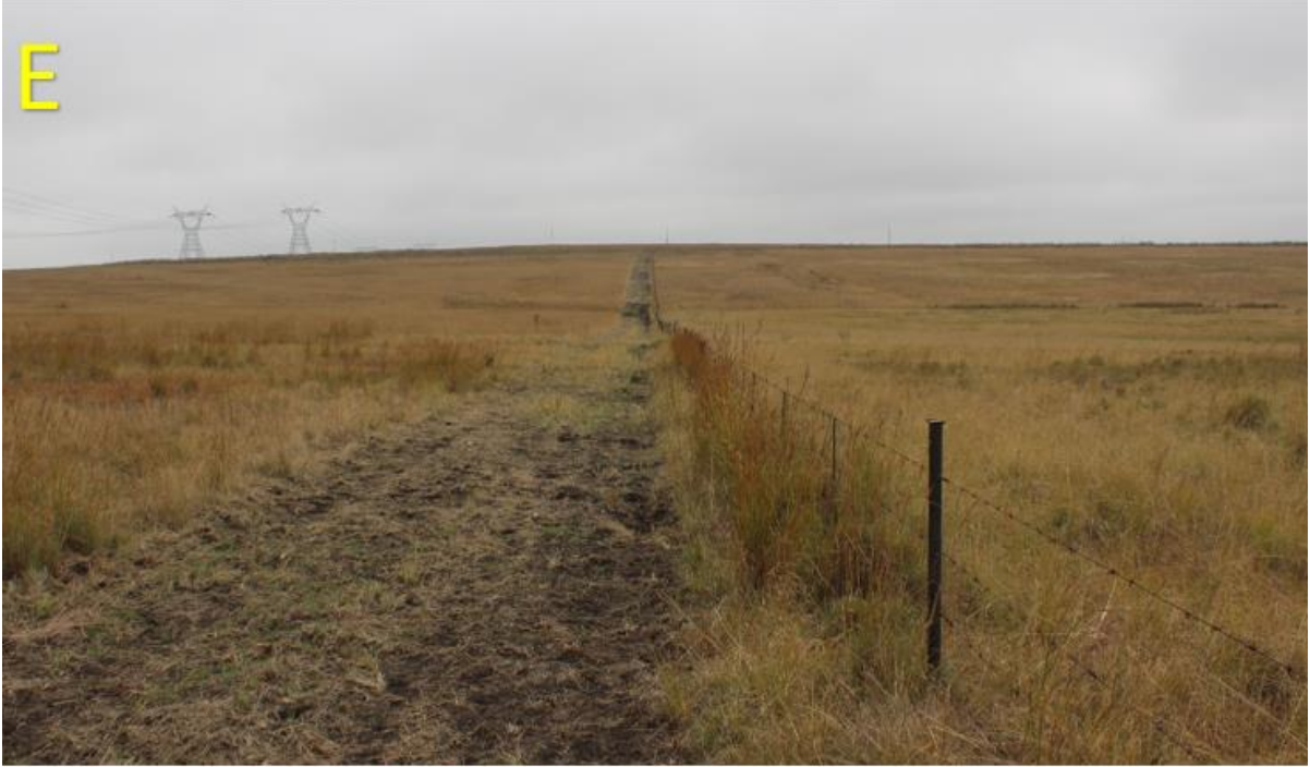
Photograph 5: Site characteristics E