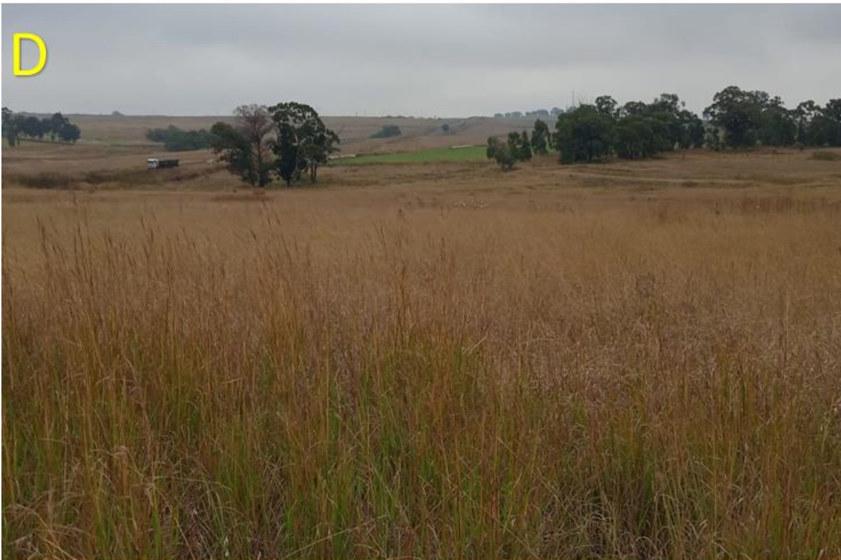
Photograph 4: Site characteristics D