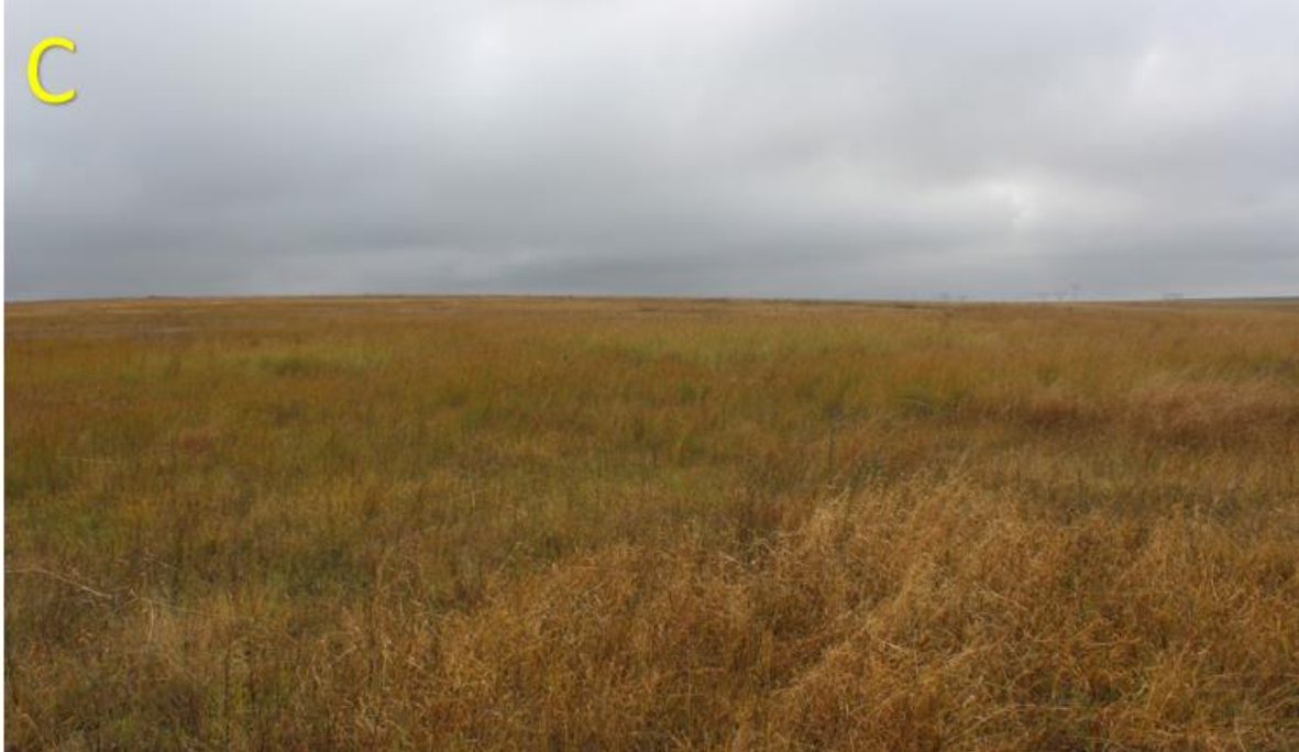
Photograph 3: Site characteristics C