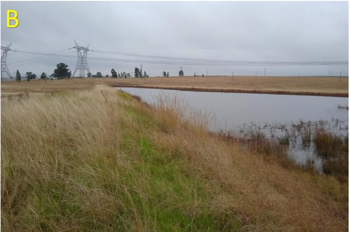
Photograph 2: Site characteristics B