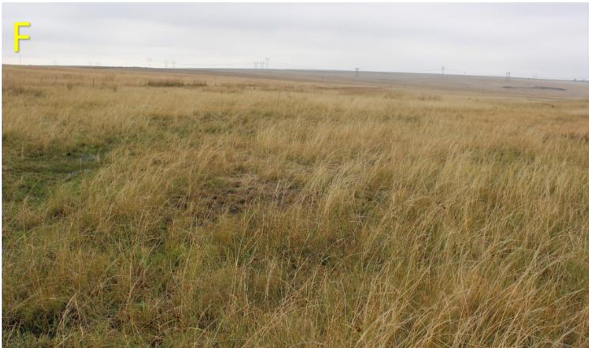
Photograph 6: Site characteristics F