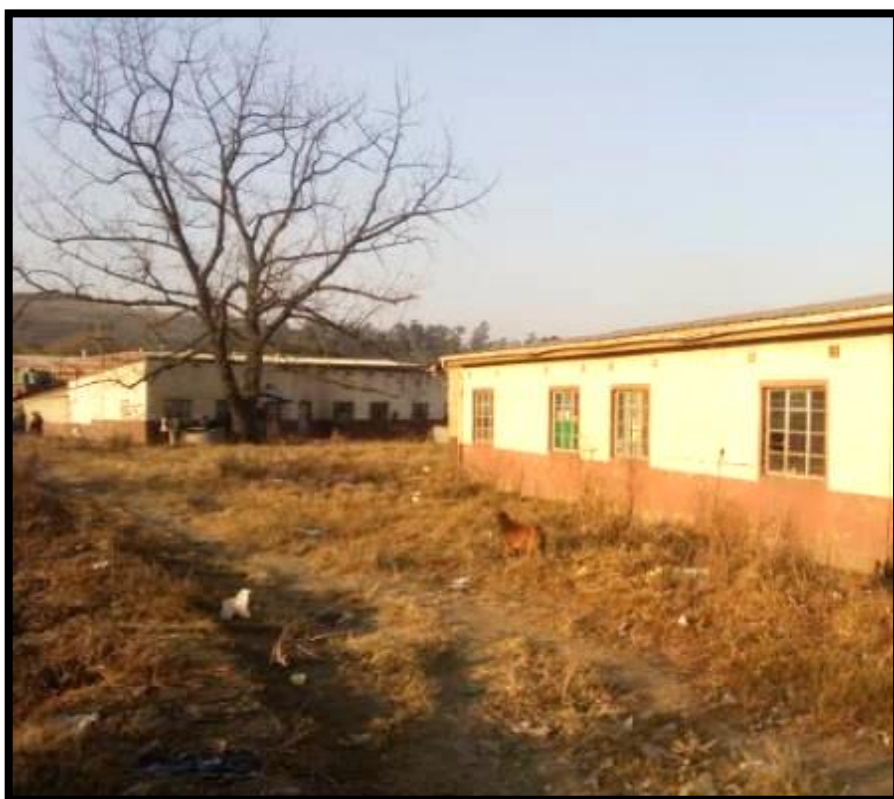
Figure 3. Although some buildings occur on the southern border of the footprint none of these have any heritage values.