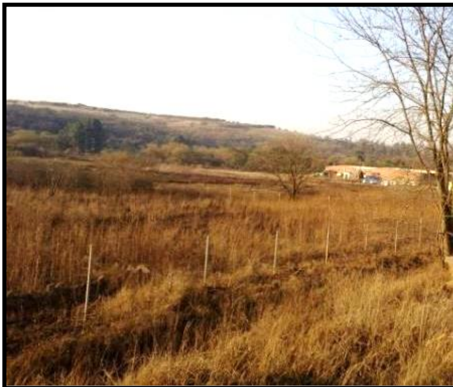
Figure 2. Photograph of the proposed development site.