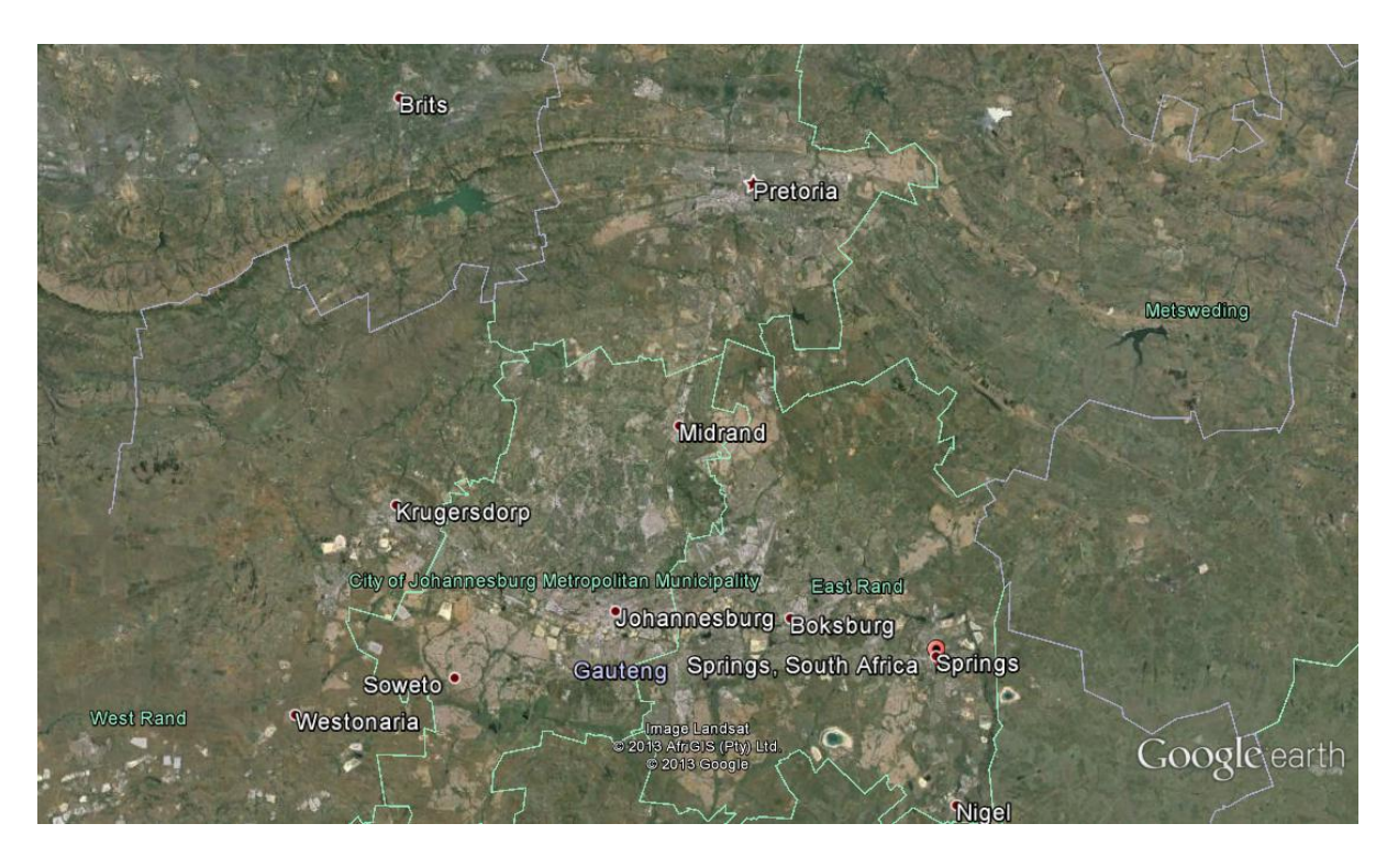
Figure 1 Location of the town of Springs in the Gauteng Province. North reference is to the top.

The study is done with the purpose of a Basic Assessment which currently is in the announcement phase. The client indicated the area to be surveyed. The field survey was confined to this area.