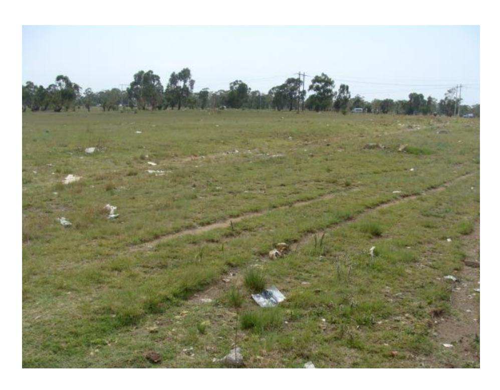
Figure 6 Old fields in the surveyed area.