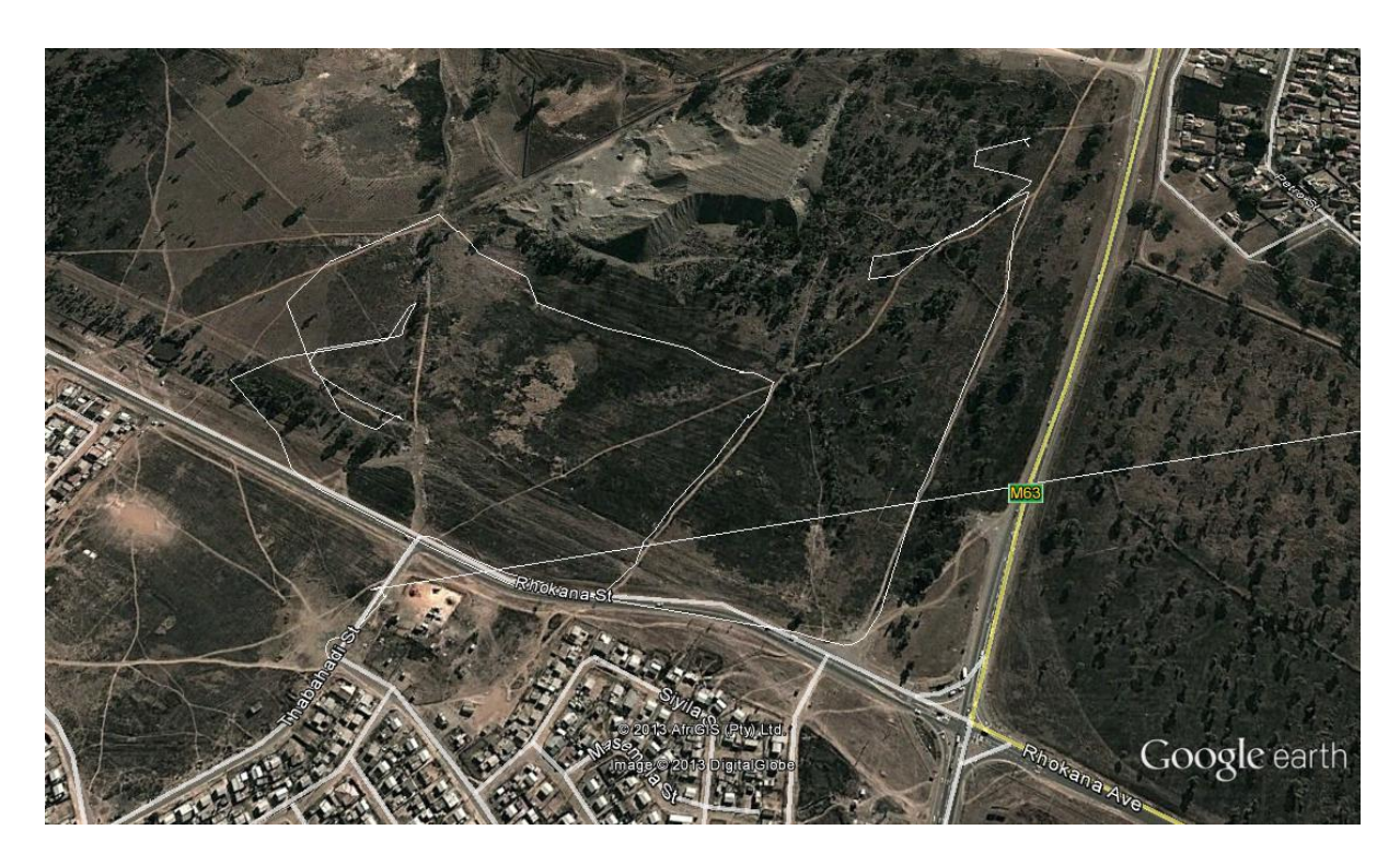
Figure 4 GPS track of the surveyed area. North reference is to the top.