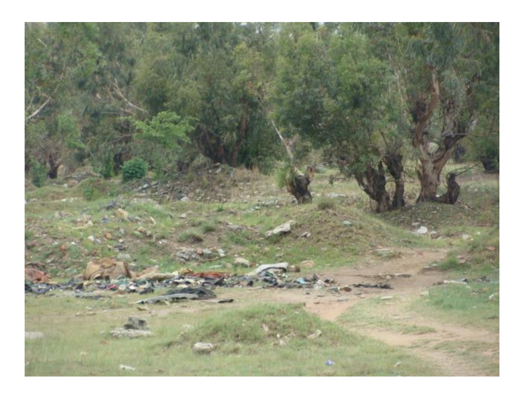
Figure 7 Signs of illegal dumping in the surveyed area.