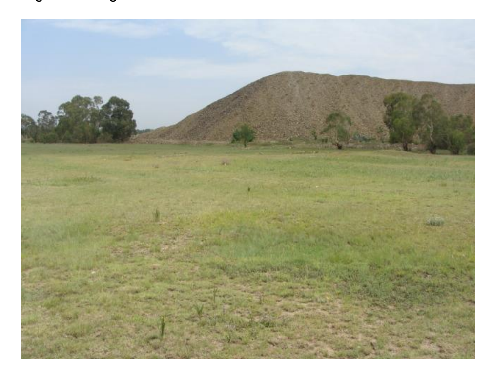
Figure 5 General view of the surveyed area with the sand mine in the background.

The topography of the surveyed area is level. There are no outstanding outcrops or rivers nearby. The area is a small bit of green disturbed landscape in between an urban setting consisting of houses and streets.