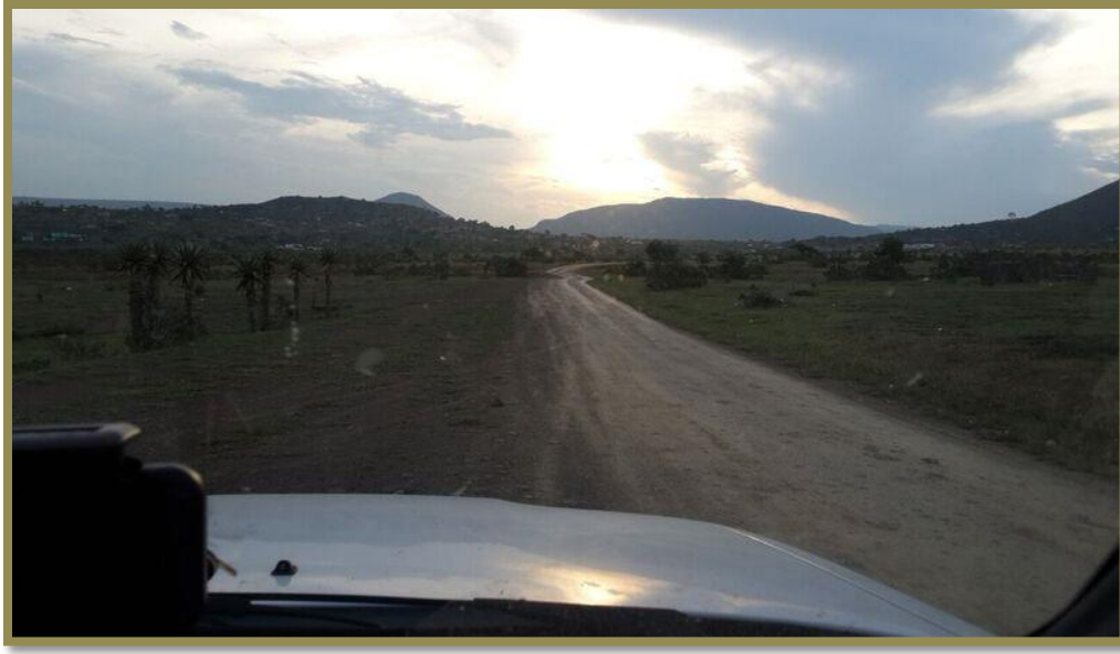
Figure 3 Existing alignment due for upgrade