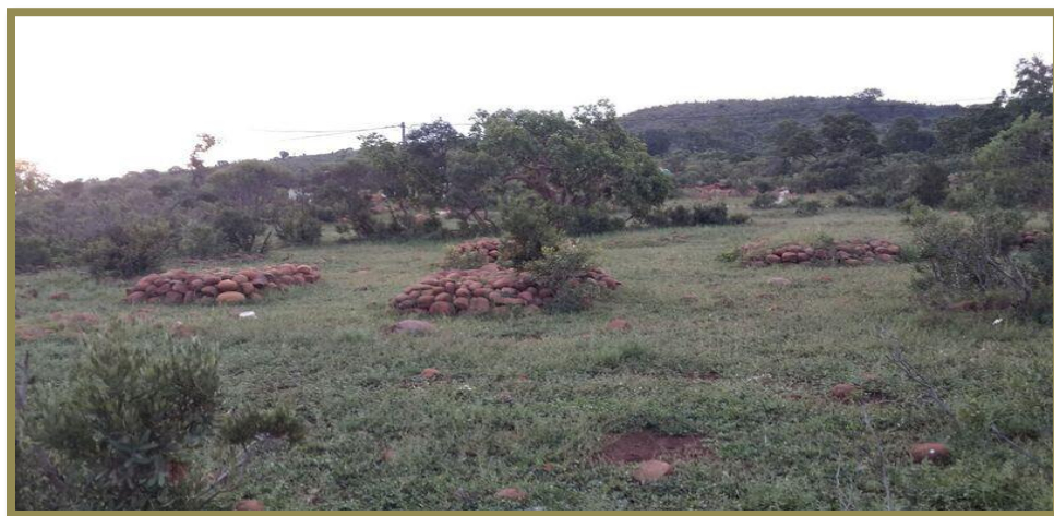
Figure 2 Typical family cemeteries adjacent to road alignment along Mabaso 2B