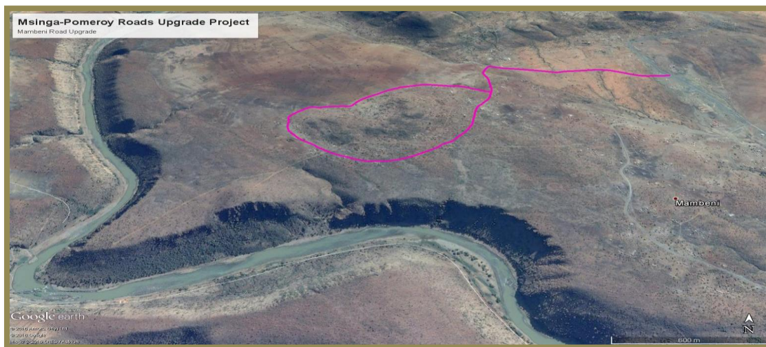
Figure 1 Locality map of the proposed Mambeni road alignments

See survey track data shown in Appendix 1.