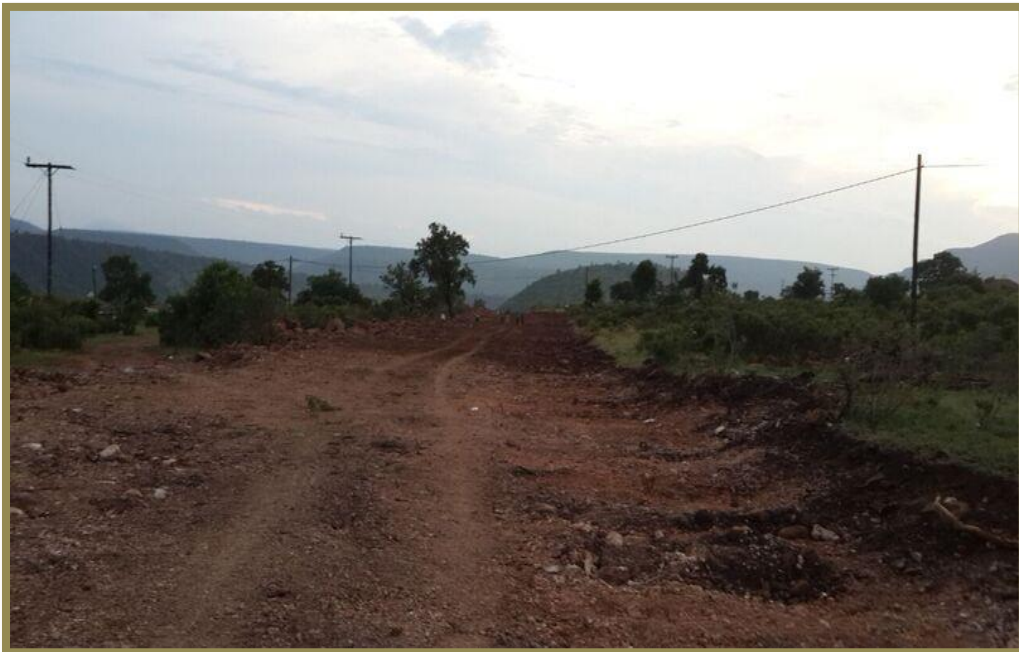
Figure 4 Existing alignment due for upgrade