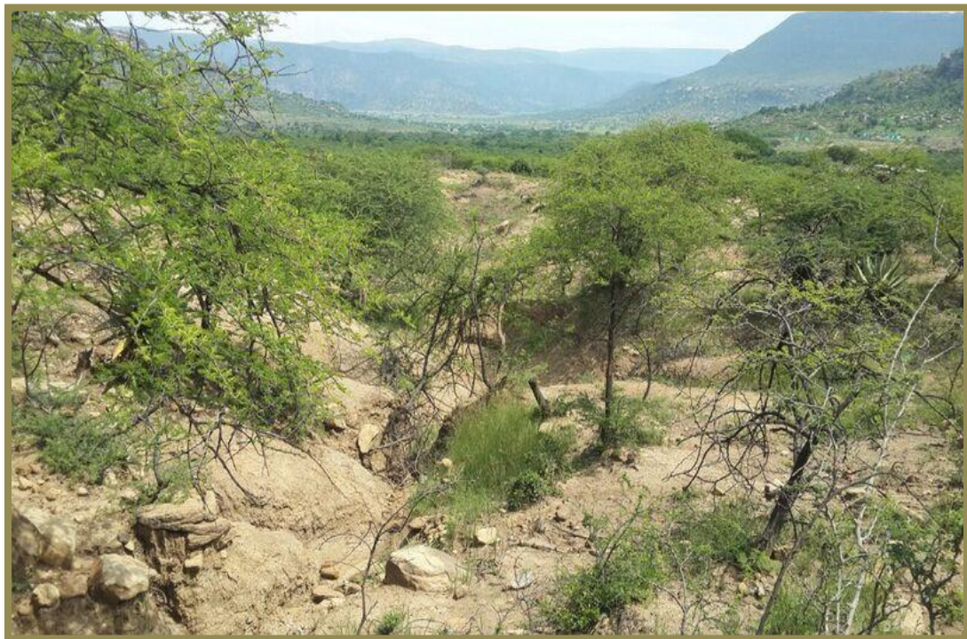
Figure 6 Typical donga environment within which scattered colluvially washed and patinated hornfels MSA debitage was observed