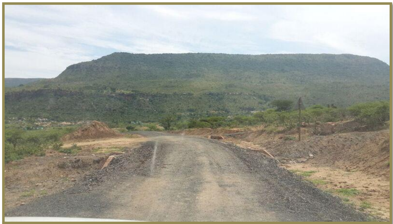
Figure 2 Obisini road upgrade along existing road alignment