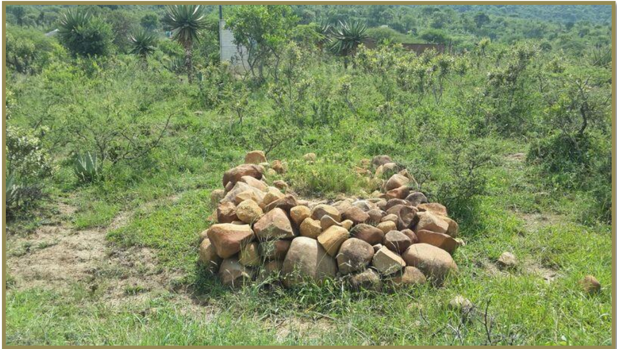
Figure 3 Typical stone-packed grave