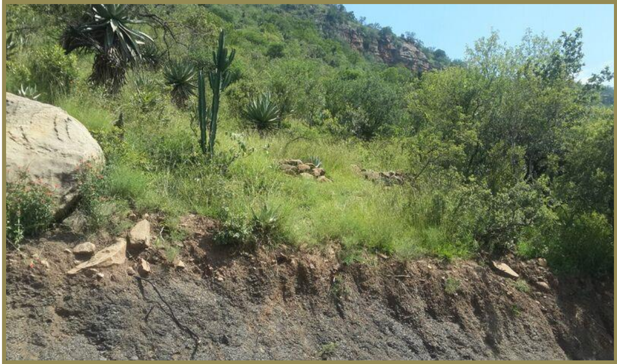
Figure 5 Graves located precariously above the hanging wall of a road cutting