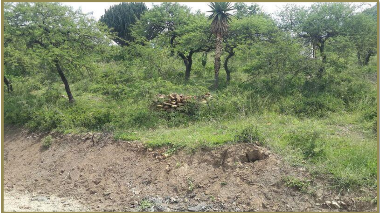
Figure 4 Stone-packed grave in close proximity to graded existing alignment