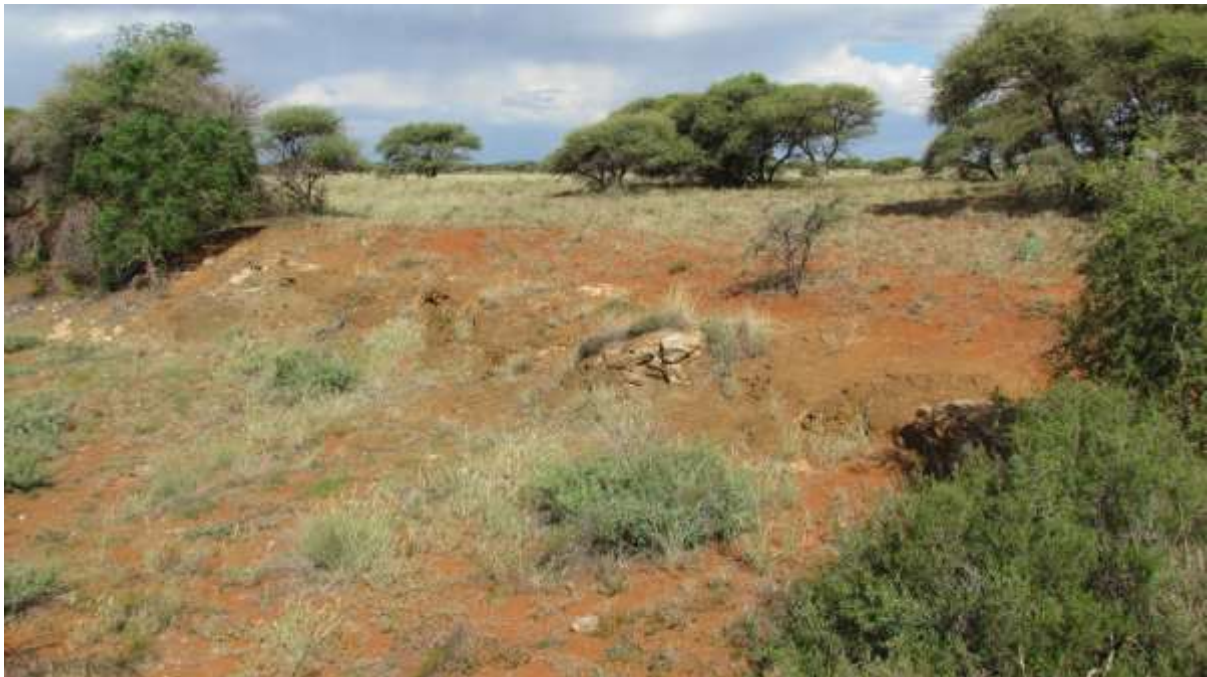
Edge of borrow pit at GPS point 330 (Map 5).

This entire area is covered with Aeolian Hutton Sands which very substantially overlie or contain the traces of Stone Age inhabitation, known to occur often at the base of the sands in adjacent areas. This was confirmed in almost all places where the sand has been cleared away either by natural erosion or, more commonly, on the edges of borrow pits, or where burrowing animals such as ant-eaters have brought material to the surface. The edges of borrow pits provided opportunities to assess comparative density of material relative to findings at the nearby Roseberry Plains sites (Beaumont 1990). In all cases in the study area densities of artefacts can be said to be comparatively much reduced: none of the occurrences could be said to be significant.