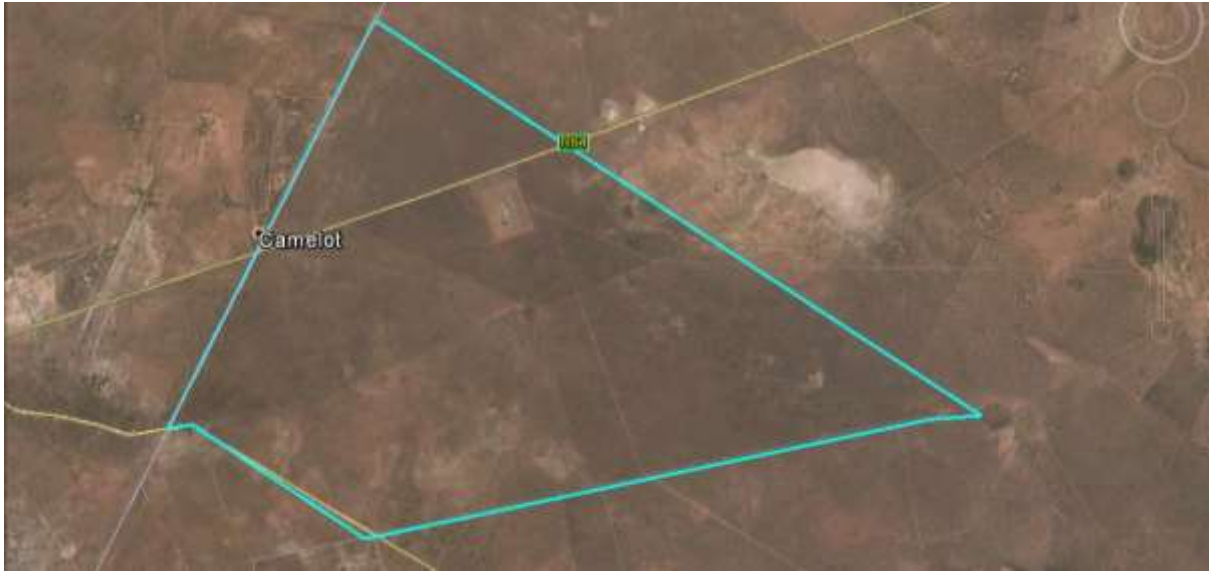
Map 1. Google Earth image (above) indicating the project area straddling the Kimberley-Boshof road east of Kimberley.