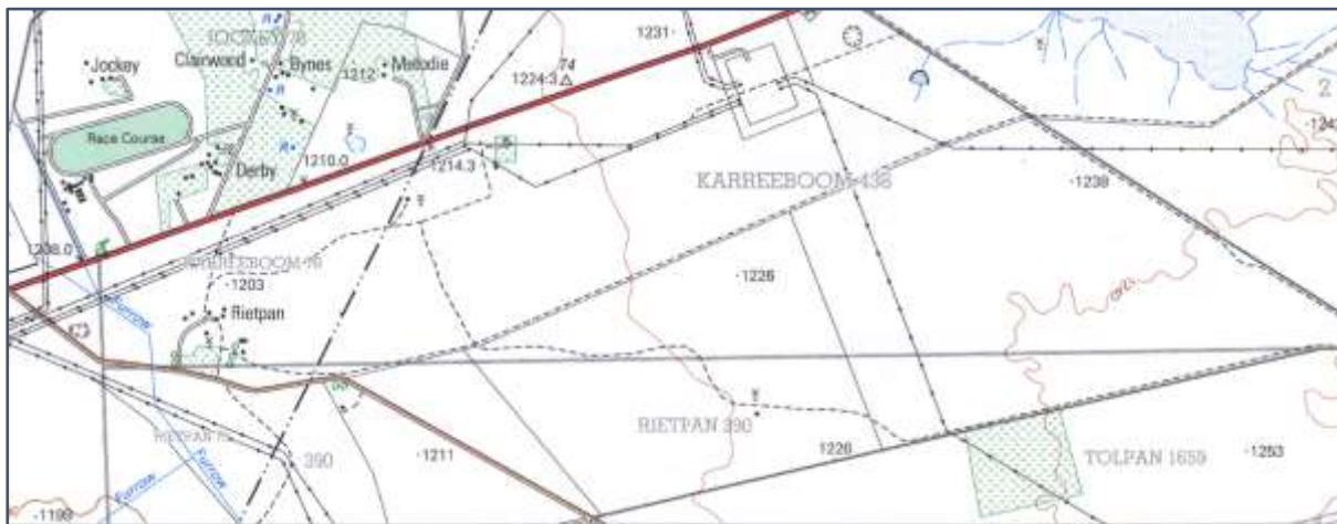
Map 2. Extract from sheet 1:50 000 2824DB showing Karreeboom 438 and Rietpan 390(which is now known as Karreeboom 1716 – study area).