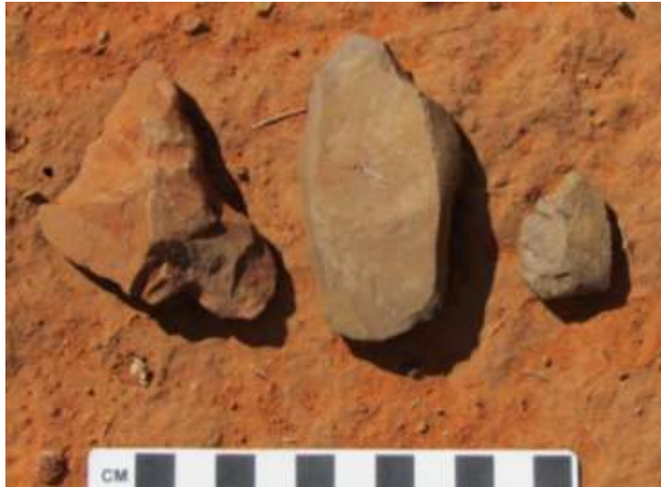
Cf Fauresmith artefacts found at the edge-of-quarry interface between Hutton Sands and underlying decomposing dolerite at GPS point 330.