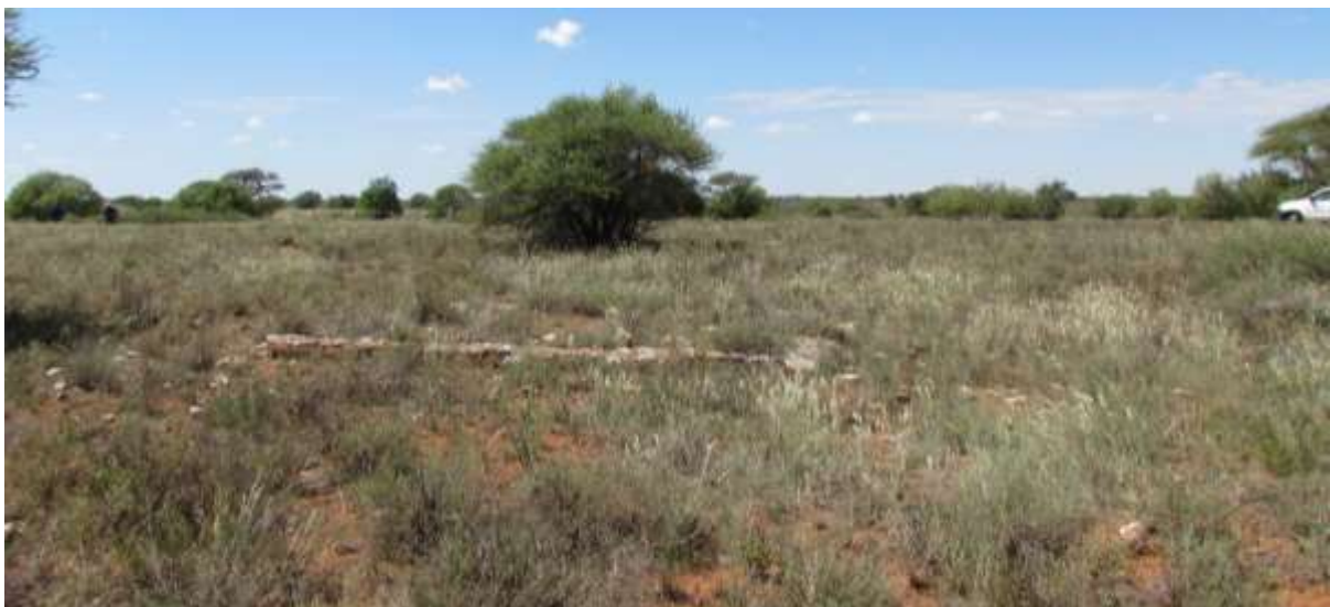
Foundation of the northern-most of three adjacent structure identified as the OFS Custom House.

GPS point 300 is a limestone-walled feature, possibly a small kraal, while the line of features numbered 302, 303 and 304 are clear rectangular building foundations most likely representing the actual custom post. Points 299, 301 and 305-6 are traces of middens, the most substantial of which is at 306. These places constitute a sensitive heritage feature which should not be disturbed by the development. The area circled in red should be regarded as sensitive – including the gum trees outside of the property which probably date from the time of the Custom House.