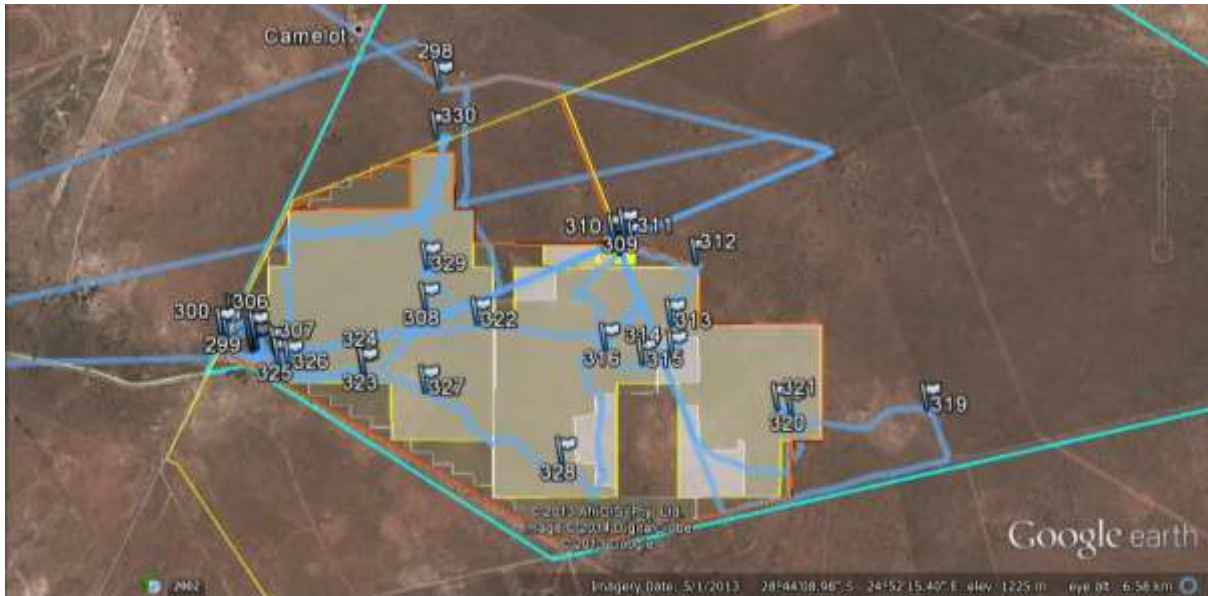
Map 5. GPS tracks: study area as a whole.