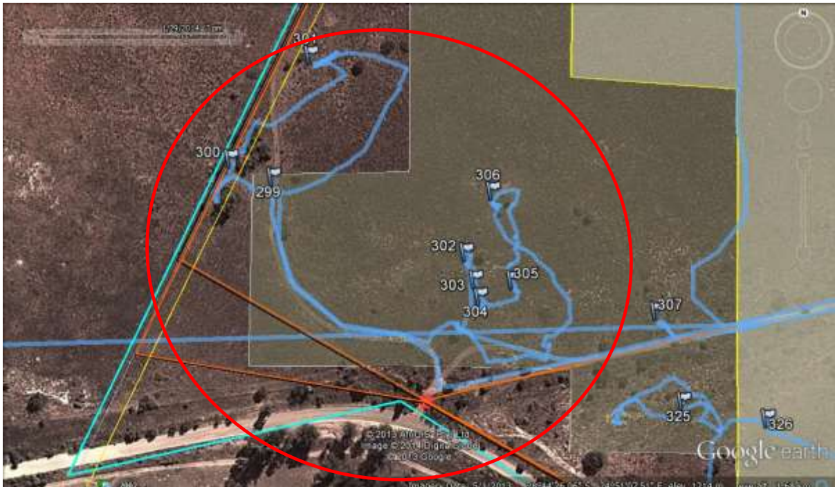
Map 7. GPS tracks: detail at western end of the study area.

GPS point 300 is a limestone-walled feature, possibly a small kraal, while the line of features numbered 302, 303 and 304 are clear rectangular building foundations most likely representing the actual custom post. Points 299, 301 and 305-6 are traces of middens, the most substantial of which is at 306. These places constitute a sensitive heritage feature which should not be disturbed by the development. The area circled in red should be regarded as sensitive – including the gum trees outside of the property which probably date from the time of the Custom House.