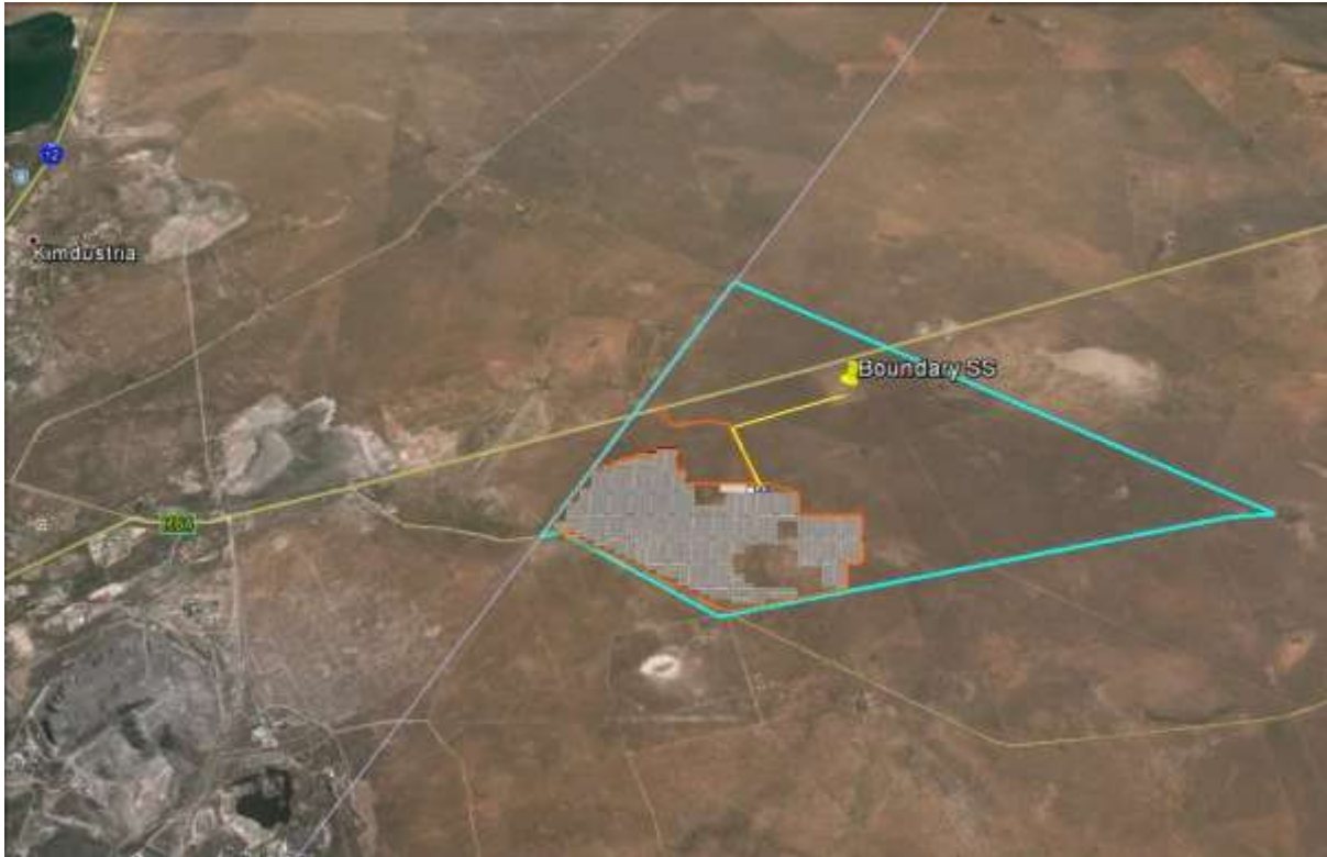
Map 3. The proposed layout of the facility (revised version received 29 Jan 2014).