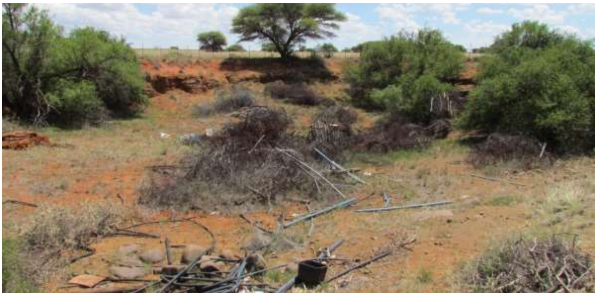
Borrow pit with twentieth and twenty first century dumping at GPS point 308 (Map 5). Very few Stone Age artefacts were noted around its edge, these being heavily patinated hornfels flakes most likely ascribable to Middle Stone Age or cf Fauresmith (pictured below).