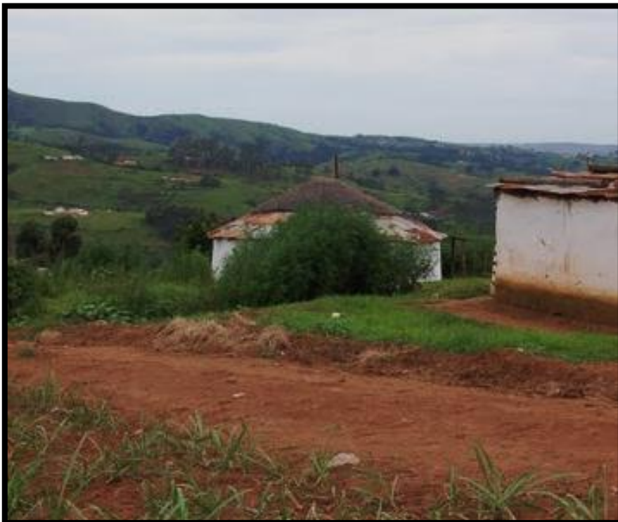
Figure 4. Most of the proposed pipelines will follow the existing road network of the project area. These often occur in the close proximity of rural settlements that may harbour “invisible graves” within the homestead.