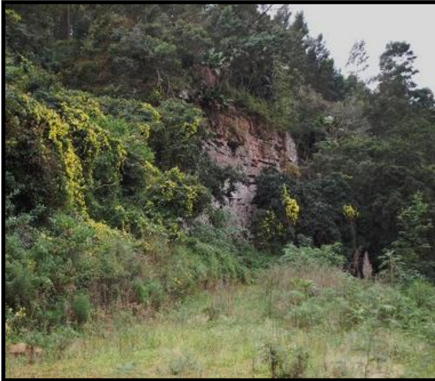
Figure 3. Although rocky outcrops occur in some valleys none harboured caves or shelters with potential archaeological deposit.