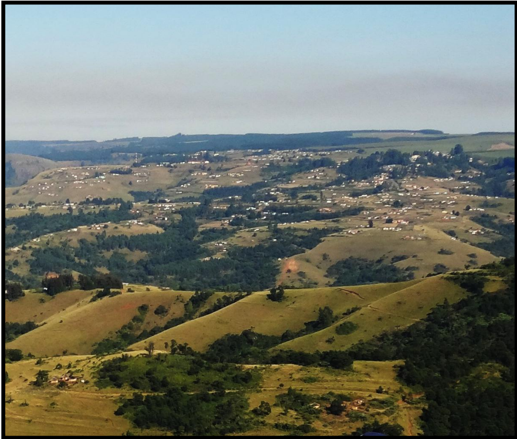
Figure 2. View over the project area. Most of the project area is covered by grassland. Indigenous woody vegetation occurs in the valleys whilst exotic woodlots occur on the higher altitudes. Rural homesteads are scattered in a typical Nguni dispersed settlement pattern.