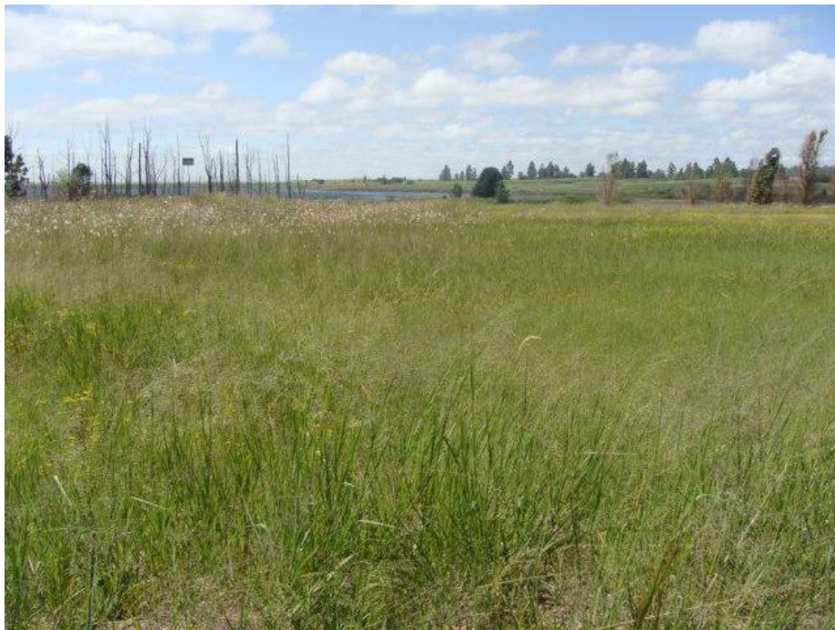
Figure 3 General view of the surveyed area where the small dam is being proposed.