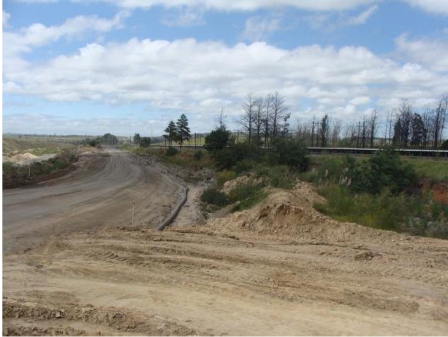
Figure 4 General view of the surveyed area where the pipeline is proposed.