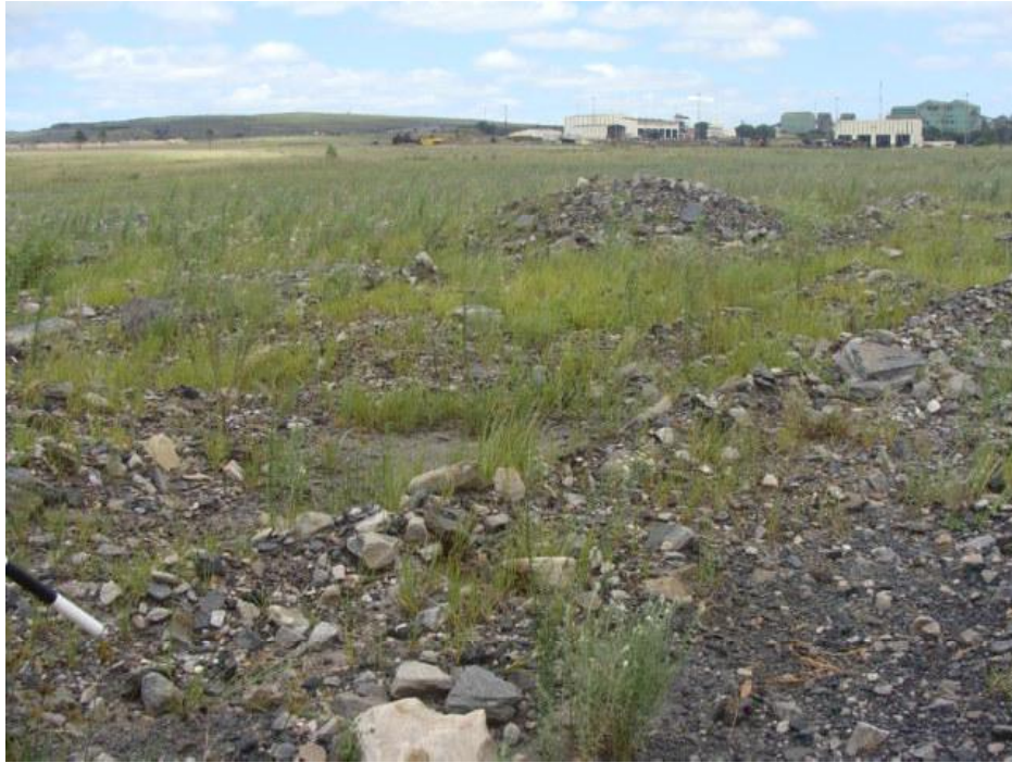
Figure 6 Another view of the surveyed area where the large dam is proposed.