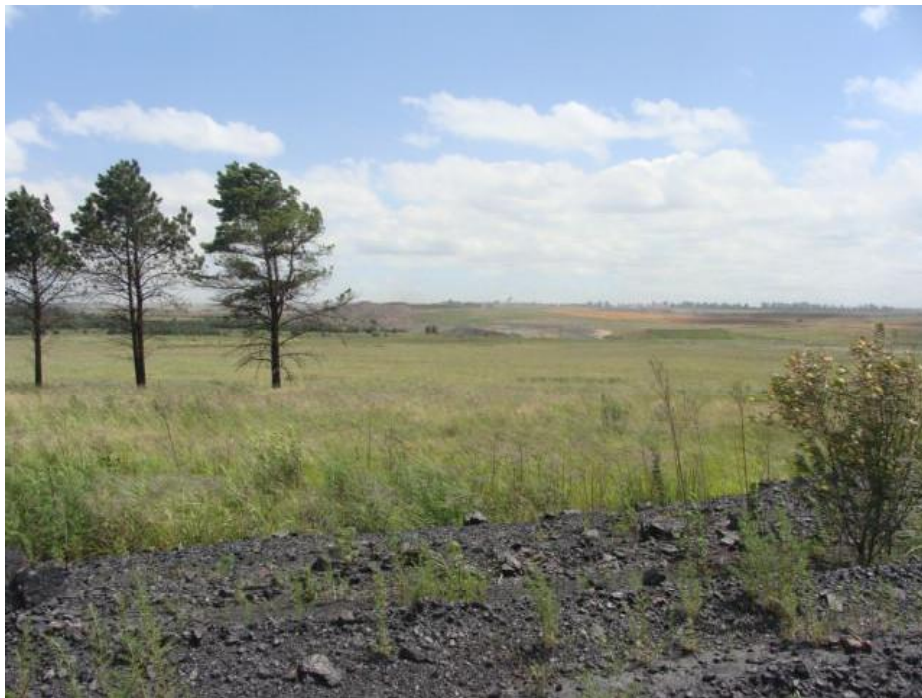
Figure 5 General view of the surveyed area where the large dam is proposed.