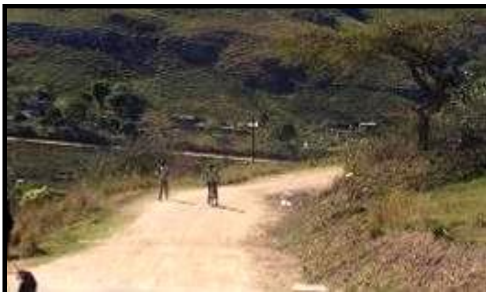
Figure 4. Human settlements occur adjacent to the existing dirt road but no graves occur within 30m from the existing road.