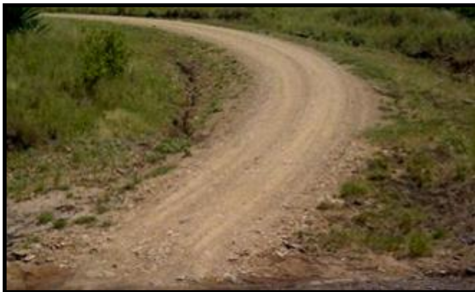
Figure 3. The existing road between Phenyane and Obazweni in Ward 15 near Nongoma.