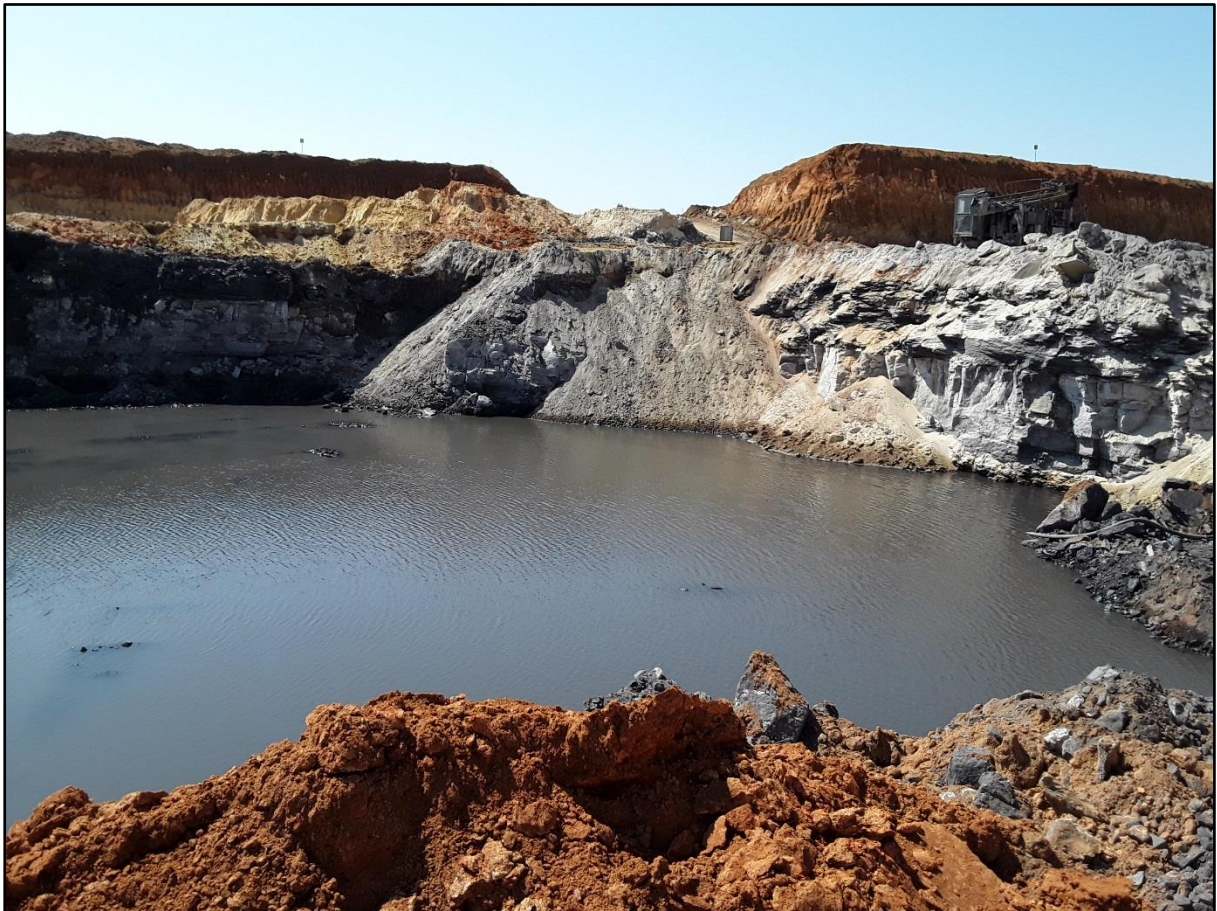
Figure 4: The opencast mining operations on the farm Kwaggafontein 8 IT, Pembani Colliery, in Mpumalanga, South Africa.

The following photographs were taken on a site visit to the proposed development site near Carolina on the 1 st April 2017.