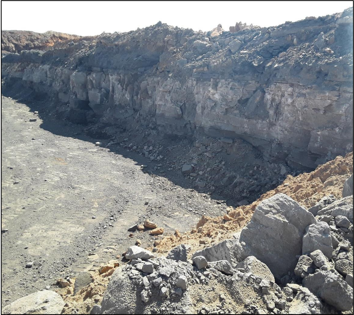
Figure 6: The opencast mining operations on the farm Kwaggafontein 8 IT, Pembani Colliery, in Mpumalanga, South Africa.