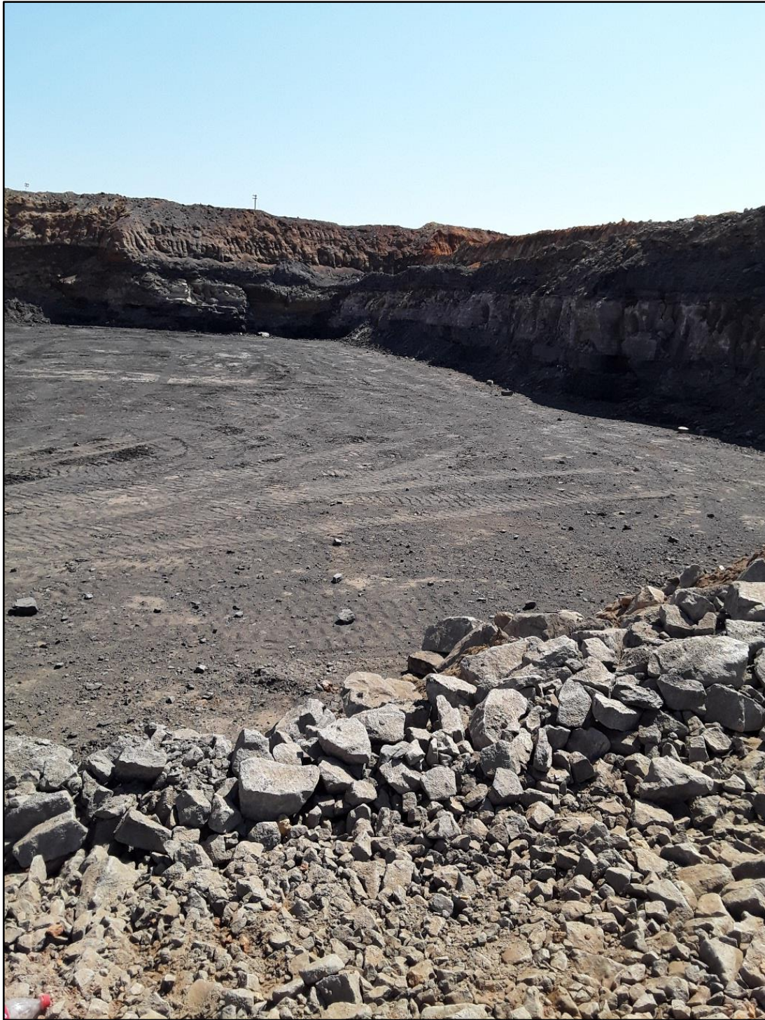
Figure 7: The opencast mining operations on the farm Kwaggafontein 8 IT, Pembani Colliery, in Mpumalanga, South Africa.