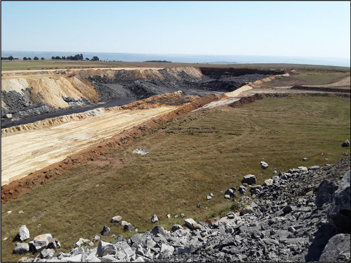
Figure 8: The opencast mining operations on the farm Kwaggafontein 8 IT, Pembani Colliery, in Mpumalanga, South Africa.