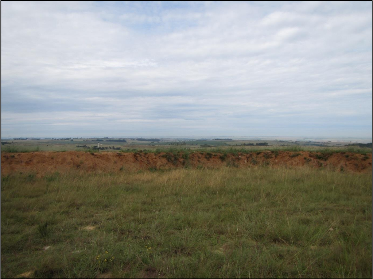
Figure 9: The low relief of the proposed development area on the farm Kwaggafontein 8 IT Pembani Colliery, in Mpumalanga, South Africa. The development area has no exposures visible on the surface.