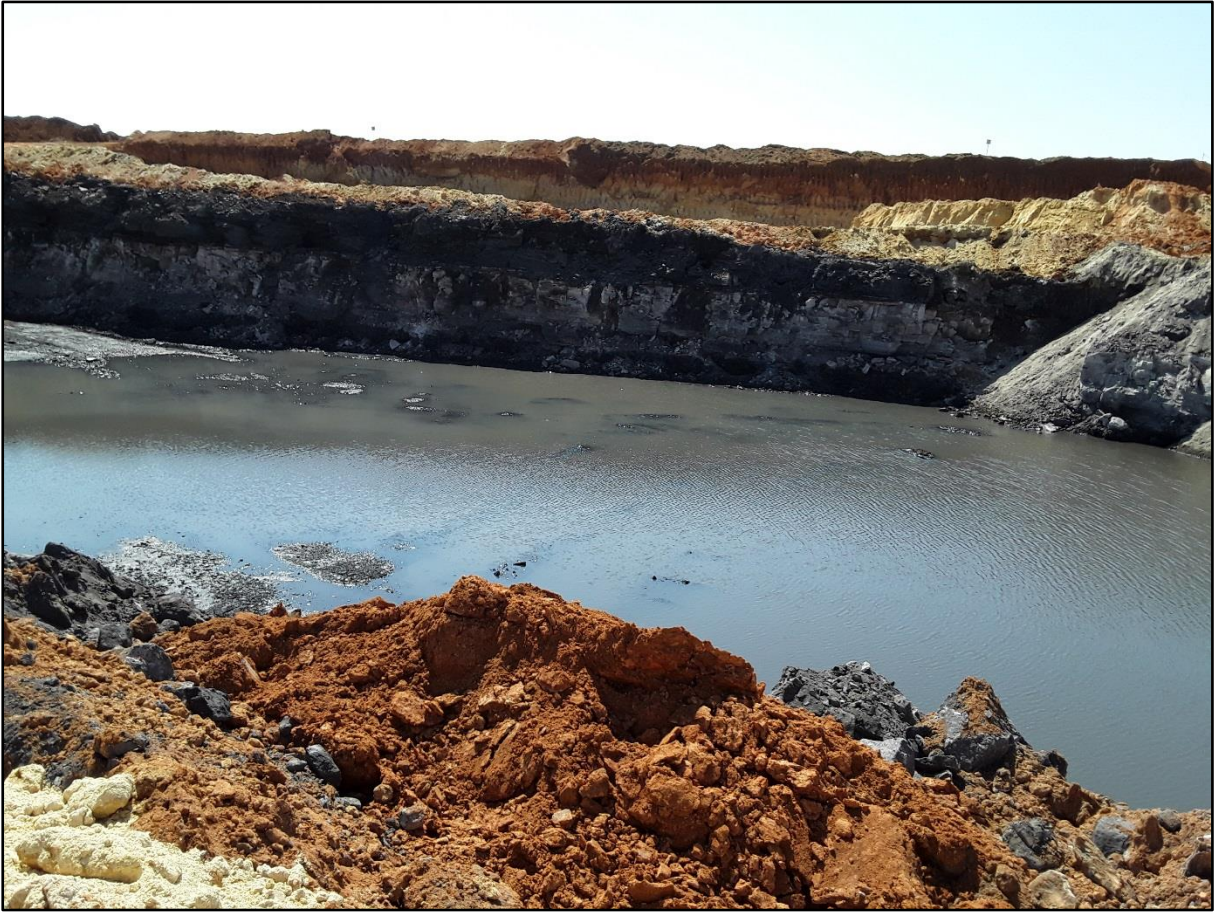
Figure 5: The opencast mining operations on the farm Kwaggafontein 8 IT, Pembani Colliery, in Mpumalanga, South Africa.