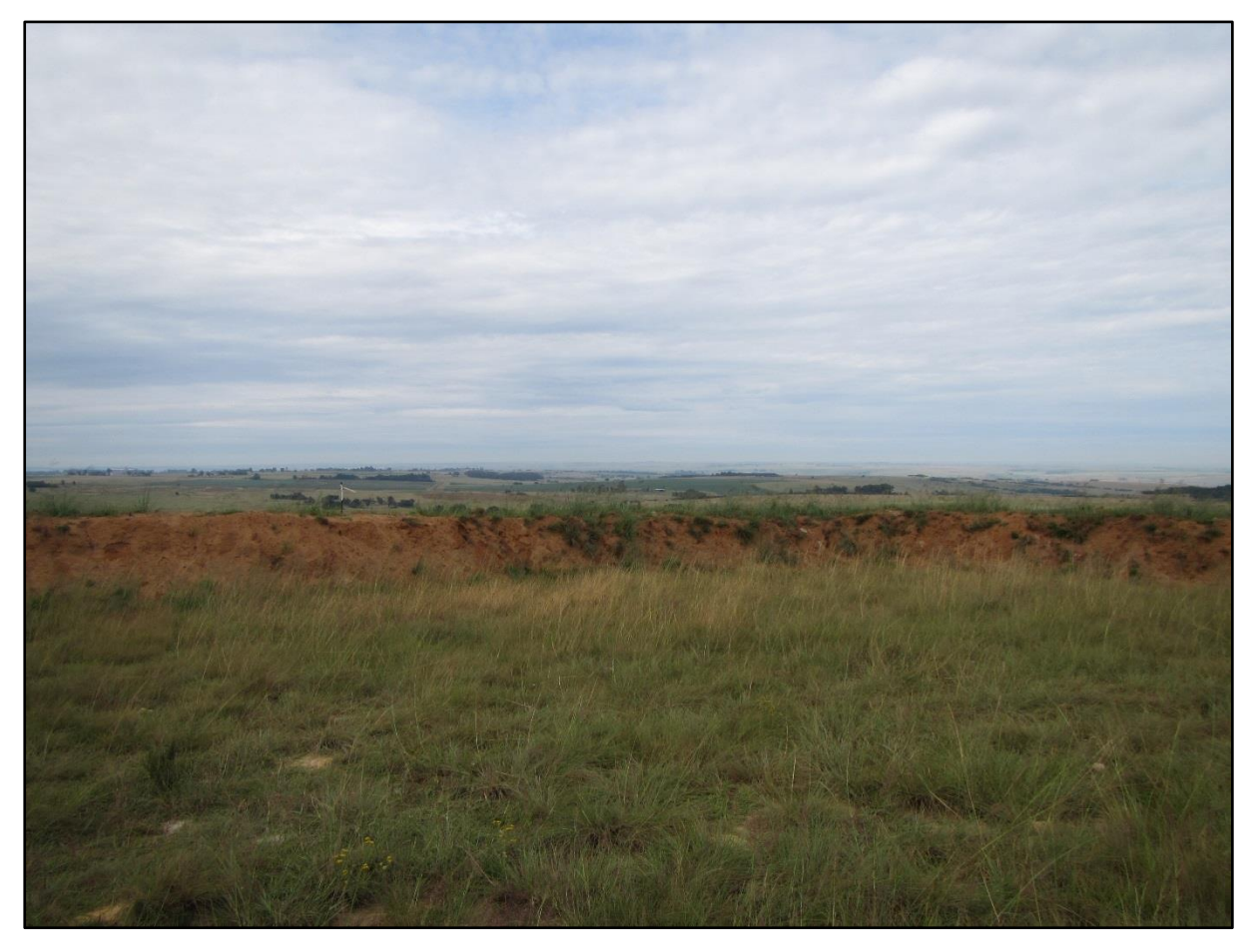
Figure 9: The low relief of the proposed development area on the farm Kwaggafontein 8 IT Pembani Colliery, in Mpumalanga, South Africa. The development area has no exposures visible on the surface.