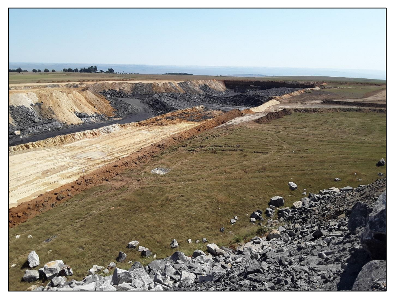
Figure 8: The opencast mining operations on the farm Kwaggafontein 8 IT, Pembani Colliery, in Mpumalanga, South Africa.