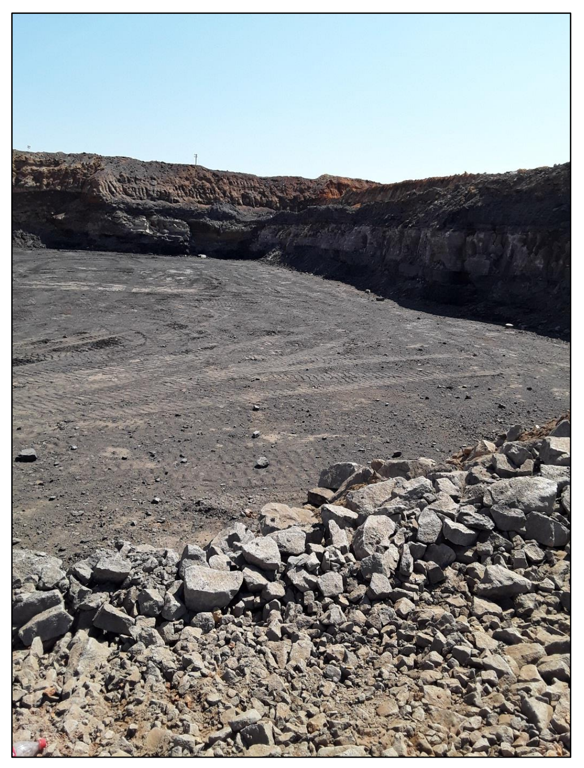
Figure 7: The opencast mining operations on the farm Kwaggafontein 8 IT, Pembani Colliery, in Mpumalanga, South Africa.