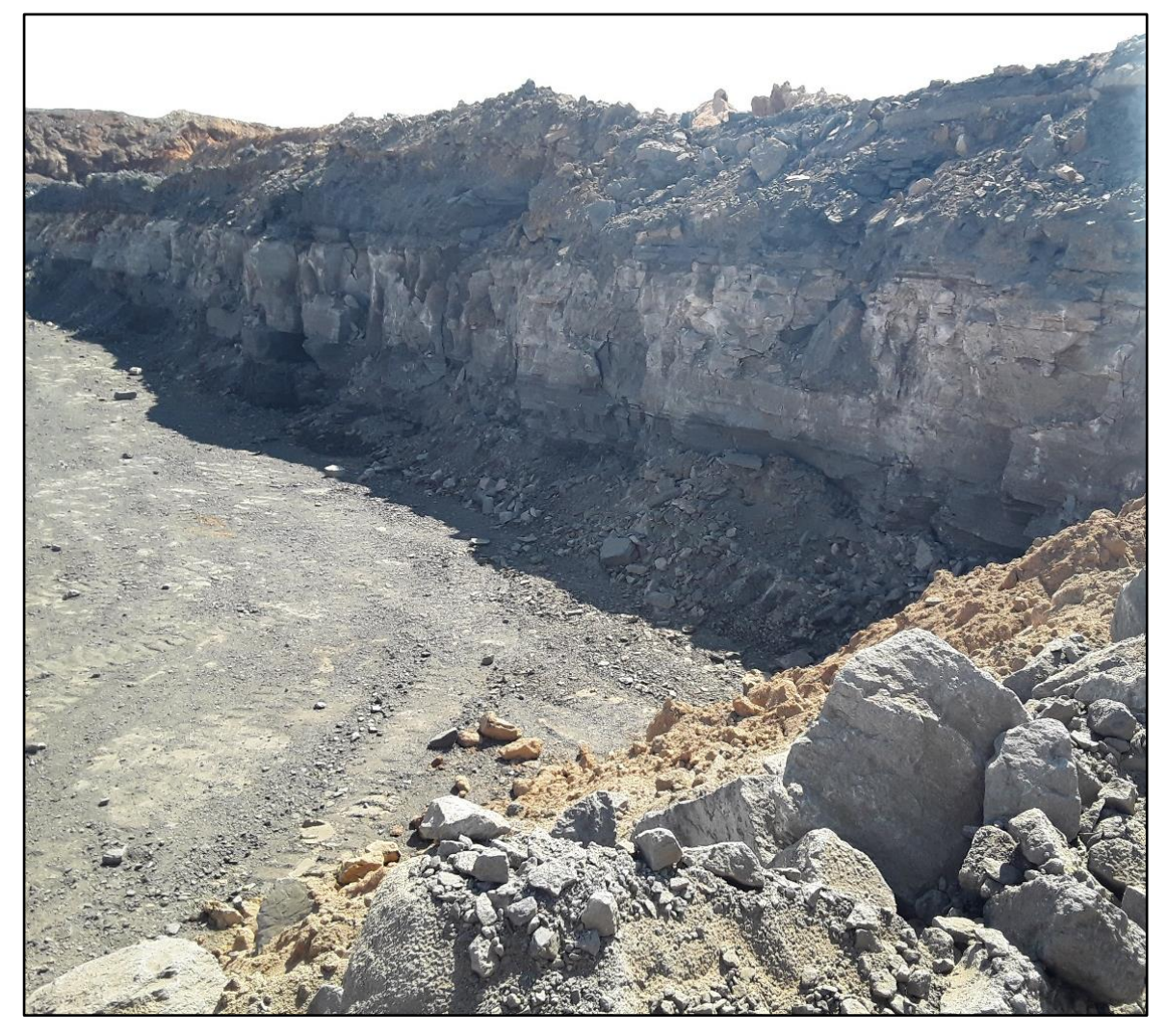
Figure 6: The opencast mining operations on the farm Kwaggafontein 8 IT, Pembani Colliery, in Mpumalanga, South Africa.