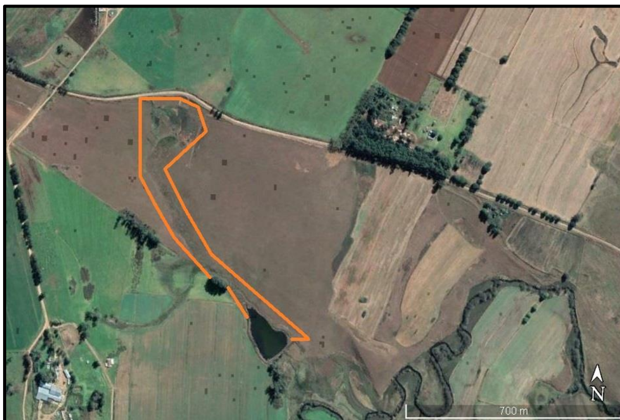
Figure 2: Satellite image showing a close-up view of the location of the site footprint. As can be seen in the image, a drainage line moves through the property and a small buffer zone on either side of this streamlet (indicated with the orange polygon) is recommended in order to preserve the integrity of the system, as well as to preserve any in situ archaeological material which may be present adjacent to the streamlet. Modified from Google Earth, AfriGIS 2021