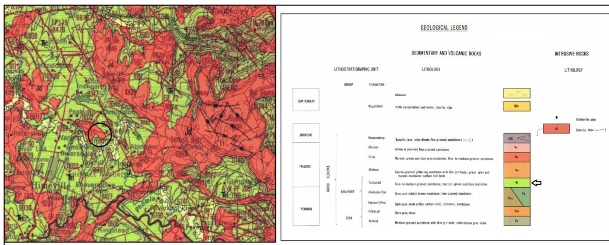
Figure 3: Map showing the geology of the region, where the proposed development (occurring within the black circle) will take place on top of dolerite (pink), with a very small portion of the site occurring on early Triassic-aged deposits (lime green). These rocks form part of the Tarkastad Formation of the Beaufort Group, indicated by a black arrow in the legend. Modified from 2928 Drakensberg, 1:250 000 Geological Series, Council for Geoscience, 1981)