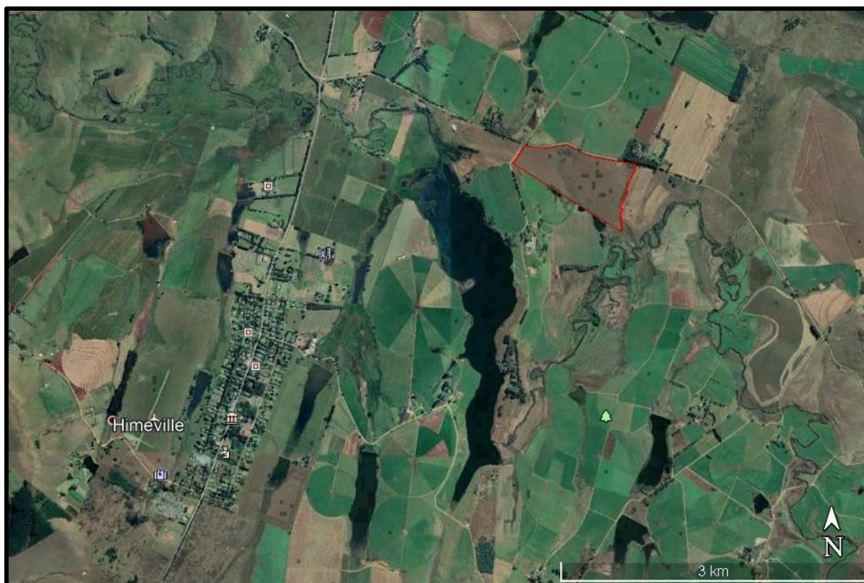
Figure 1: Satellite image showing the location of the site footprint within the regional landscape (indicated by the red polygon), located just to the north-east of Himeville at Inchgarth.