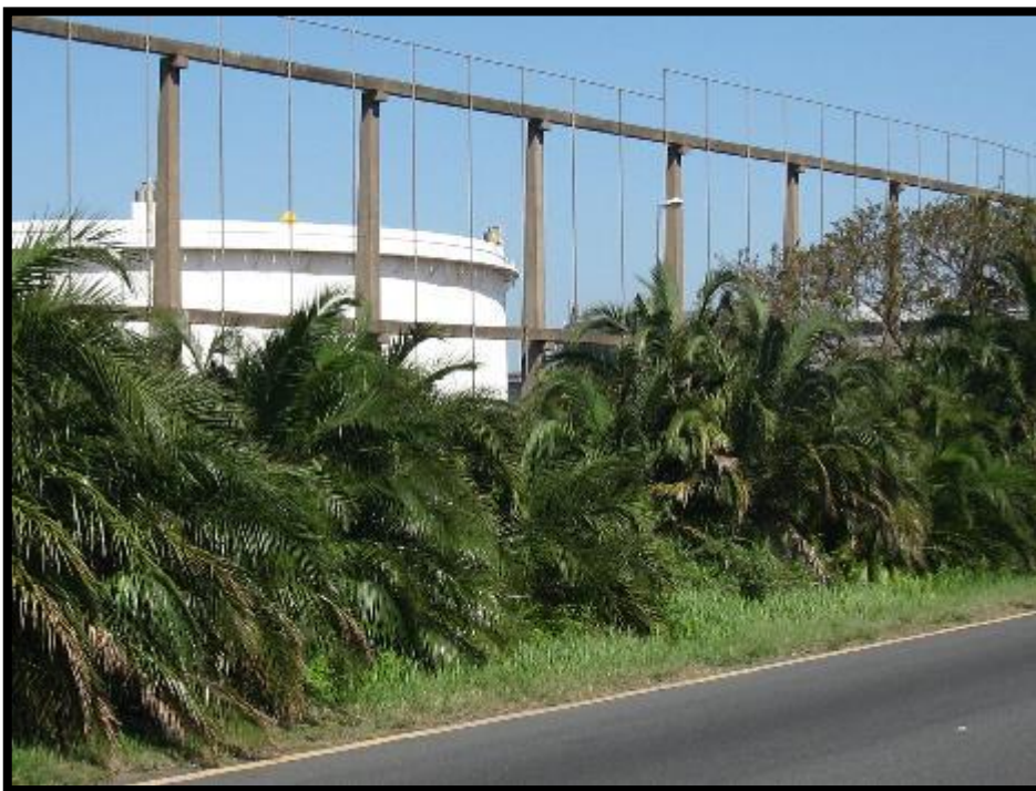
Figure 7. Light industry adjacent to the N2 at the Isipingo Interchange – central section.