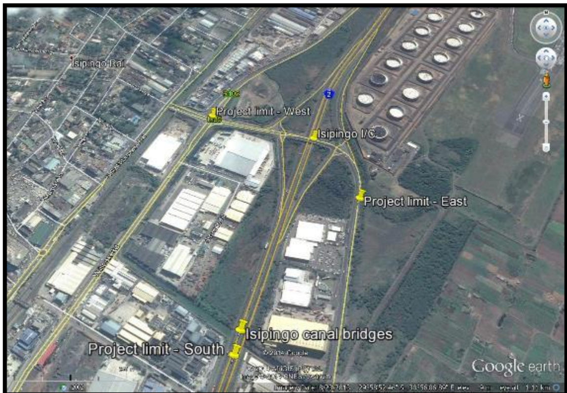
Figure 2. Google aerial photograph showing the extent of the footprint.