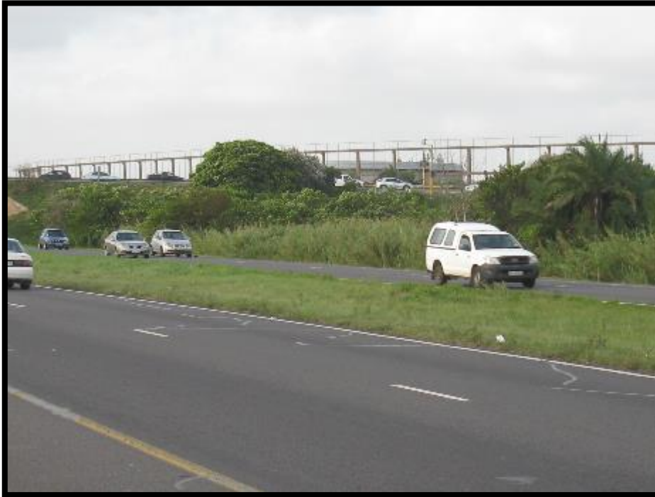
Figure 6. Light industry adjacent to the N2 at the Isipingo Interchange – southern aspect.