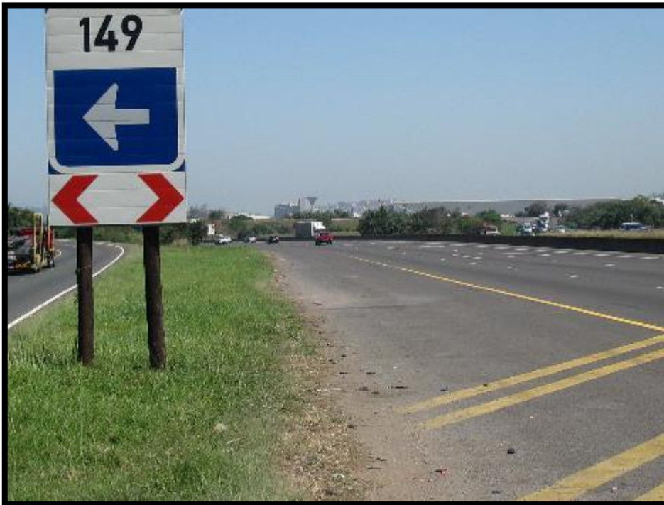
Figure 8. N2 Isipingo Interchange: northern section. No heritage sites or features occur on the footprint.