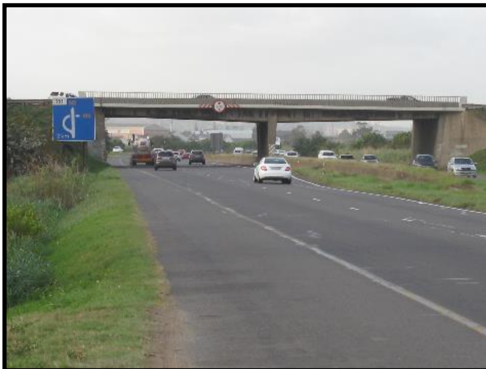
Figure 5. N2 Isipingo Interchange: southern aspect of Prospection Road Bridge over the N2.