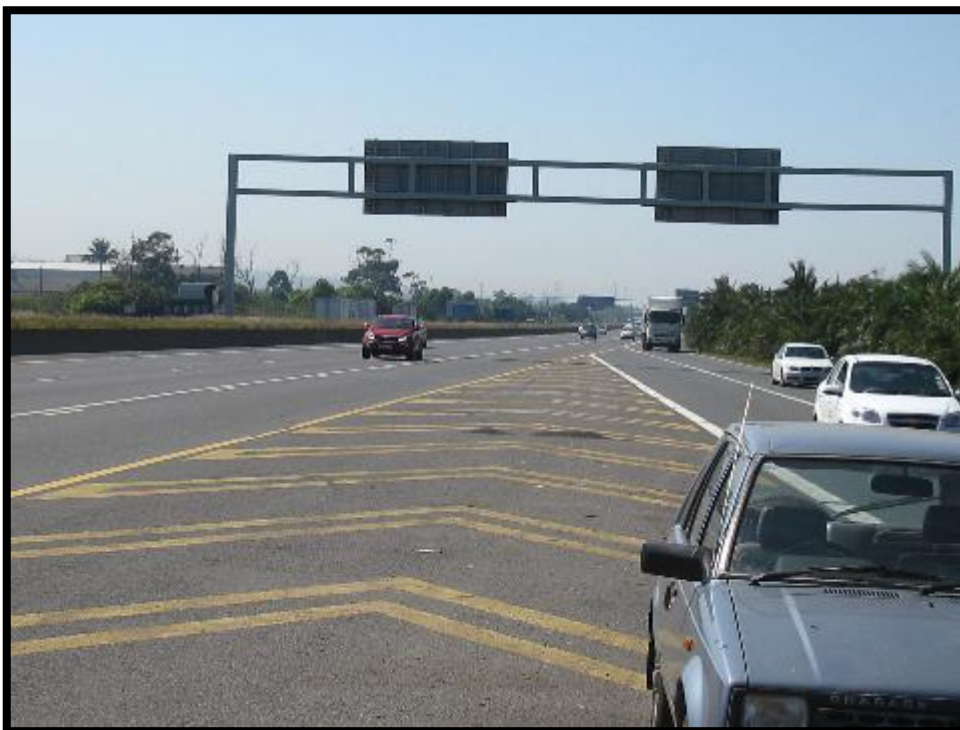
Figure 9. N2 Isipingo Interchange: northern section: No heritage sites or features occur on the footprint.