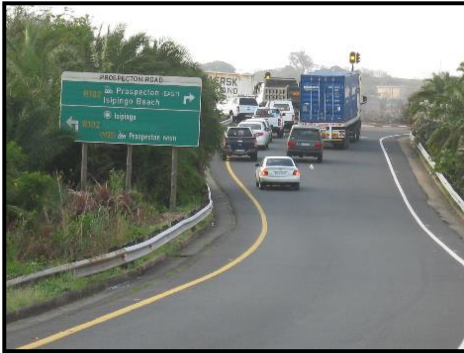
Figure 4. N2 Isipingo Interchange: south leading up to Prospection Road off-ramp