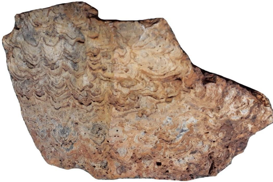
Figure 4: Example of a well-preserved stromatolite from the Archaean Era.