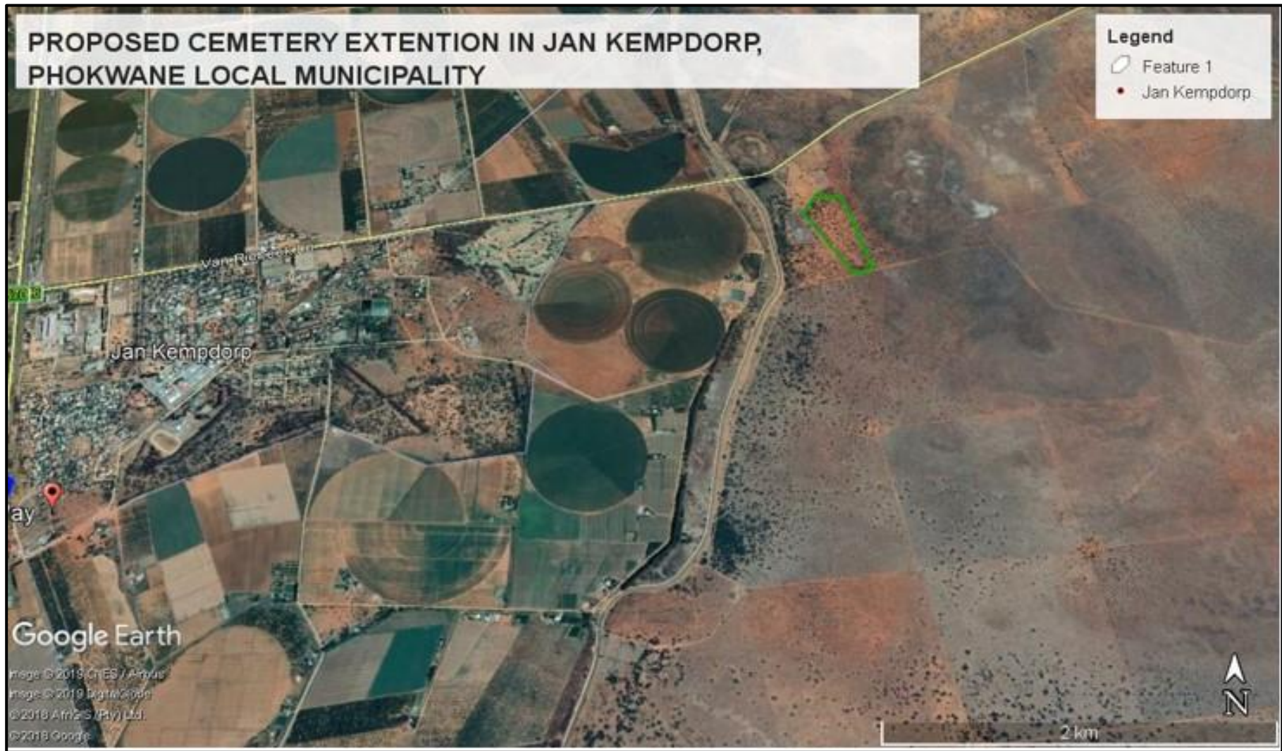
Figure 1: The proposed cemetery expansion indicated in green on Portion 43 of the Farm Guldenskat 36-HN, Northern Cape Province. Map provided by NSVT Consultants.