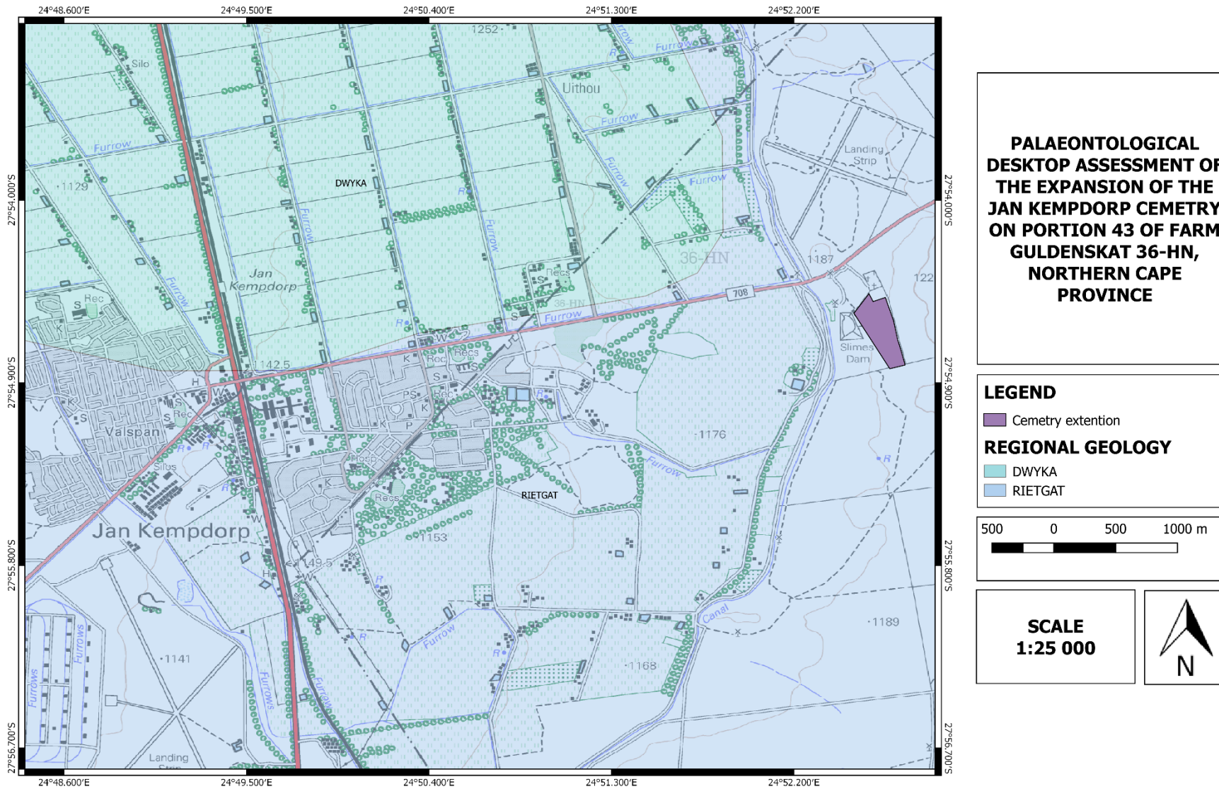
Figure 3: Surface geology of the proposed Jan Kempdorp cemetery expansion indicated in purple on Portion 43 of the Farm Guldenskat 36-HN, Northern Cape Province is entirely underlain by the Rietgat Formation, Platberg Group, Ventersdorp Supergroup. The map was drawn by QGIS Desktop 2.18.18..