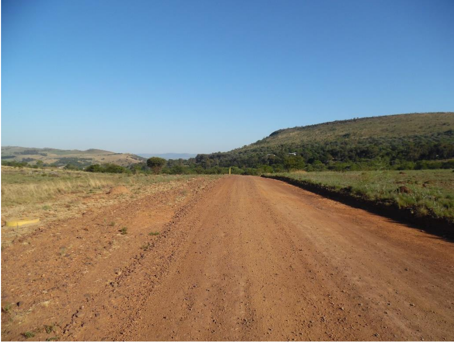
Figure 7: Site characteristics