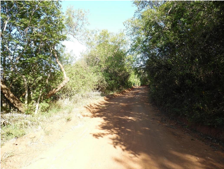
Figure 10: Site characteristics