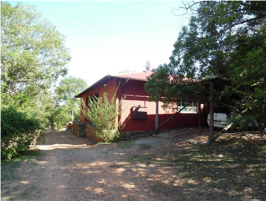
Figure 12: a Structure older than 60 years are situated near the proposed new access road