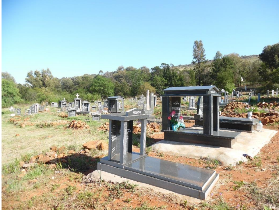
Figure 15: Cemetery 3 (approx.150 graves): Situated near cemetery 2 (S 25° 59'04.4 E027° 33'00.8'') (circa 1980-present)

The possibility of graves not visible to the human eye always exists and this should be taken into consideration in the Environmental Management Plan.