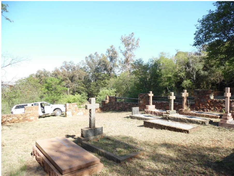
Figure 14: Cemetery 2 (approx. 10 graves): Situated near end point of proposed development (S 25° 59'01.2 E027° 32'54.1") (circa 1960-1980)