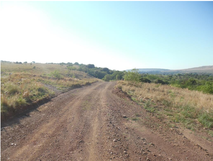
Figure 6: Site characteristics