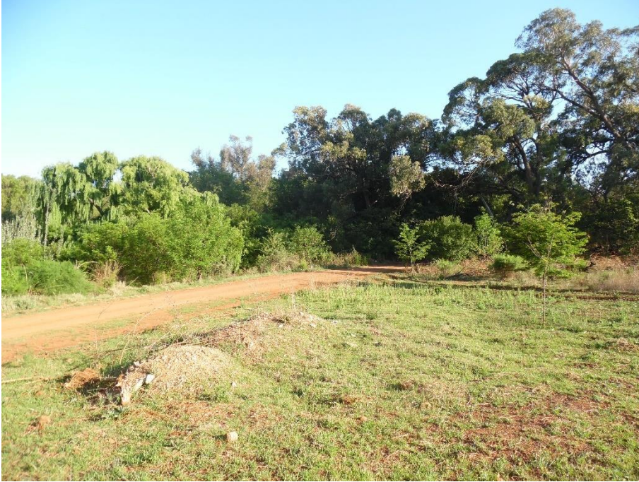
Figure 3: Site characteristics