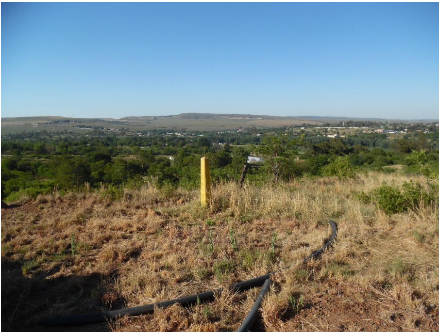
Figure 8: A waterpipeline runs adjacent to the proposed development