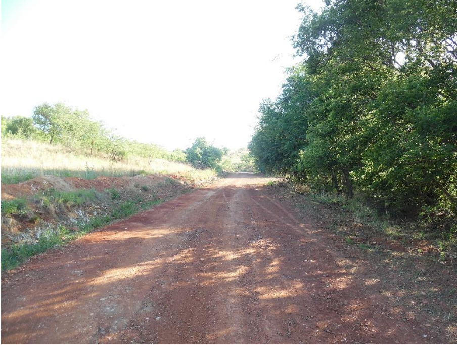
Figure 5: Site characteristics