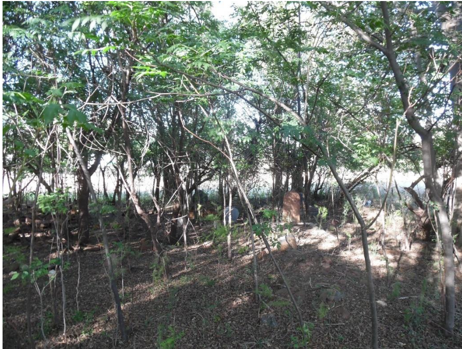
Figure 13: Cemetery 1 (approx. 30 graves): Situated near commencement point of the proposed development (S 25° 59'22.4 E027° 33'06.0") (circa prior to 1940's)

Three cemeteries are situated in the greater study area.