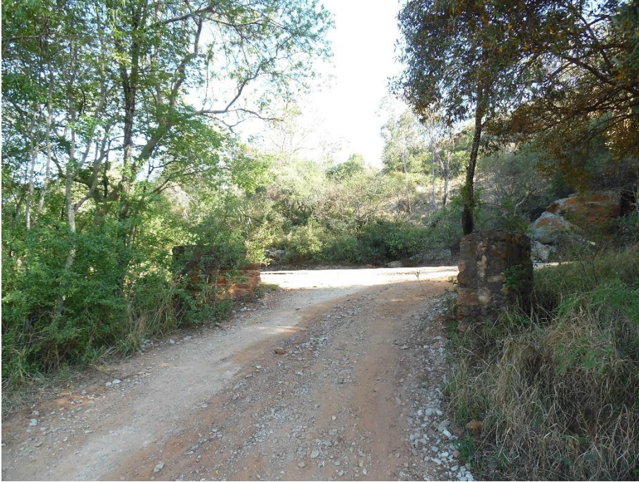
Figure 11: End point of proposed access road