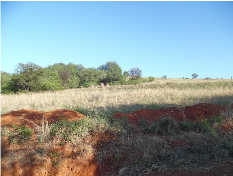
Figure 4: Site characteristics