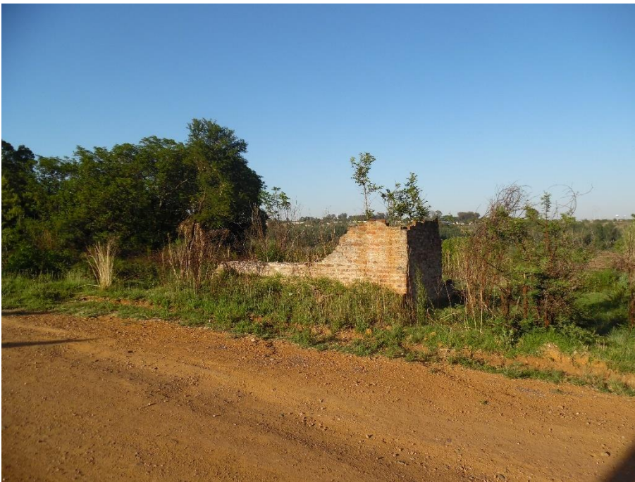
Figure 2: Commencement point of proposed access road (structure appears not to be older than 60 years)