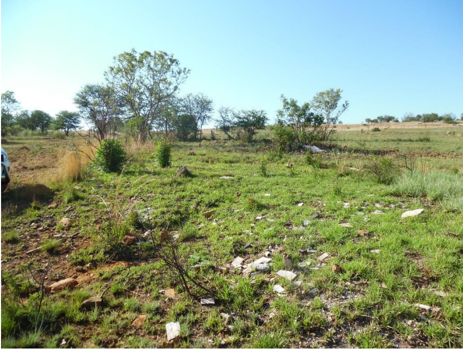
Figure 9: Illegal dumping en route