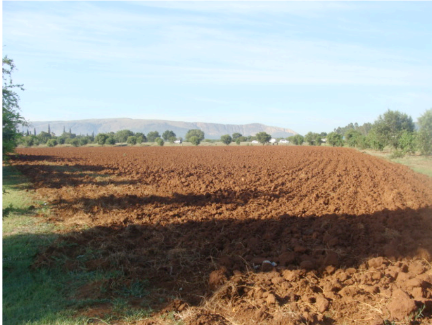
Figure 4: View of the site showing it being almost completely ploughed.

As a result of the disturbance of the site, all possible signs of heritage resources would have been demolished. Therefore it is very unlikely that any archaeological or cultural historical site or occurrence will be disturbed.