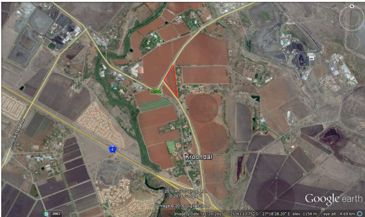
Figure 2: Location of the site (red triangle) in Kroondal.