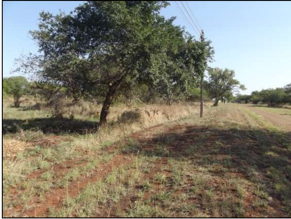
Fig. 1. General picture taken near the corner of Neate and Beugemann Streets.