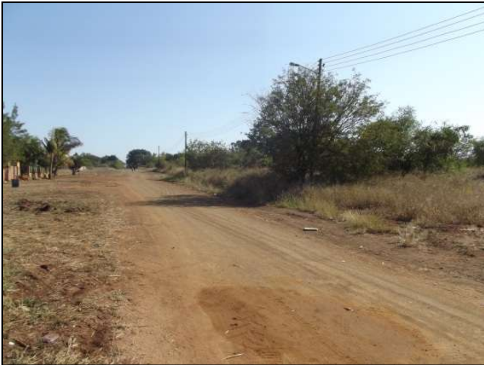
Fig. 6. Photo near the corner of Bourhill and Neate Streets taken in north-western direction.