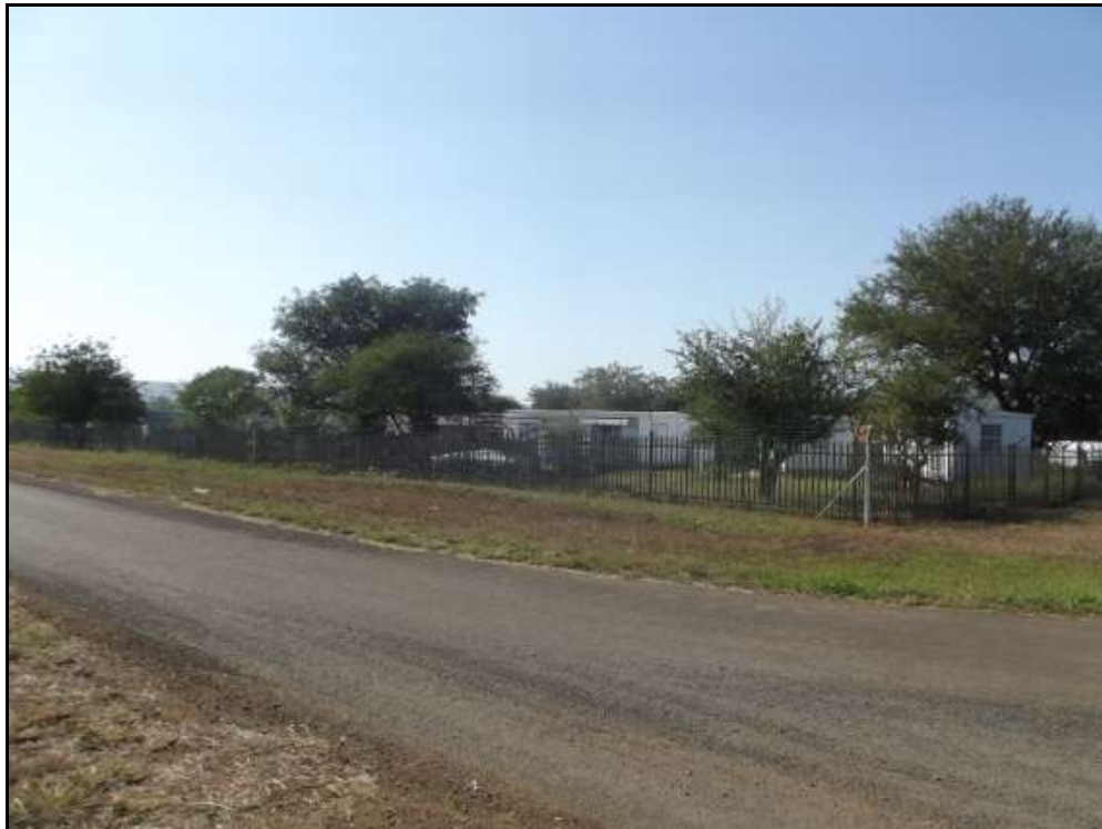
Fig. 4. Photo taken on the corner of Bucklee and Bourhill Streets in south-eastern direction.