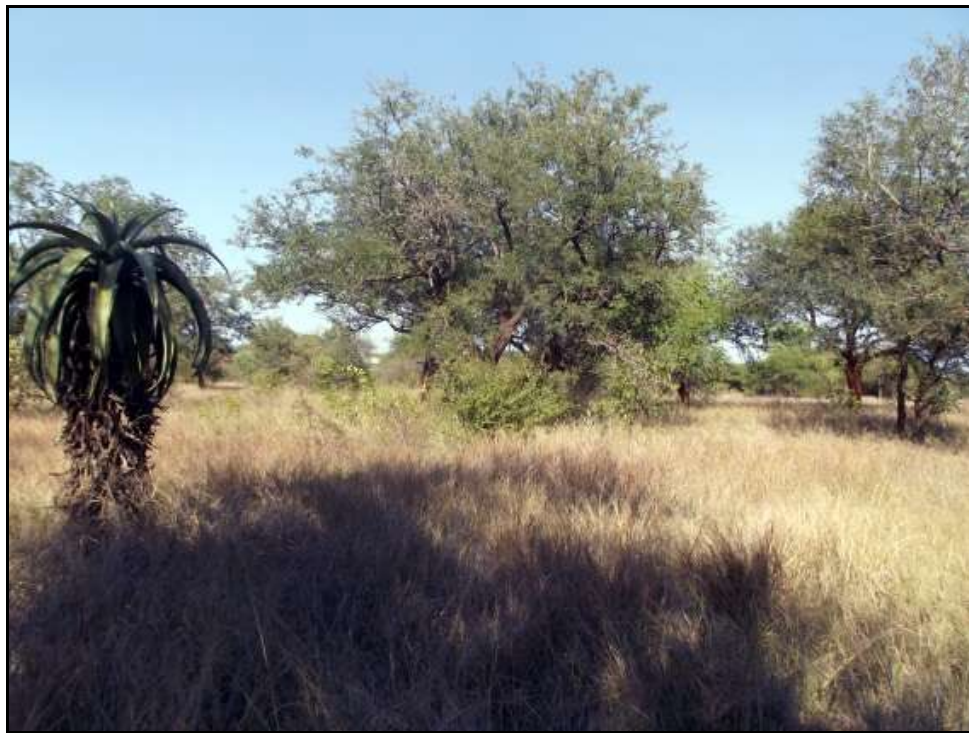
Fig. 2. General photo of the terrain taken in southern direction.