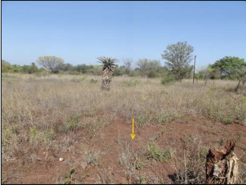
Fig. 5. Site KN 1. Yellow arrow indicates the area where the pottery sherds were found.