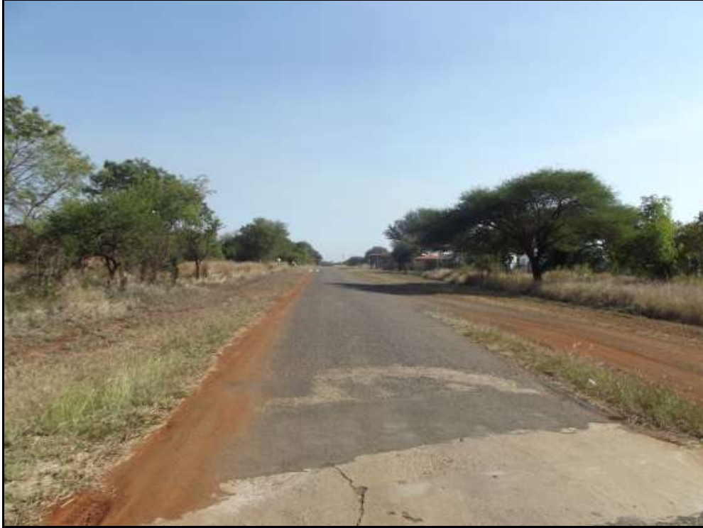
Fig. 3. Photo in Bourhill Street taken in north-western direction.