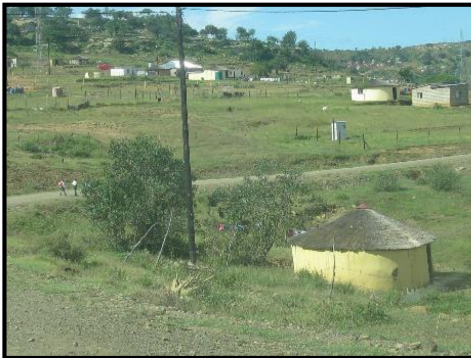
Figure 12. The Dispersed Nguni Settlement Pattern is still evident in sections of the eastern portion of the project area. However, this 'cultural landscape' will not be altered by the proposed water works development.