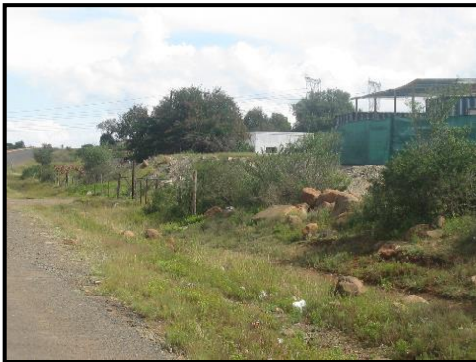
Figure 7. Residential homes and other structures occur adjacent to the road network but none of these are older than 60 years.