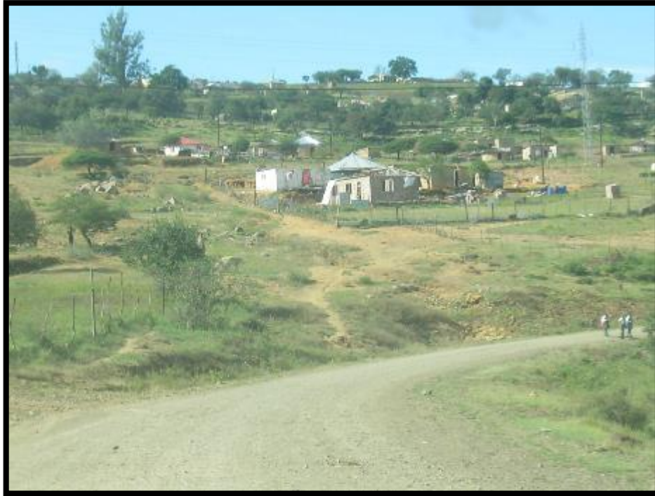
Figure 11. Kwa Kopi eastern section: no heritage sites or features occur within 50m from the road (and proposed pipeline trajectory).