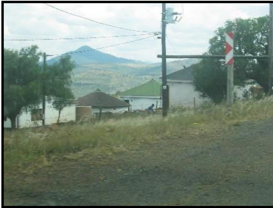
Figure 9. Although traditional homesteads are situated adjacent to the existing roads (and proposed pipeline trajectory) none of them had associated graves.