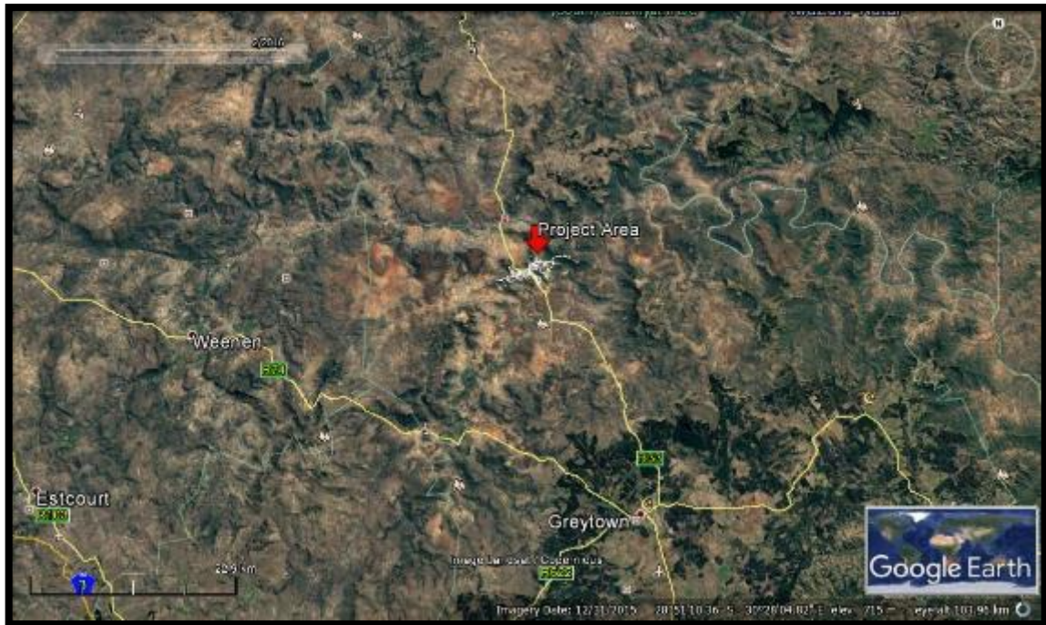
Figure 1. Google Earth Imagery showing the location of the project area near Tugela Ferry, KZN