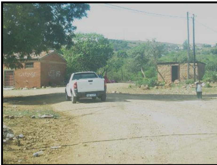
Figure 10. Start of the road network (and proposed pipeline trajectory) on the eastern side of the R33. All the buildings appear to be younger than 60 years old.