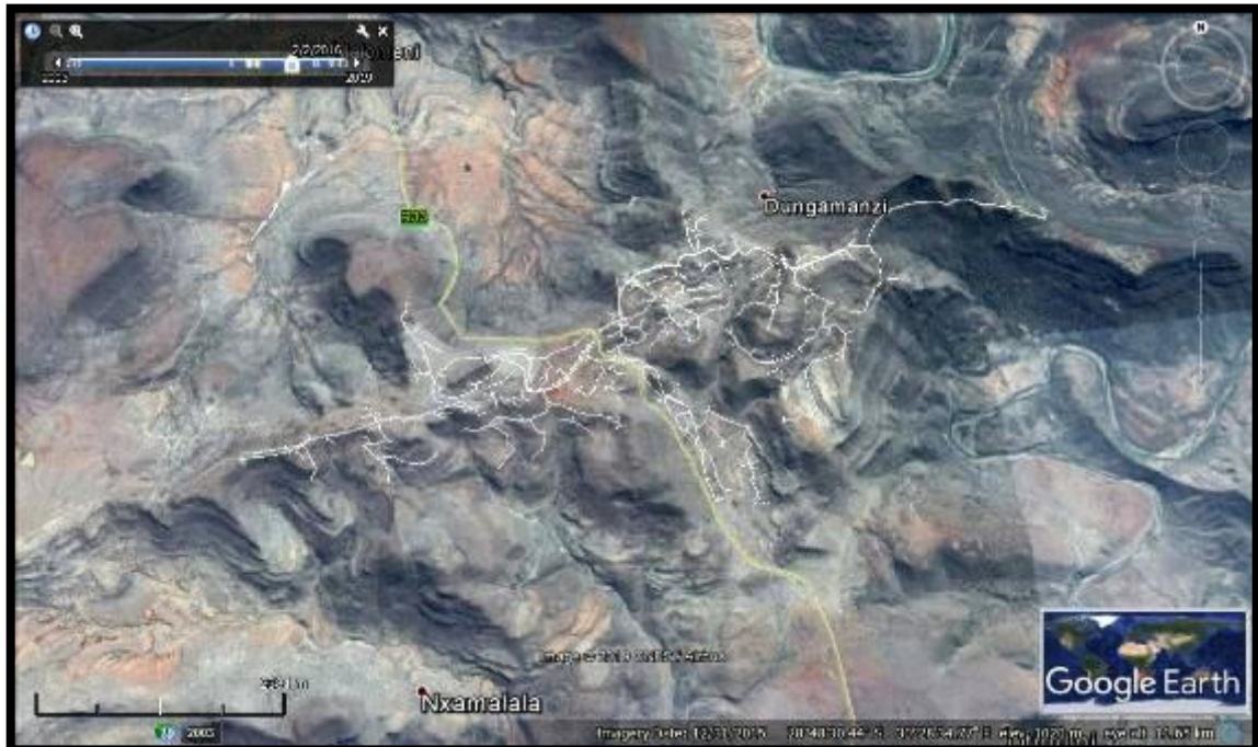
Figure 2. Google Earth Imagery showing the location of the proposed Kwa Kopi Water Works. The proposed pipelines follows the existing road network of the area.