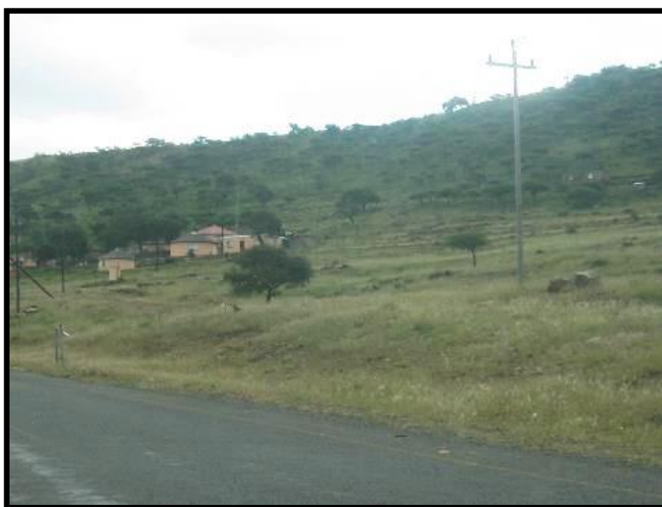
Figure 8. Western Section of the proposed Kwa Kopi Waterworks: no heritage sites or graves occur within 50 m form the road (and the proposed pipeline trajectory).