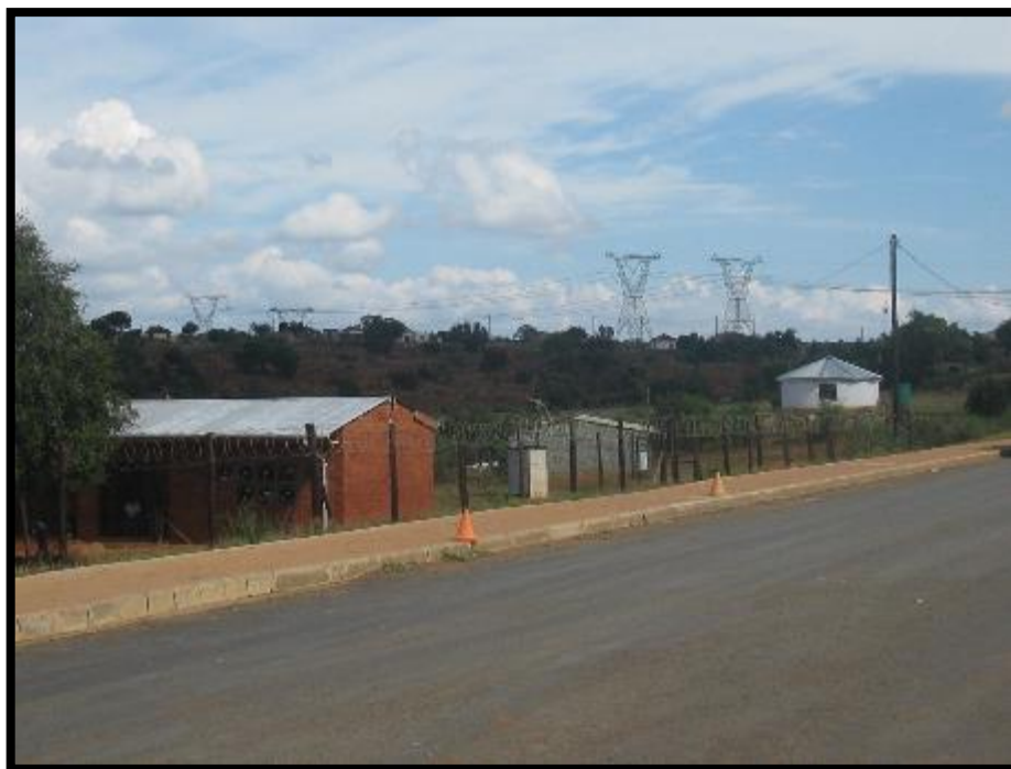
Figure 5. Start of the Kwa Kopi Water Works: road on the western side of the R 33.