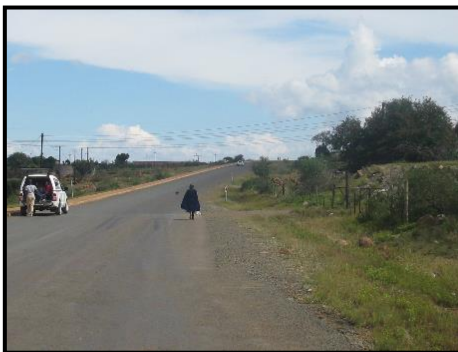
Figure 6. Photograph of main road on western side of the R 33. No heritage sites of features is visible within 50m from the existing road network.