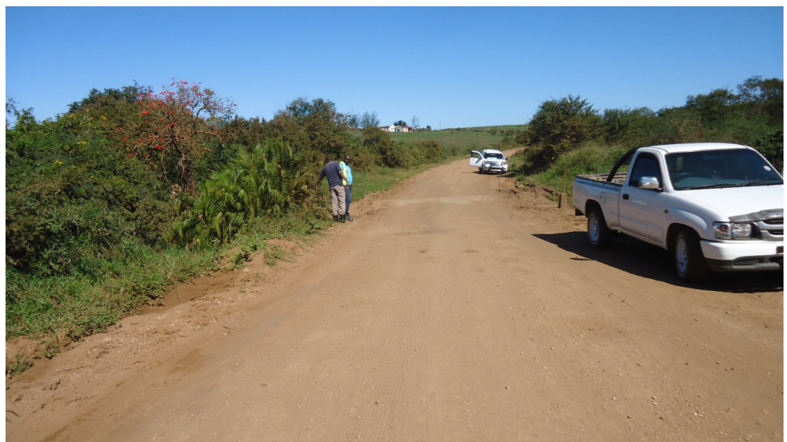
Culvert four - courtesy of Henwood and Nxumalo Consulting Engineers