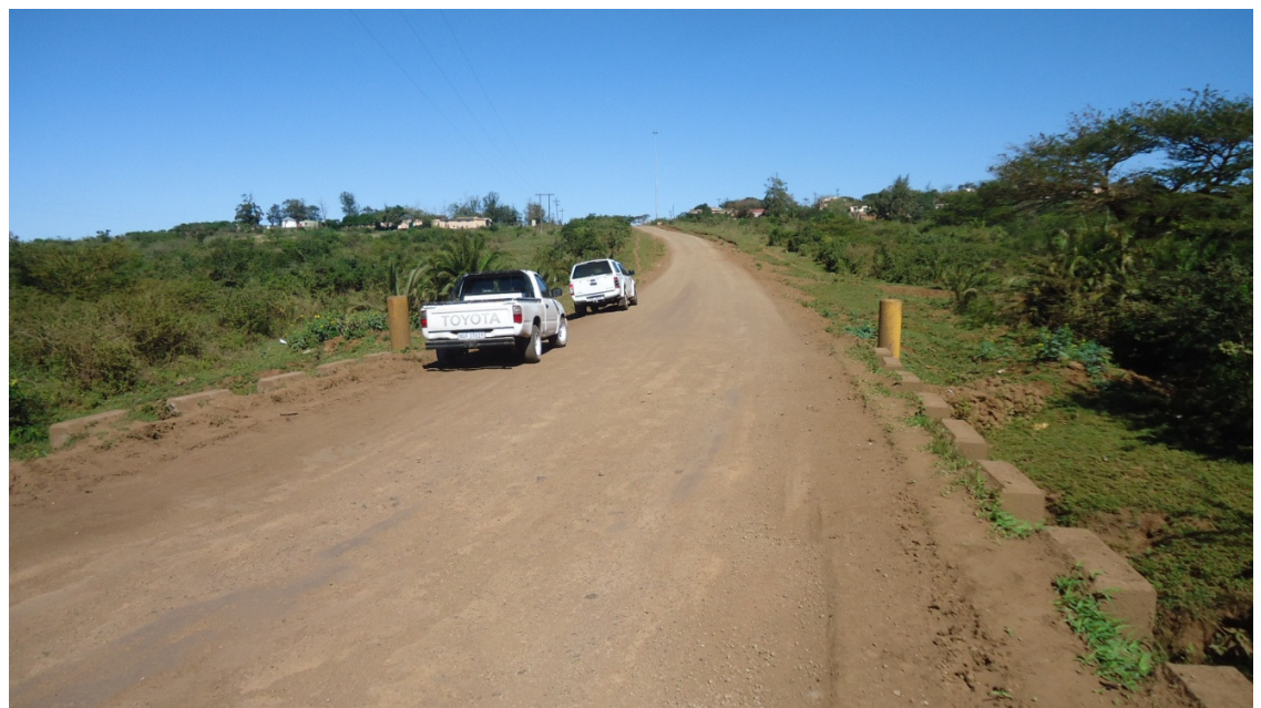
Culvert one