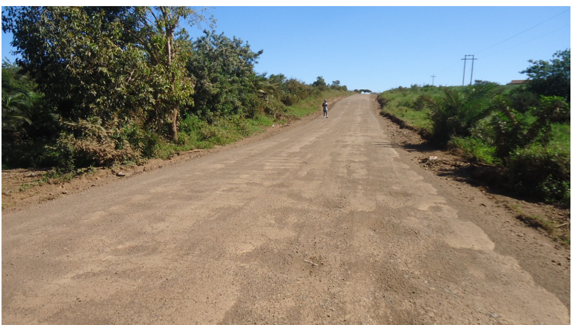
Culvert three