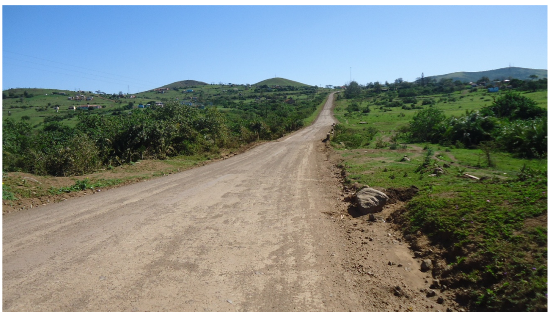
Culvert two - courtesy of Henwood and Nxumalo Consulting Engineers