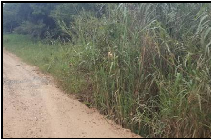
Figure 3. Watercourse 2. No heritage sites were located here.