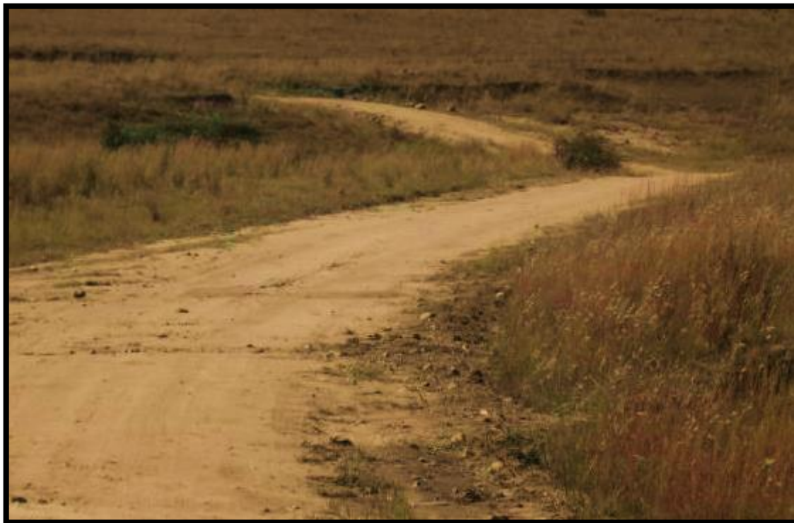
Figure 2. Photograph of the L 1867 Road. No heritage sites occur in the near environs of the footprint.