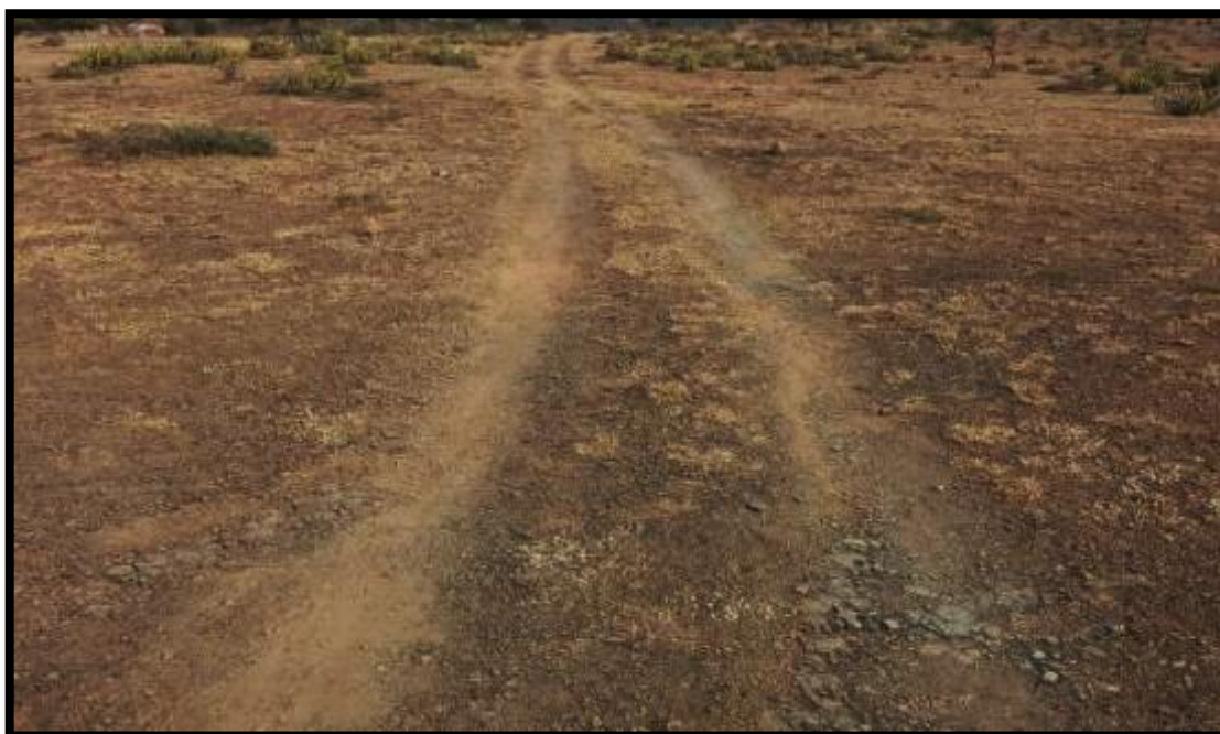
Figure 3. Large portions of the existing road is a mud track.