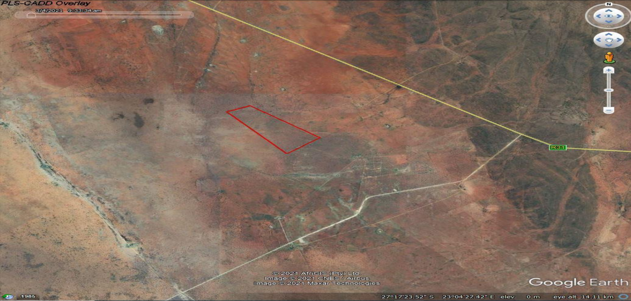
Figure 1: Google Earth photo indicating study site (Red Polygon).