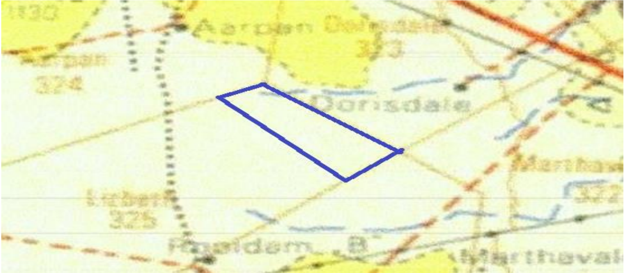
Figure 2: Geology map of the study site (blue polygon) and surroundings. Adapted from the 2722 Kuruman 1: 250 000 Geology Map (Geological Survey, 1979)