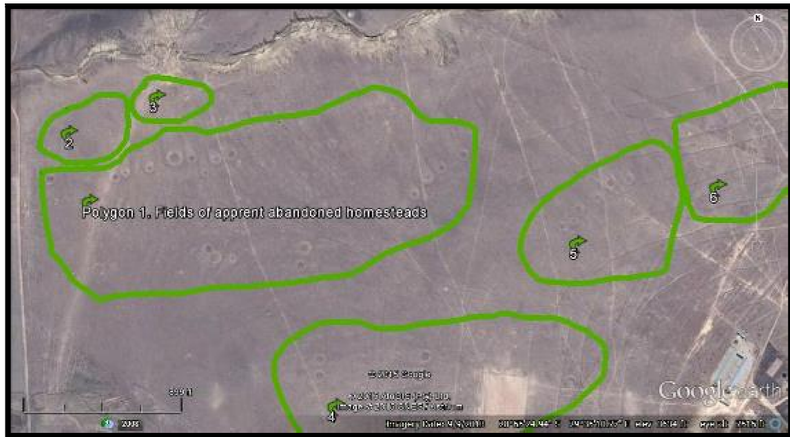
Map 2. Google Image of the study area and polygons enclosing sensitive extended abandoned Zulu homesteads, Farm Assegai Hoek, Loskop.