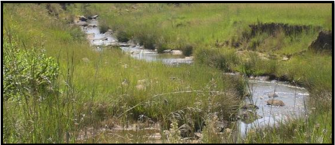
Figure 3. Little Tugela River that feeds into the proposed dam.