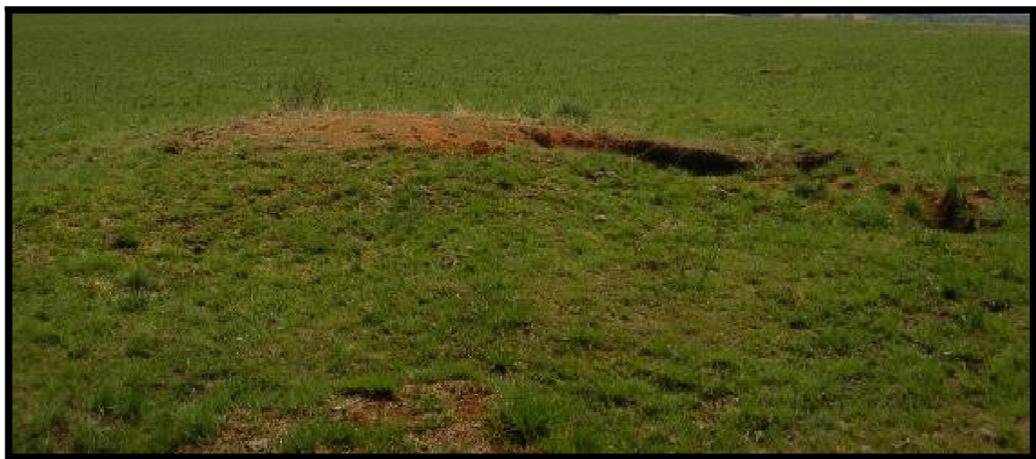
Figure 1. Photo of old abandoned homestead foundation.