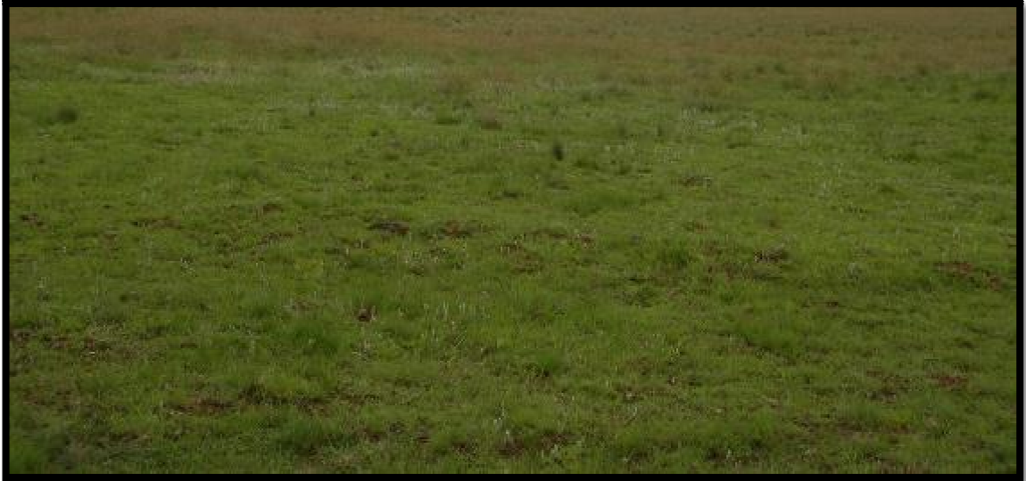
Figure 2. Disturbed ground indicating the possible layout of an abandoned homestead and other archaeological features.