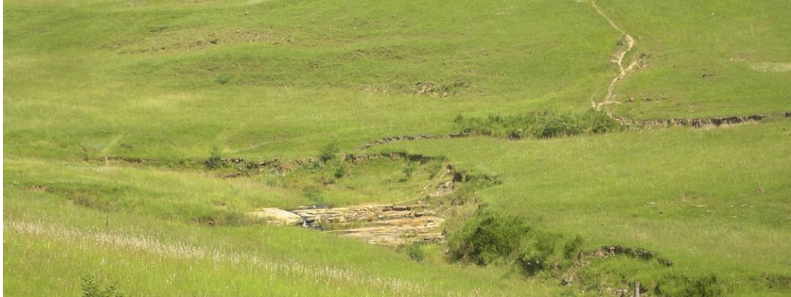
Figure 3. The proposed dam site will be situated along a rivulet.