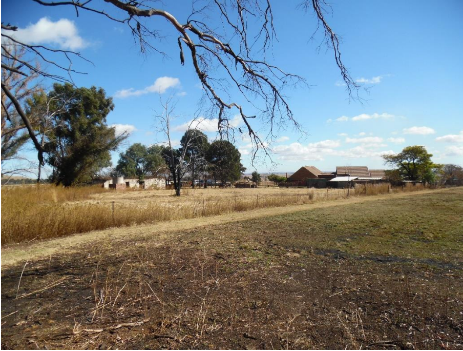
Photograph 2: Site characteristics