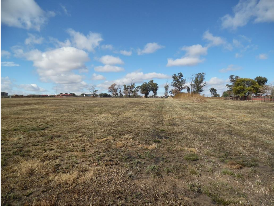
Photograph 4: Site characteristics