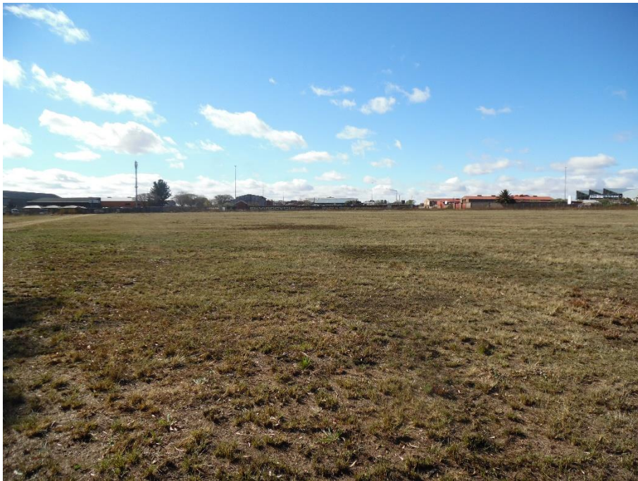
Photograph 1: Site characteristics