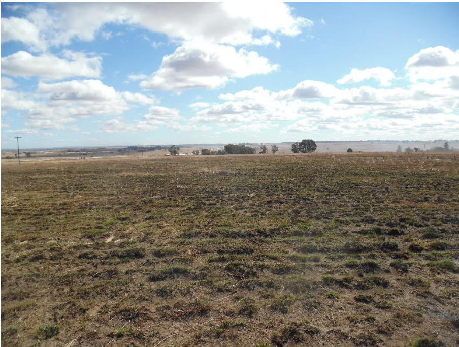
Photograph 5: Site characteristics