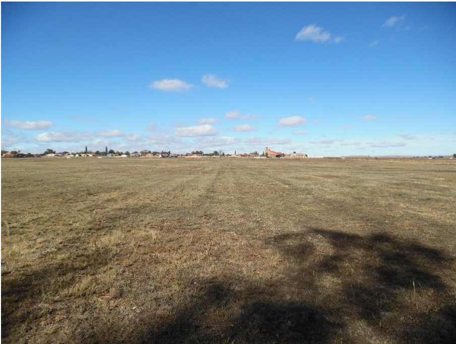
Photograph 3: Site characteristics